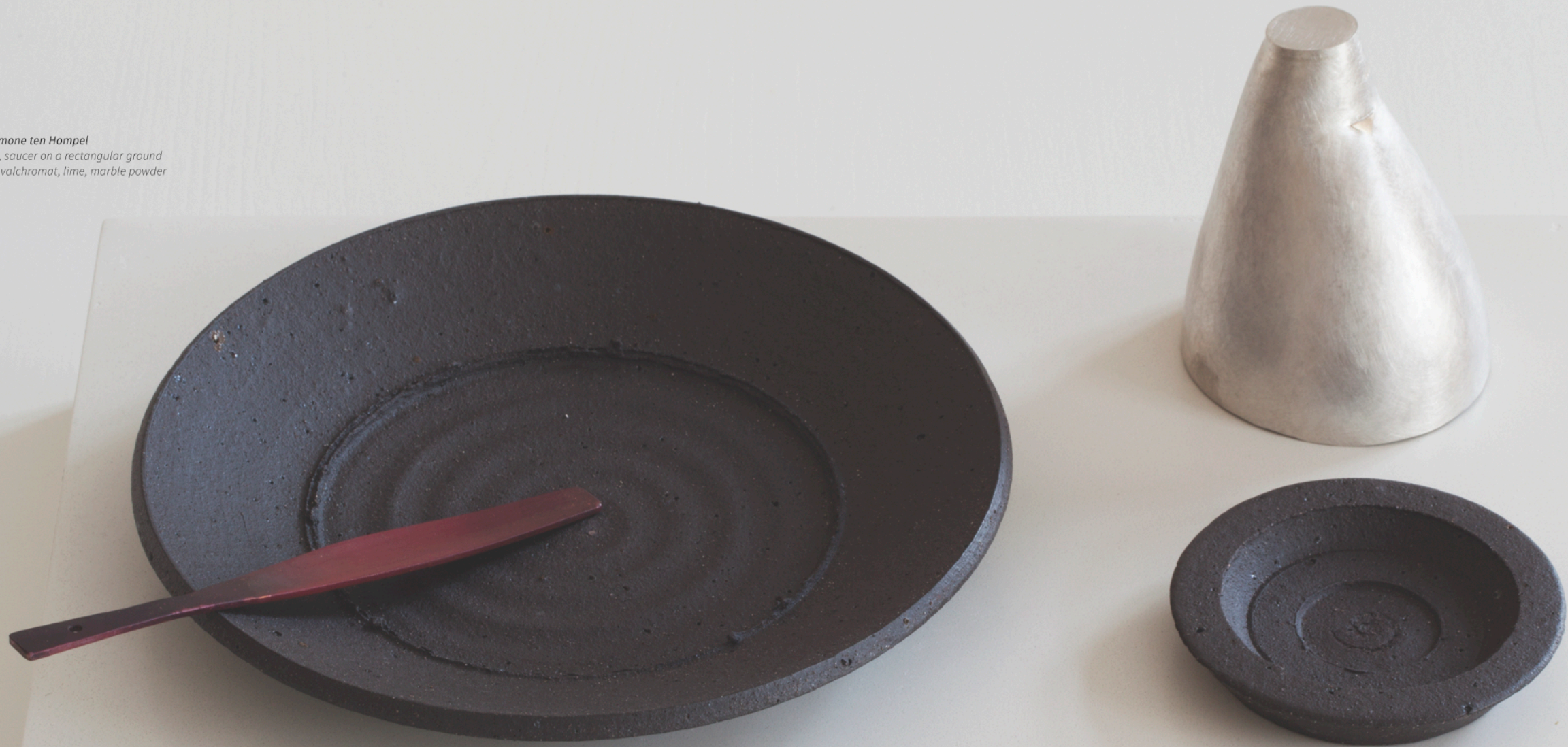
Julian Stair and Simone ten Hompel Plate, knife, beaker, saucer on a rectangular ground Etruria marl, silver, valchromat, lime, marble powder