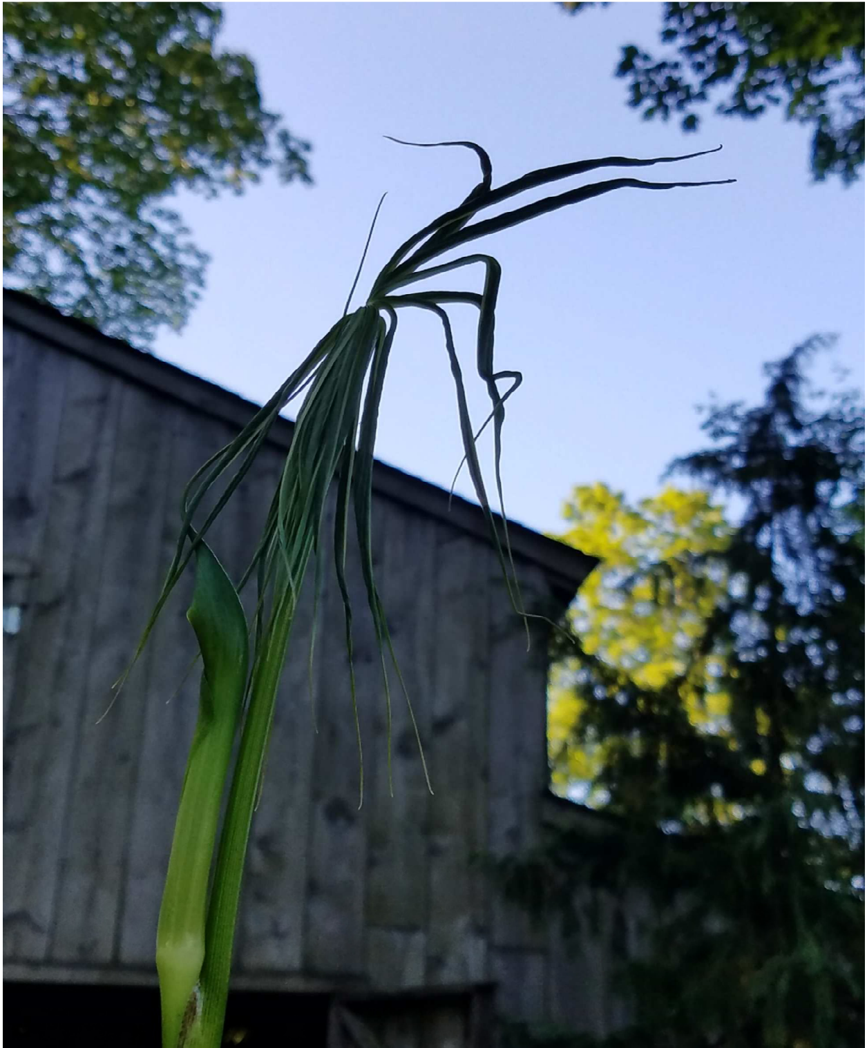
Arisaema consanguineum – Himalayan Jack-in-the Pulpit

Often the emerging foliage of certain Arisaemas appear as if they are chicks hatching out of an egg, very prehistoric looking! One of these is Arisaema consanguineum . As with many of the Jacks, A. consanguineum has exceptional foliage, as well as variegated selections.