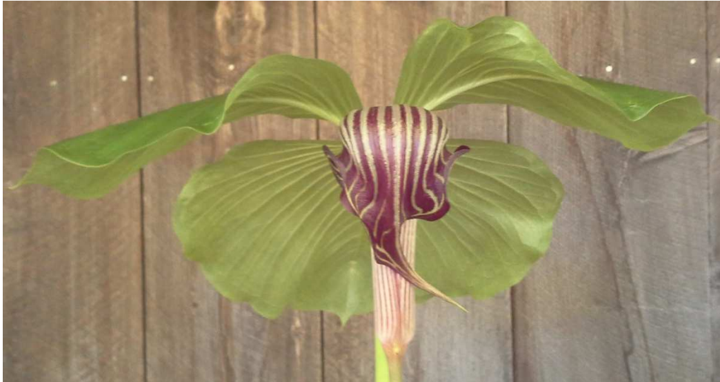
Arisaema fargesii – Chinese Cobra Lily

One of the most dramatic “Jacks” is Arisaema fargesii , it is native to China. Featuring large, glossy, trifoliate leaves that emerge over the big, bold flowers that curls around it’s spadix. This is easy to grow and will offset nicely to form a colony quite quickly.