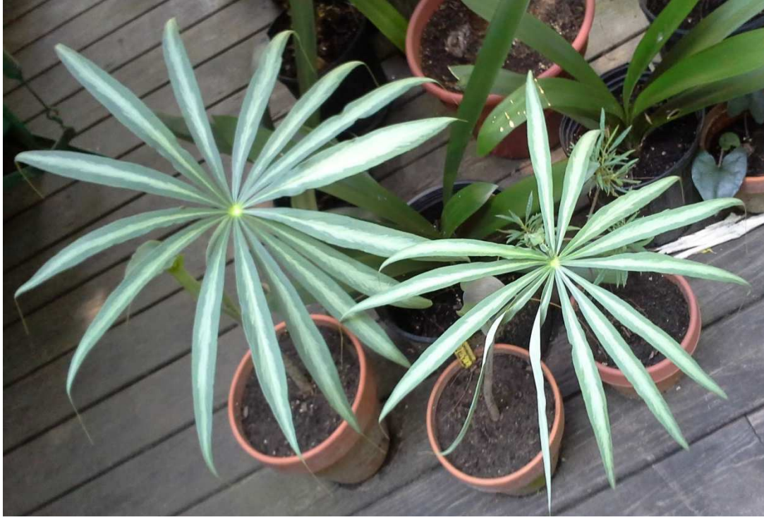
Arisaema consanguineum 'Wild Blue Yonder'