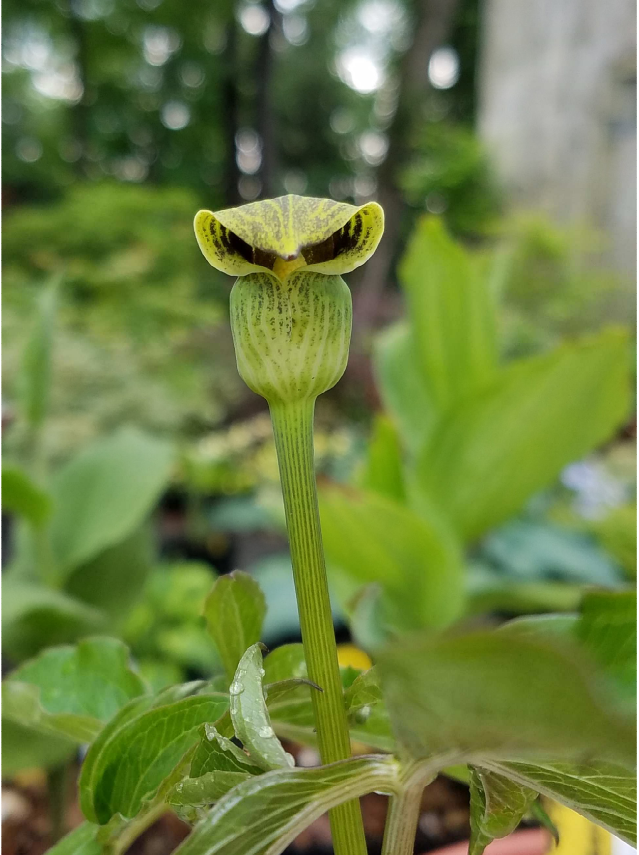
Here's to looking at you! Arisaema flavum – Owl-Faced Cobra Lily