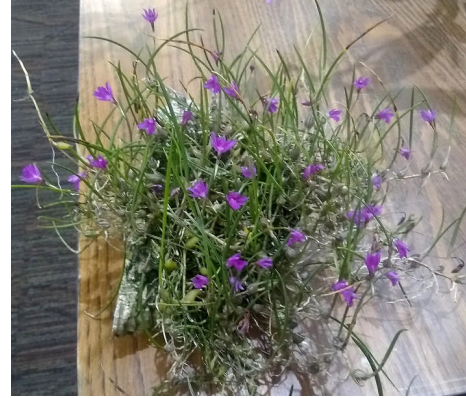
Isabella pulchella