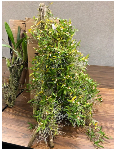
Dinema polybulbon