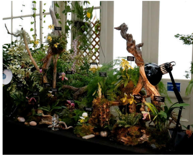
American Orchid Society Show Trophy 'Howard P. Martin'