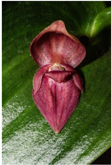
Pleurothallis Memoria Carlyle Luer

AOS members have exclusive access to thousands of awarded photos in OrchidPro! Sign on to the AOS website. Click on your name on the top right side of the page to find the dropdown menu. Select OrchidPro. Be inspired!