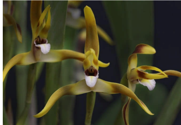
Maxillaria luteograndiflora 'Windy Hill'

https://secure.aos.org/orchid-awards.aspx