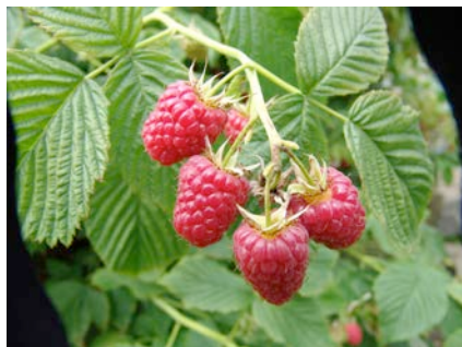
RASPBERRIES A delicious problem

BACHELOR BUTTON Centaurea Montana BUTTERCUPS Ranunculus repens CHICKWEED Cerastium vulgatum/Stellaria media CHINA MARY Campanula glomerata COMFREY Symphytum officinale /uplandicum DAISIES Chrysanthemum frutescens (marguerite type) DANDELIONS Taraxacum officinale HORSETAIL Equisetum IRISH MOSS Sagina subulata MORNING GLORY (creeping jenny, field bindweed) Convolvulus arvensis RASPBERRIES Rubus idaeus SALMONBERRIES Rubus subulata YARROW Achilles millefolium