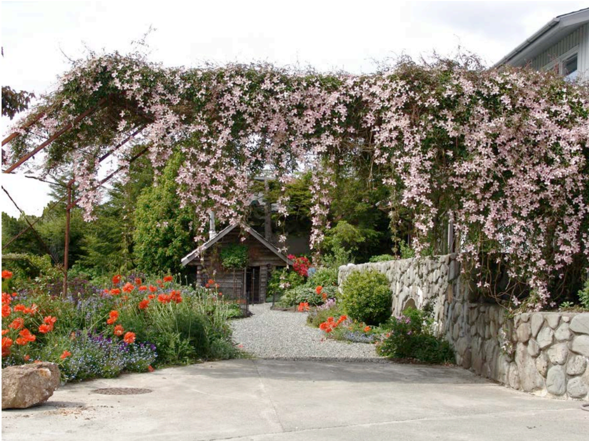
CLEMATIS Montana rubens