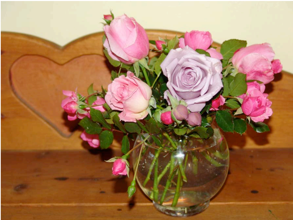
NEW DAWN, PERFUME DELIGHT and BONICA

SHRUB ROSE Bonica , Morden Blush , Ausbuff , Moss , Outta the Blue