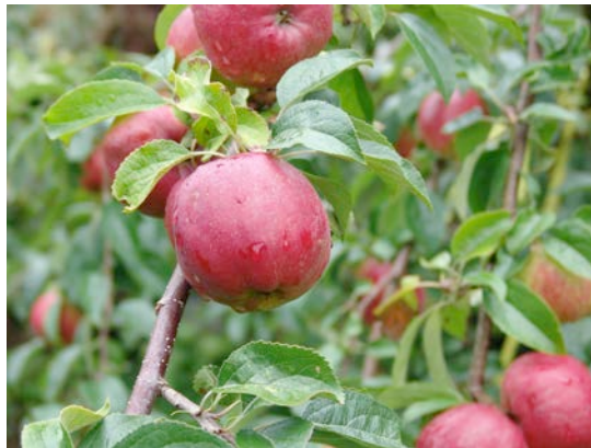
WILLIAM'S PRIDE APPLE TREE

PEAR After doing some research, the following pear trees were purchased and planted early spring of 2013. It will probably be many years before we see the results, but these are the pears that might be happy here if we continue to see warmer weather: ‘Shipova’ ( Sorbus aucuparia x Pyrus ), ‘Orcus European Pear’ ( Pyrus communis ), ‘Harrow Delight’, ‘Baby Shipova’ ( Sorbopyrus auricularis ), ‘Bella di Guigno’, ‘Doyenne de Juillet’, ‘Morettini’, ‘Ubileen’