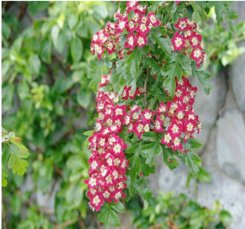
HAWTHORNE Crimson Cloud

APPLE 'Akane', 'Pristine', 'William's Pride' CHERRY 'Lapin', 'Early Burlat' CRABAPPLE 'Centennial' M/7 HAWTHORNE 'Crimson Cloud' HEMLOCK MAPLE MOUNTAIN ASH Sorbus aucuparia or decora MOUNTAIN ASH 'Sorbus cashmeriana' (Les Brake) from western Himalayas started from seed RED CEDAR SPRUCE YELLOW CEDAR