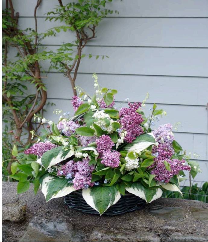
MIXED LILAC BOUQUET

ANGEL'S TRUMPET (Brugmansia) Datura acnisius, metel, solanaceae