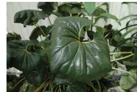
Farfugium japonicum 'Giganteum' Green Leopard Plant ASTERACEAE 1301

Distribution of plants will take place only on November 9, 2013, from 10:00am until 2:30pm. There are no rainchecks, and we are not able to hold or ship plants.