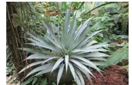
Alcantarea odorata BROMELIACEAE 1302

Found on stream banks and moist meadows in Japan, Farfugium is made for the shade and benefits from regular deep watering. Dark green, glossy, dinner-plate sized foliage makes this the perfect bold-textured accent in containers or in a shady mixed border.