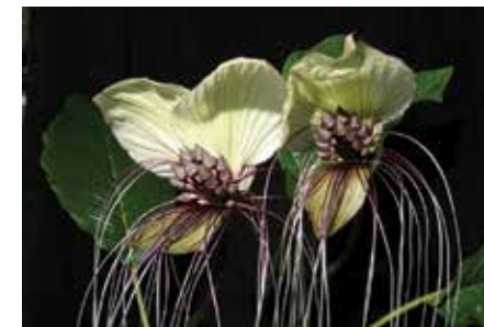
Tacca integrifolia Bat Plant DIOSCOREACEAE 1303

A Brazilian beauty, this bromeliad produces a tall, fragrant inflorescence, but is best known for its four-foot wide crown of thornless, silver-blue foliage. It grows successfully under a variety of light conditions in a well-draining medium, and makes a dramatic statement as either a landscape or container specimen.