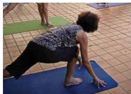
Marie Selby Botanical Gardens