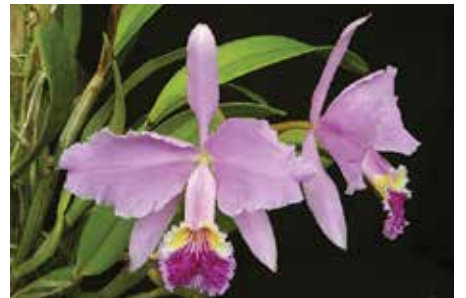
Cattleya hueddemaniana 'Arthur Chadwick' HCC/AOS ORCHIDACEAE 1305

Unique among Bougainvillea, this upright, multi-trunked tree blossoms with showy pink bracts several times a year. Native to Brazil, it has minimal water and maintenance needs. Requiring occasional pruning, it can be trained into a solitary trunked specimen and fortunately, it is virtually thornless.