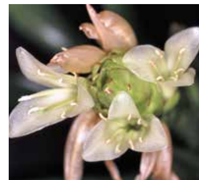
Guzmania loeflingiana

In addition, funding from the state's Division of Cultural Affairs/Florida Council on Arts and Culture will help the Gardens' education department produce lectures, classes, tours, and exhibits focusing on rainforests.