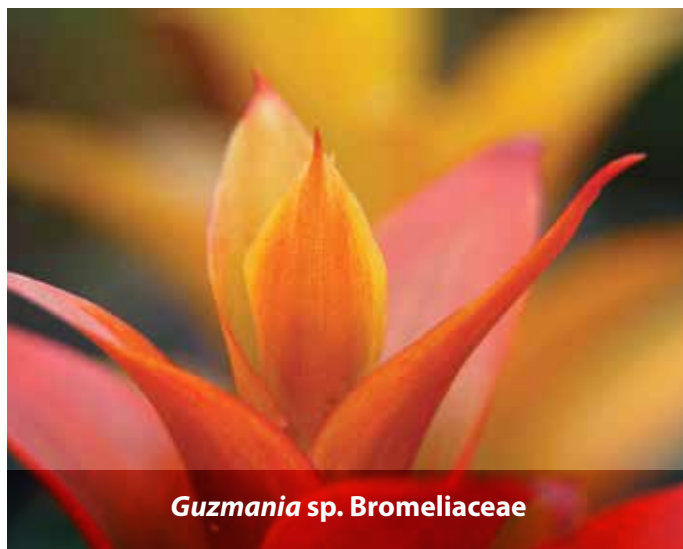
Guzmania sp. Bromeliaceae

Gems of the Rainforest opens October 10 in the Conservatory. Amongst the greenery, the rainforest plants in Selby's only public greenhouse will sparkle with the radiance of semi-precious gems. Regal orchids, such as the showy Bowring's Cattleya and the aptly-named Noble Dendrobium, will hold court through October 28 .