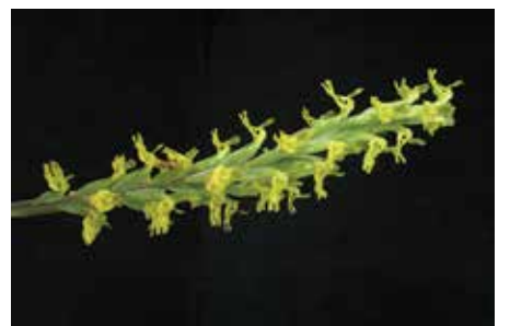
Sarcoglottis sceptraodes Scepter-like Sarcoglottis ORCHIDACEAE 1308

A remarkable cross between species of Brassia and Miltonia , this combination of cool and hot growing species yields an orchid tolerant of diverse growing conditions. The flower shape reflects the Brassia parent giving it the appearance of a large spider. Commonly grown in orchid pots, this bizarre hybrid thrives under indirect light with ample water and fertilizer.