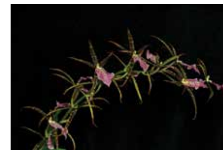
Miltassia Shelob 'Tolkien' AM/AOS ORCHIDACEAE 1307

Doritis is a hot to warm growing lithophytic or terrestrial orchid found in southern Asia. This pure white form carries many flowers with bright yellow cheeks. Grow in a well-drained orchid bark mix under bright indirect light, and provide adequate water during the peak of our hot summer months.