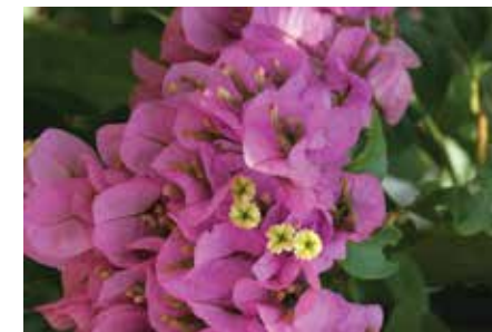
Bougainvillea glabra 'Arborea' Tree Bougainvillea NYCTAGINACEAE 1304

With upright bracts resembling bat wings and long, lurid purple "whiskers," Tacca integrifolia has one of the tropical world's most extraordinary inflorescences. An understory plant distributed throughout the rainforests of S.E. Asia, this bizarre beauty appreciates warm, humid, shady conditions and even moisture.