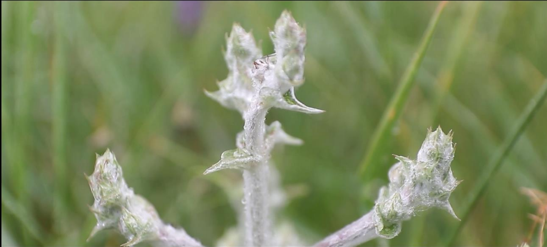
Melampyrum arvense L.