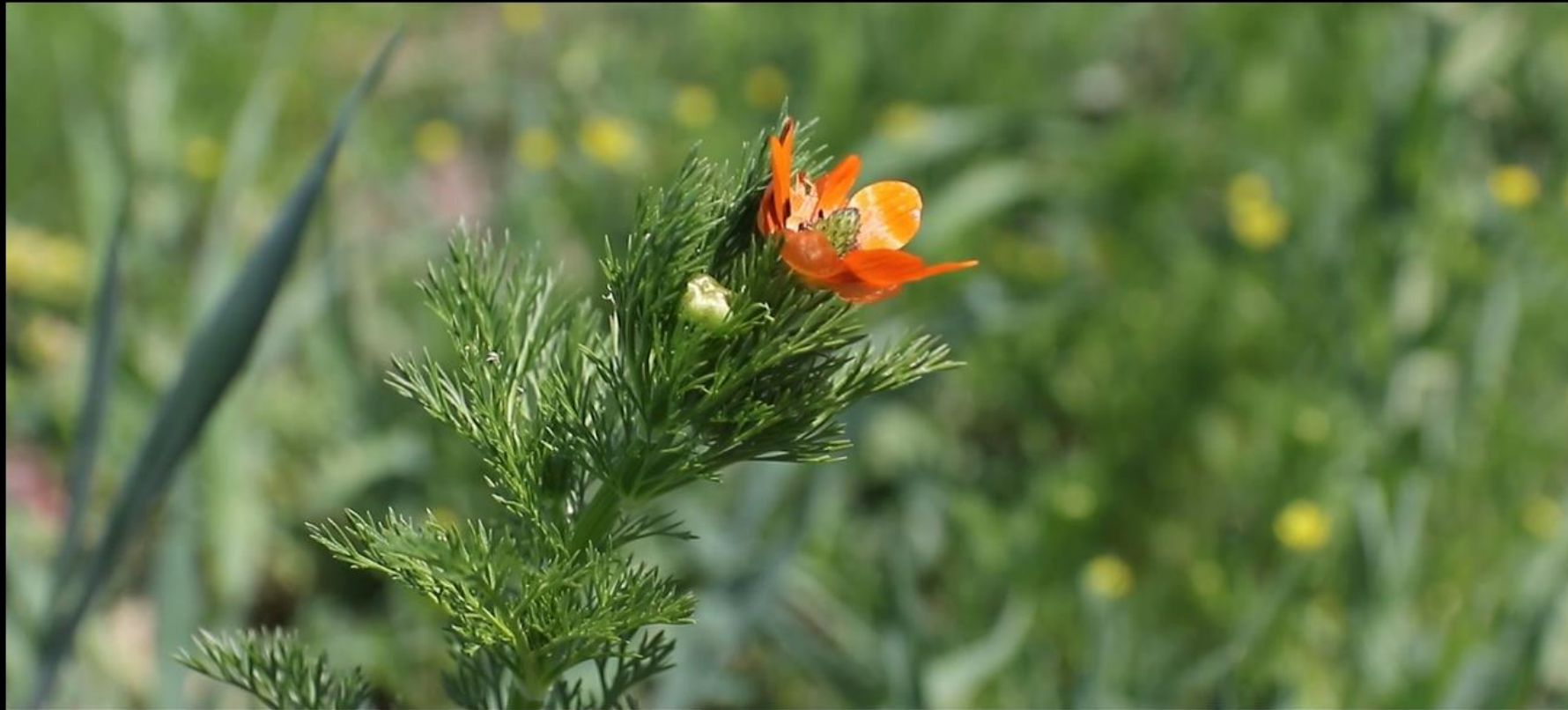
Adonis flammea Jacq.