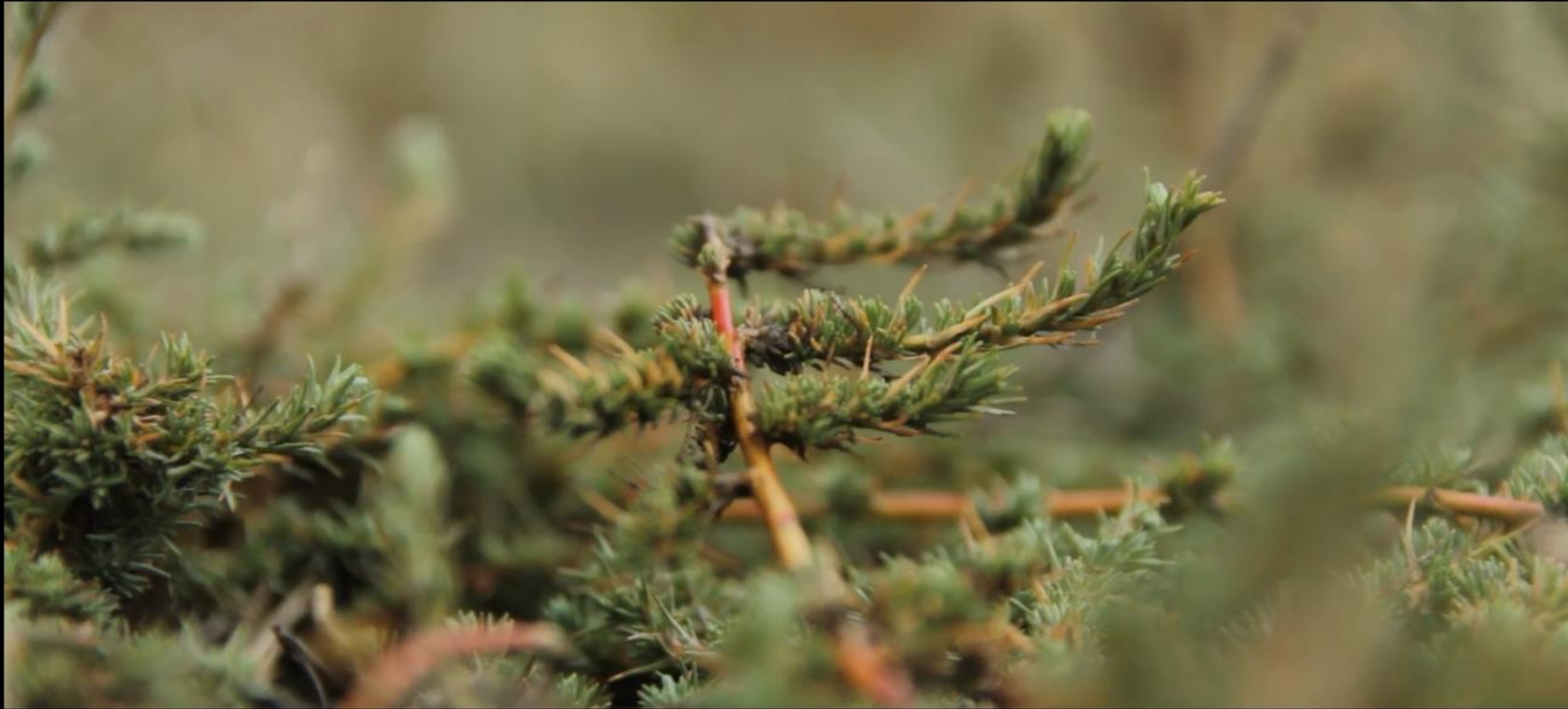
Camphorosma monspeliaca L.