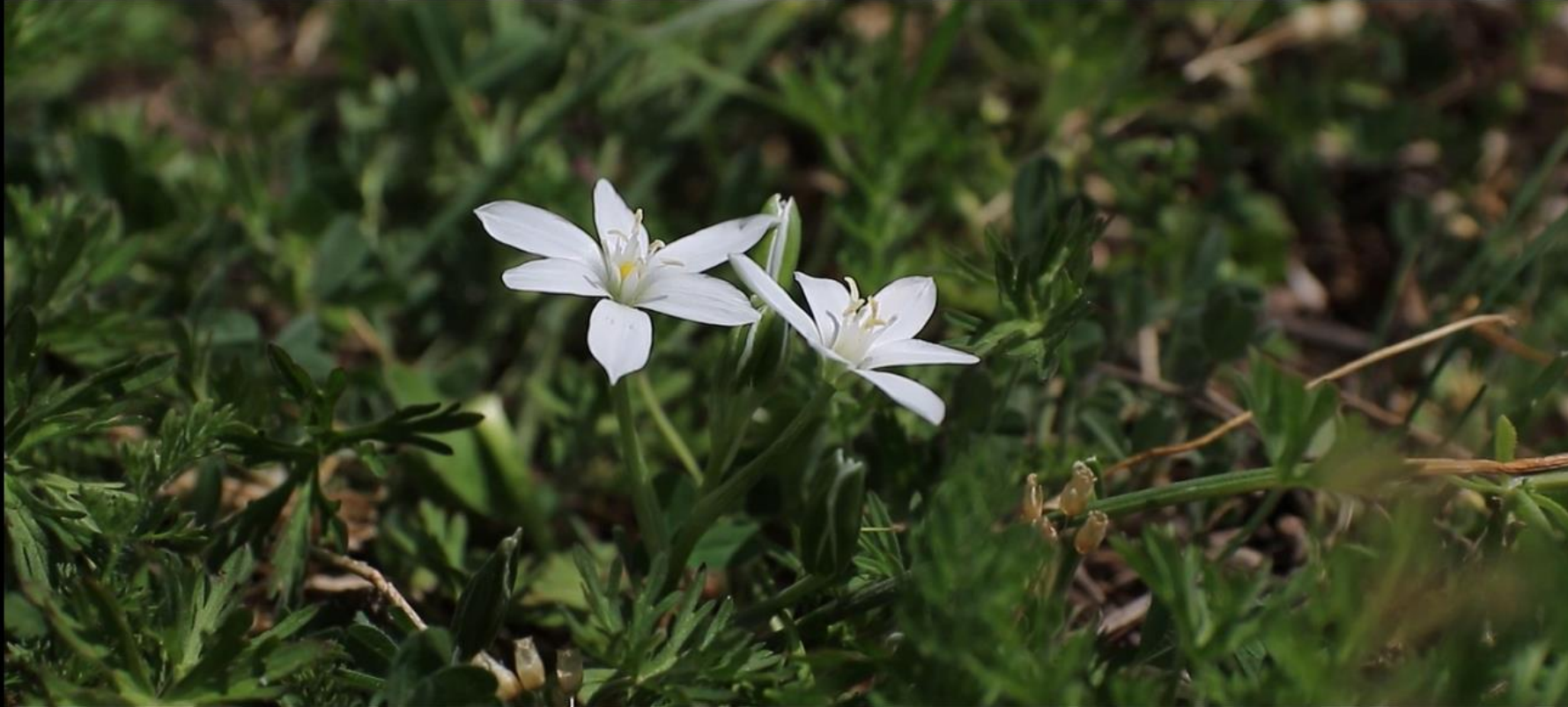
Ornithogalum refractum Kit. ex Schltzl.