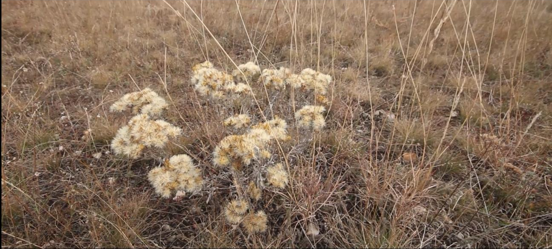
Galatella villosa (L.) Rchb.f.