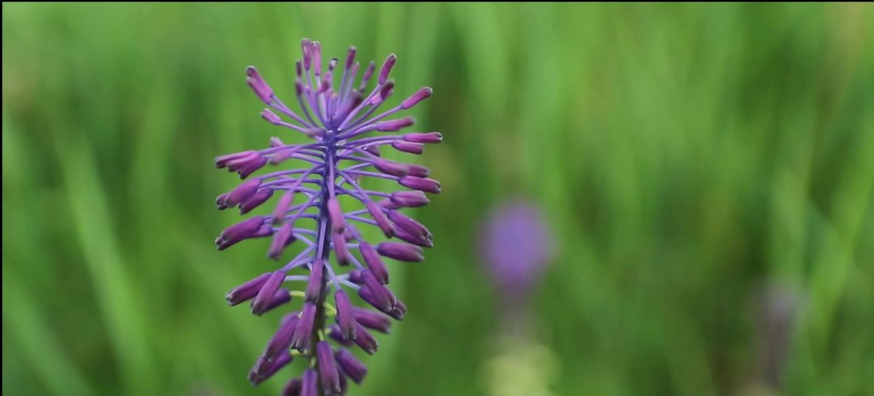
Leopoldia tenuiflora (Tausch) Heldr.