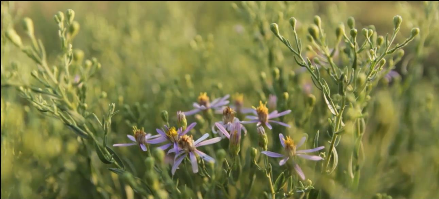
Galatella cana (Waldst. & Kit.) Nees