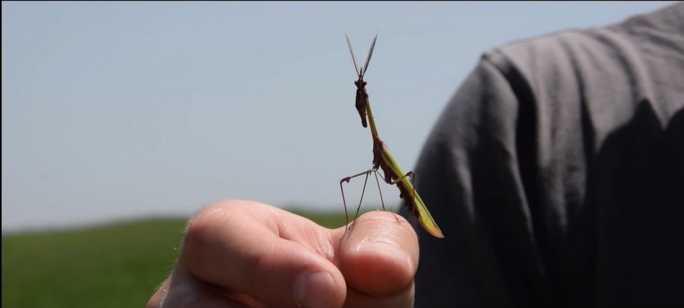
Empusa fasciata Male and female