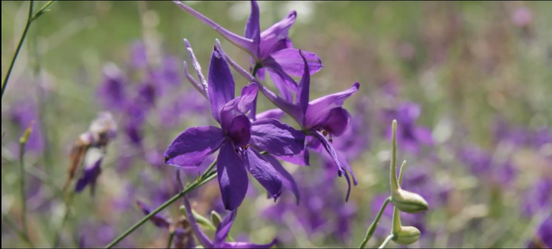
Consolida regalis Gray.