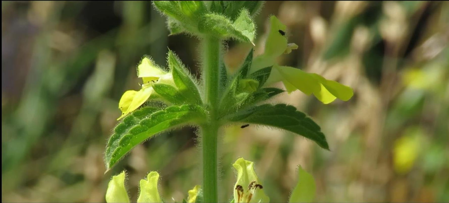
Stachys milanii Petrović