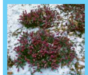
Rosalie blooming in late winter