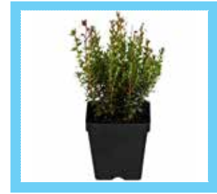
Heather Shipped as Shown