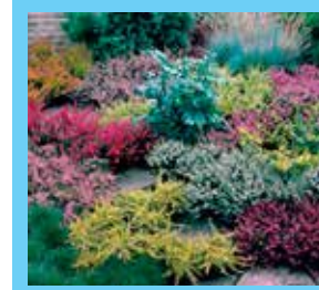
Tremendous color-changing flowers and foliage