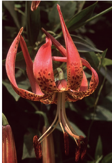
Two forms of Lilium superbum . Left , a flower photographed in Washington County, Rhode Island and right , a form with narrower and redder tepals in Choctaw County, Mississippi.