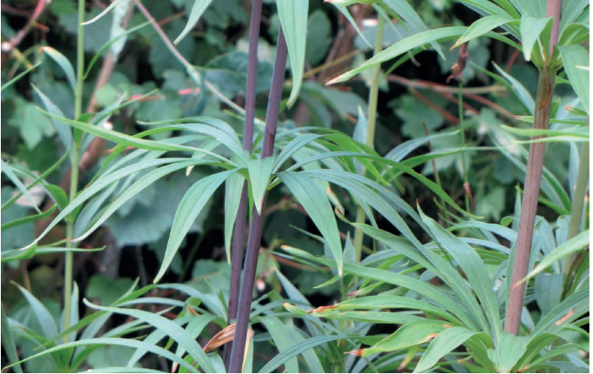
Above , individuals of Lilium superbum with both green and purple stems can occur in the same population. Green, purple stained and dark purple stemmed individuals are present in this stand being cultivated in West Wales.