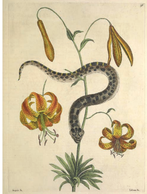
The illustration of ' Lilium, sive Martagon Canadense, flore luteo punctato ' by Mark Catesby (1736).