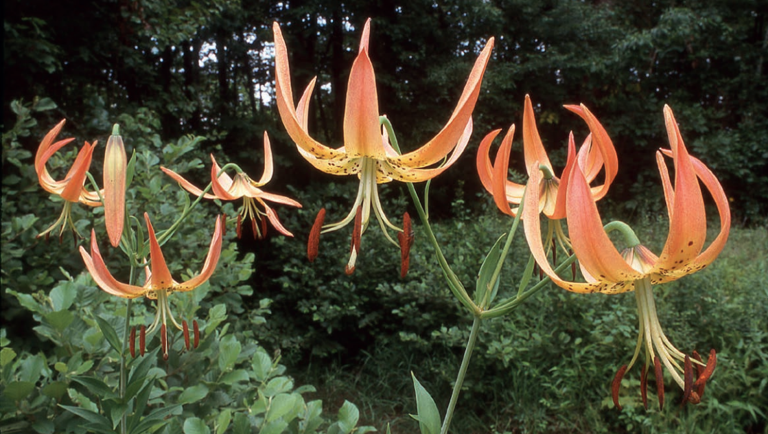
Lilium superbum growing in two locations in Mississippi. Above , in Tishomingo County and right , Choctaw County.

In terms of states, Lilium superbum ranges from New Hampshire and New York south and southwest to eastern Louisiana, reaching into the tallgrass prairies of eastern Indiana, Illinois, Missouri and Arkansas and existing as spotty populations near the coast in Virginia and South Carolina. It interdigitates with Lilium canadense in various places in the Appalachians, but hybrids are not prominent because L. canadense is hummingbird-pollinated and L. superbum butterfly-pollinated, and because of genetic barriers between the two major clades of eastern US lilies (superbum + pyrophilum + iridollae + michauxii and canadense + michiganense + grayi). Its linear range is about 1,300 miles, second only to Lilium philadelphicum among North American lilies.