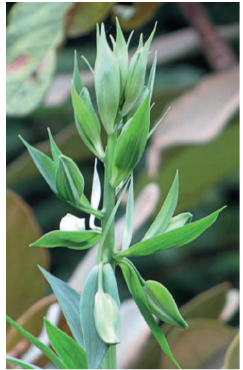
Above , the buds, which are triangular in cross section, and pedicels are subtended by quite large leaflike bracts during their early development.