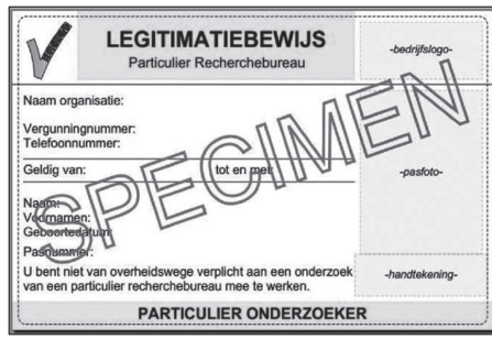
Figure 2. Private investigator identification card

Figure 2 displays the official identification card for private investigators in the Netherlands (also known as the 'yellow pass'). It contains a photograph and some personal details (name, date of birth and registration number) of the investigator and of the company the investigator belongs to (name, registration number and phone number). A card is valid for a maximum of five years and the expiration date is displayed. Interestingly, the front of the ID card states that 'you [the person to whom the card is shown] are not obliged by the government to cooperate with an investigation of a private investigation firm'. As we shall see in chapter 3, this 'voluntary' cooperation with investigations is very important for corporate investigators. The back of the card portrays the signature of the chief of police, the statement that the card holder is allowed to execute investigative activities and – if applicable – some restrictions.