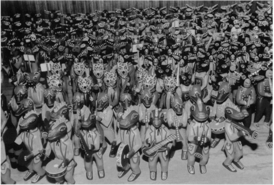
Fig. 3. An assortment of alebrijes from Oaxaca, Mexico.

craft stores in Oaxaca City to supplement their income. In 1970, a prominent local carver was named head of the FONART (Fomento Nacional de Artesanía) buying office in Oaxaca, and an increasing number of alebrijes were purchased and channeled into the network of craft stores operated by this national agency. In the mid-1980s, wholesalers from the United States began to visit the carving communities and purchase directly from them. This burgeoning commerce was stimulated by the potential for high profit margins caused by a weakening peso. The alebrijes became more intricate and the painting more ornate as the carvers sought to distinguish themselves in an increasingly competitive marketplace. By the 1990s, most of the households in Arrazola and San Martín Tilcajete were earning at least part of their income from the sale of carvings; some families had abandoned agriculture completely to work as full-time carvers (Chibnik 2001). Most of the carvings are bought directly from the villages to be sold in markets and craft stores in Oaxaca City or to be exported to the United States, Canada, and, to a lesser extent, Europe and Japan. U.S. buyers are es-