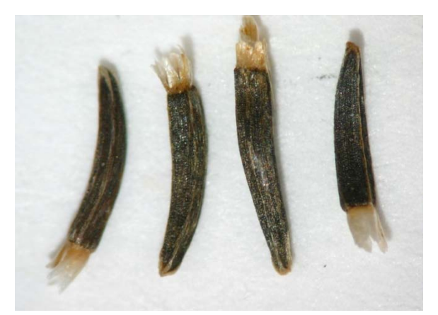
Eriophyllum lanatum seeds. Bend Seed Extractory, Seeds of Success

Eriophyllum lanatum is a prolific seed producer and will rapidly spread to any surrounding open ground. If plant spread is not desired, flower heads should be removed prior to seed ripening.