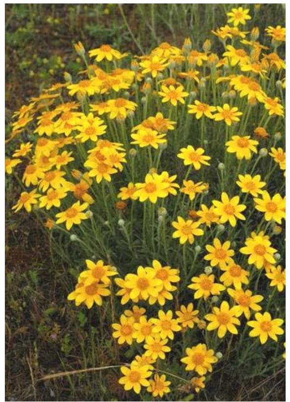
Eriophyllum lanatum.