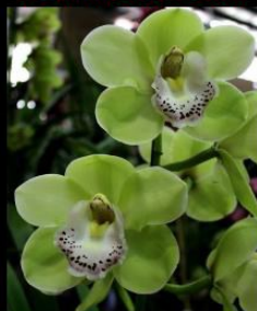
Owner/Hybridiser: Devon Meadows Orchids