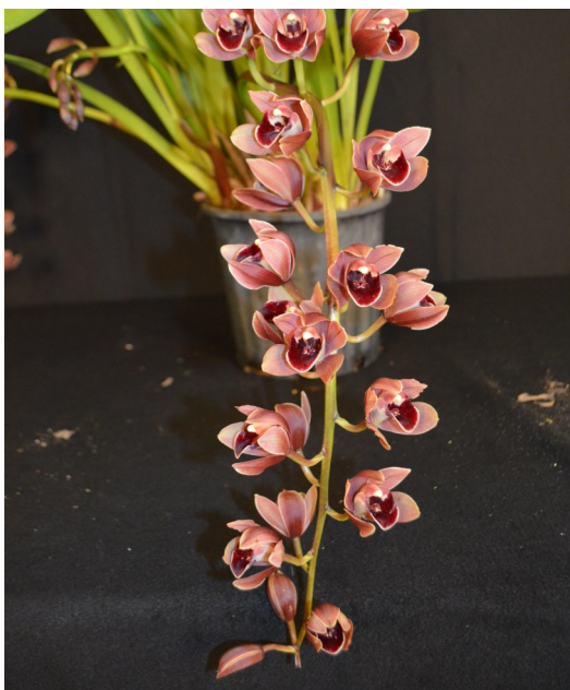
October Meeting Parish Song 'Mulberry'