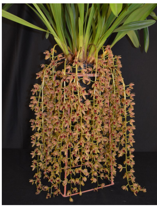
October Best in Second Division Cricket 'Invincible' Grown By Graham Fear