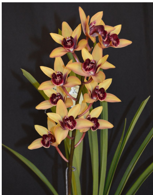
October Meeting Valya Graig 'Judy' x Canaliculatum "Aureia" Grown By Helmet Gerber