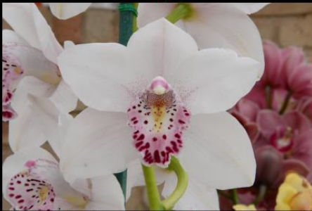
(Cronulla Star “Booty” x Ice Nymph “Fantastic”) “Sleeper”