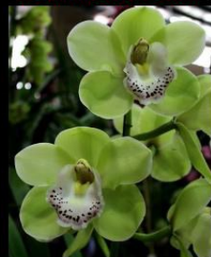
(Kimberley Winter x Kimberley Valley) “Devon Meadows’ var.”