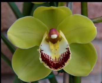
(Green Spectacle x Conqueso) “Scion”