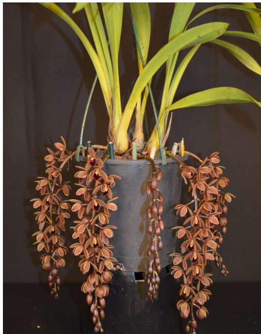
October Meeting Devon Railway New Horizon