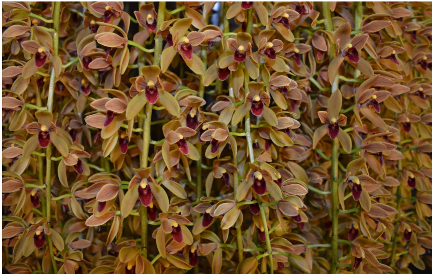
October Meeting Best Overall, Best First Division & Best Specimen Cricket 'Rosetta' Grown By Rito Sylvestri