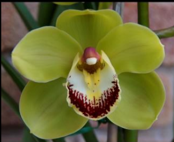
(Green Spectacle x Conqueso) “Scion”