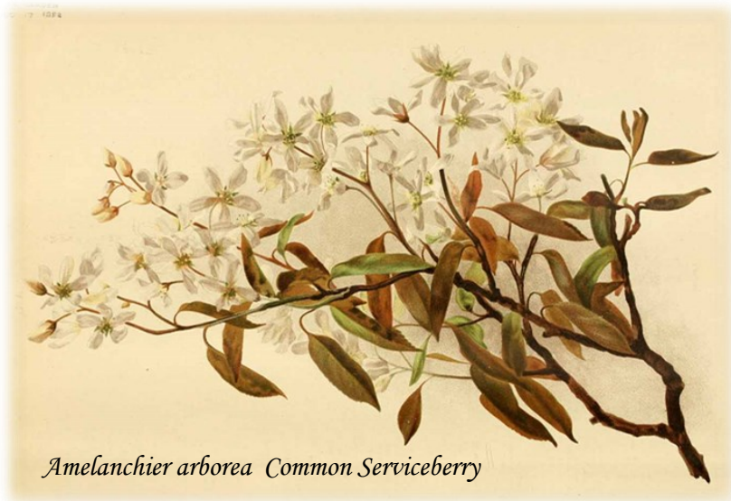
Amelanchier arborea Common Serviceberry