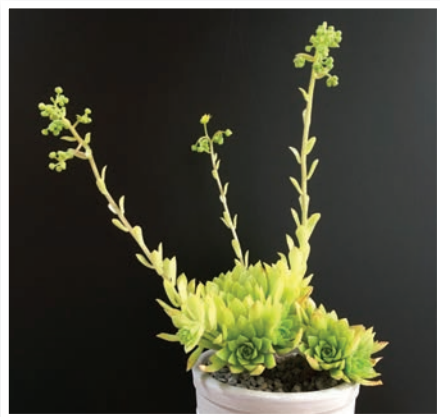
Fig. 21 Aeonium x nogalensis .

A. x nogalensis ( A. sedifolium x A. canariense var. christii ). It forms short branching stems with smallish rosettes of green, moderately hairy and sticky leaves (Fig. 21).