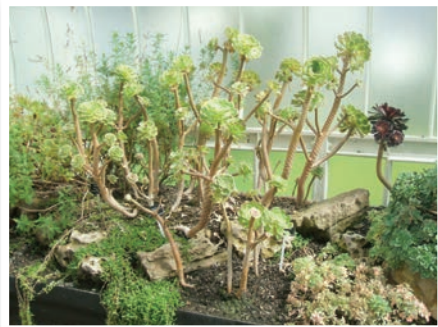
Fig. 1 Aeoniums growing at Glasgow Botanic Gardens.

Aeonium is a small, popular genus of Crassulaceae comprising 39 currently recognised species together with many more hybrids (both natural and artificial), variegates and cristates. The name Aeonium is derived from the Greek 'aionion' meaning 'everlasting plant', in recognition of the succulent nature and assumed longevity of the plants. The genus has an interesting natural distribution. Most species are endemic to the Atlantic Islands where the majority occur on just a single island. Travelling eastwards, there is a single species with a very localised distribution along the Atlantic coast of Morocco. The final two species occur in tropical east to northeast Africa and Yemen. The focus here is on the island species since I have yet to visit the three mainland African species in habitat. In terms of species totals therefore, I am surveying the 33 species that occur naturally in the Canary Islands (Bañares Baudet, 2015), together with two from Madeira and the lone species from the Cape Verde Islands.