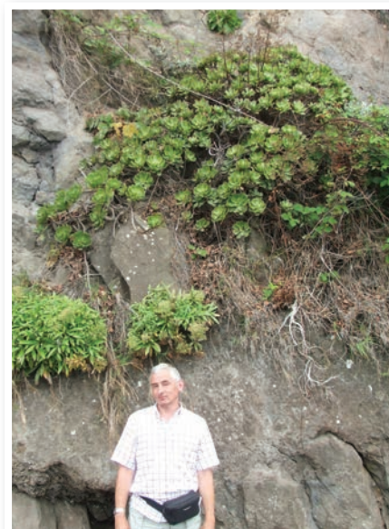
Fig. 29 Aeonium glutinosum in habitat on Madeira with the author for scale.

Aeonium glutinosum is unrelated to and is very different from A. glandulosum and according to Liu (1989) its closest relative is A. nobile from La Palma, although the