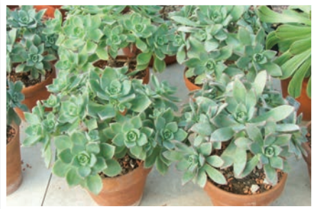
Fig. 9 Aeonium haworthii in cultivation at Kew.

Aeonium haworthii only occurs in Anaga, a small area in northwestern Tenerife, where it grows commonly on dry cliffs and rocks from sea level to 1,000 m altitude (Liu, 1989). It is a small shrub growing up to 60 cm tall with thin, wiry, tortuously-branched stems that produce many adventitious roots. The fleshy leaves are shiny or glaucous grey-green with ciliate margins forming rosettes up to 11 cm across (Fig. 9). The flowers are a