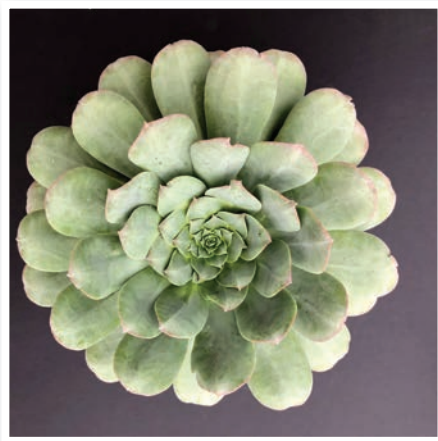
Fig. 17 Aeonium davidbramwellii top view.

This plant forms subshrubs up to 1 m tall (Fig. 16). Although the stem can be either unbranched or branched, all my specimens have remained unbranched in the 15 years I've been growing this species. I therefore suspect that branching is strongly genetically determined and I have material sampled from a population of non-branching individuals. The stem surface is reticulately smooth and marked by prominent leaf scars. The leaves which form a tightly flat-topped rosette (Fig.