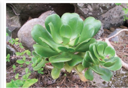
Fig. 30 Close up of the rosettes of A. glutinosum in cultivation on Madeira.

growth form of these species is rather different. Aeonium glutinosum is far more widespread than A. glandulosum . Aeonium glutinosum is found throughout the island on south, west and north-facing sea cliffs (hence is another cremnohytic species), although it is much commoner on the drier southern cliffs. Almost any rocky or poorly vegetated slope seems suitable with the exception of shady gorges in the wetter northwest. Sometimes it grows on man-made walls and roofs. It branches freely to form large clumps up to 1 m or more across (Fig. 29) with rosettes up to 20 cm in diameter (Fig. 30). Branches are weak and rosettes heavy, so the plant tends to lean over, making it rather an untidy plant in cultivation, requiring a large pan to accommodate it. The name glutinosum is apt because the stems are very sticky but the leaves less so. Insects get trapped on the glistening sticky surface. My plants grew fast and one flowered after just 4 years in cultivation producing two very loose (lax), very sticky