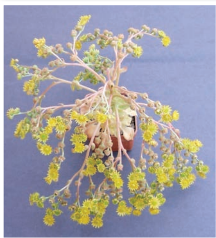
Fig. 28 Aeonium glandulosum in flower.

Aeonium glandulosum is a coastal cliff-dwelling (cremnohytic) species which forms large populations along the steep north-facing cliffs of a narrow belt running along the north of the island. It