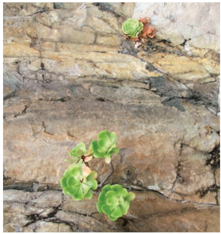
Fig. 32 Aeonium glandulosum (top) and A. glutinosum (bottom) growing together (sympatrically) on inland cliffs just south of Sao Vicente, N. Madeira.

distributions at two sites (Fig. 32) but did not myself see any hybrids. However, this means that together with the 49 named natural hybrids recorded by Bañares Baudet (2015) for the Canaries, there is a remarkable total of at least 50 naturally occurring Aeonium hybrids on record for the Atlantic Islands.