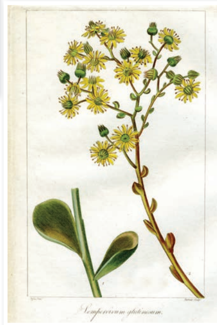
Fig. 31 A section of stem (1) and inflorescence (2) of Aeonium glutinosum (from Launay & Loiseleur-Deslongchamps, 1820, as Sempervivum glutinosum ).

inflorescences about 1 m long bearing golden yellow flowers (Fig. 31).