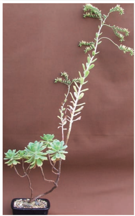
Fig. 13 Aeonium castello-paivae grown as a bonsai.

form loose rosettes at the branch tips. The flowers are greenish-white.