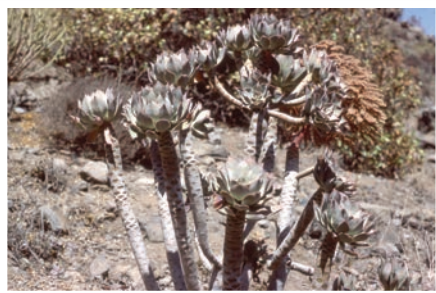
Fig. 4 Aeonium percarneum in habitat on Gran Canaria, August 1983.

Aeonium percarneum is a larger growing, moderately branched shrub up to 1.5 m tall with smooth or fissured bark. Its spoon-shaped (spathulate) leaves have short hairs on their margins, are arranged in terminal rosettes up to 20 cm across. The leaves are bright green when fully growing but with a pinkish hue, hence the name percarneum meaning ‘flesh-coloured’, but turn even dark pink in the summer resting period (Fig. 4). Flowers are whitish with pink streaks. On Gran Canaria it has a wide distribution from 100–1,300 m.