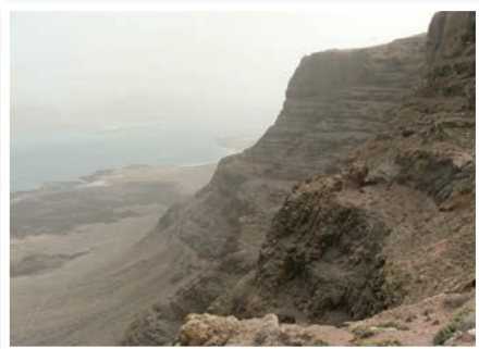
Fig. 22 View from the Famara, N. Lanzarote.

These are the two most easterly of the Canary Islands and the closest to the African coast with the shortest distance between Fuerteventura and Morocco being a mere 90 km. Lanzarote is less mountainous than the western islands reaching only about 700 m in the north which is dominated by the mountain