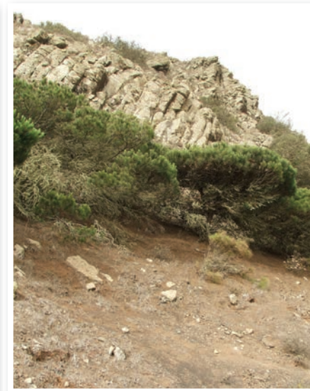
Fig. 24 General view of the habitat of A. lancerottense near Haria, Famara, N. Lanzarote.

Aeonium lancerottense is only distantly related to A. balsamiferum but is actually most closely related to A. haworthii according to Liu (1989). It is endemic to the Famara of Lanzarote (Fig. 24) where it is locally very common on rocks, rocky slopes and crevices, usually along streams or near water sources at 200–600 m (Liu, 1989). It is a well branched subshrub up to 60 cm tall with leaf rosettes up to 18 cm diameter. The leaves are obovate to spatulate, up to 9 cm long, green to yellowish-green with pink tinges, especially if kept dry during the winter. The dome-shaped inflorescence is up to 30 cm tall and 8–25 cm diameter, bearing pinkish flowers (Fig. 25).