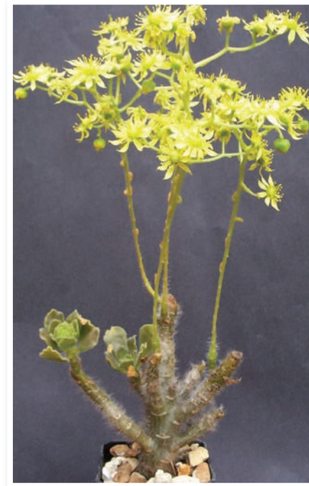
Fig. 11 Aeonium smithii in cultivation.

(2007) adopted this approach and hence did not recognise this species. However, it was resurrected as a distinct species by Bañares Baudet (2015). It is a delicate, dwarf-growing shrublet with stems only up to 25 cm tall with twiggy stems. The leaves are spatulate, shiny, streaked with red, velvety and edged with fine hairs (Fig. 10). The flowers are white to pale pink, in contrast to the yellow flowers of A. haworthii . In my limited experience it is a relatively slow growing, moderately branching plant. Whatever the final outcome of the deliberations over this most controversial species are, its unique features make it attractive compared to other larger and faster growing aeoniums.