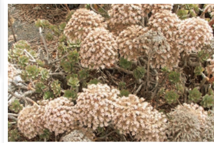
Fig. 25 Aeonium lancerottense in habitat near Haria, Famara, N. Lanzarote.