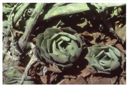
Fig. 3 Aeonium canariense var. virgineum in the Barranco de Virgen, N. Gran Canaria.

Aeonium simsii (Fig. 2) is the smallest growing of all the aeoniums forming large clumps of small stemless rosettes. As a montane species growing mainly above 1,200 m, it is one of the least succulent species which most closely resembles a Sempervivum (houseleek) and perhaps is closest to the type of ancestral stock from which the genus evolved. In the summer resting state the leaves dry up substantially to form clumps of tightly inrolled leaves, often growing amongst cracks in the rock, making it very difficult to find. When growing it forms a more open rosette with bright green leaves mottled or striped in deep red with well ciliated leaf margins. The yellow flowers are typical of the majority of species.