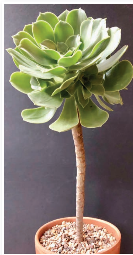
Fig. 23 Aeonium balsamiferum in cultivation, 35 cm tall in a 13 cm pot.

Aeonium balsamiferum is named for the intense odour of balsam emitted by the plants – a unique characteristic of this plant. It forms a subshrub up to 1.5 m tall, branches moderately often just at the stem tips and forms dense heads of terminal rosettes up to 18 cm in diameter (Fig. 23). The leaves are spatulate, up to 7 cm long, greyish-grey with occasional brown stripes. They are velvety, slightly sticky to the touch and edged with small hairs up to 1 mm long. The inflorescence is up to 25 cm tall bearing yellow flowers, although none of my specimens has yet to oblige despite being in cultivation for 9 years.