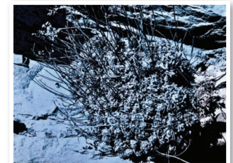
Fig. 2 Aeonium simsii .

I begin with this island because this was the first one I visited on my honeymoon with Marjorie in the summer of 1983. It is a roughly circular island with the highest point being Cruz de Tejeda at around 1,600 m (Bramwell & Bramwell, 2001). Seven aeoniums occur on this island of which four are endemic.