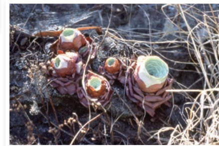
Fig. 7 Aeonium aureum in its summer resting state on Gran Canaria.