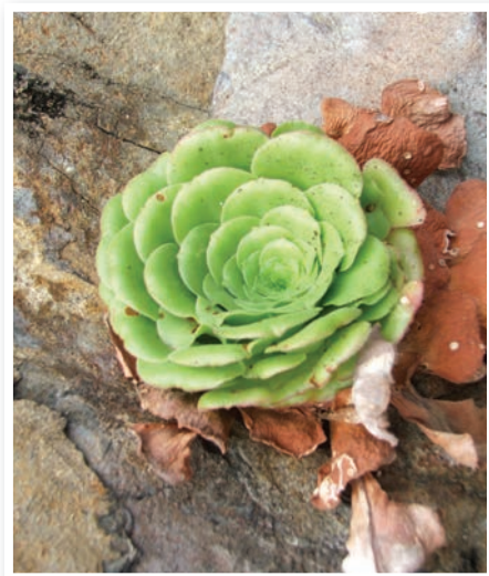
Fig. 26 Aeonium glandulosum in habitat on Madeira.

at 1,862 m. There is very little flat coastal land and there are virtually no natural beaches but there are stunning vertical cliffs up to 600 m tall! This is the home to two endemic aeoniums.