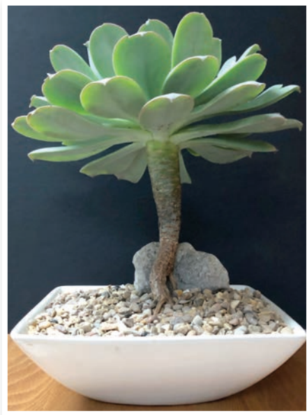
Fig. 16 Aeonium davidbramwellii side view.

obovate, up to 30 cm long and 20 cm wide, making these the largest of all the aeoniums. They are yellowish-green occasionally with a few brown lines, but the plant takes on a reddish hue if kept dry in the winter. The margins are hairy with small unicellular trichomes only about 0.5 mm long. The magnificent inflorescence is dome-shaped, 20–40 cm tall and 30–60 cm diameter, bearing many reddish flowers, a unique colour for this genus (Liu, 1989). I tried once to remove some leaves for propagation when a specimen flowered but they all failed to root. Clearly seed raising is the most reliable way to maintain this plant in cultivation. Aeonium nobile occurs on dry slopes, banks and cliffs up to 750 m throughout La Palma, although it is absent from the northeastern corner of the island (Liu, 1989). According to Schulz (2007) it is one of only a few species that grows in grassland and it exhibits periodic mass flowering in habitat.