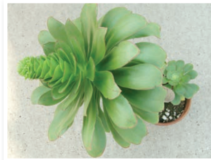
Fig. 5 Aeonium undulatum in cultivation at Kew.

(March) the inflorescence was developing (Fig. 5), but I was probably about a month too early to see the open yellow flowers.