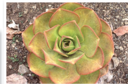
Fig. 15 Aeonium nobile in cultivation.

This island is roughly pear-shaped, very rugged and mountainous with a large central crater, La Gran Caldera de Tabouriente, the outer rim of which forms the highest point on the island, Roque de los Muchachos [boys' rock] at 2,483 m. A caldera is a crater formed from the collapse of a volcano and this island is still volcanically active when an eruption occurred only as recently as 1971 (Bramwell & Bramwell, 2001).