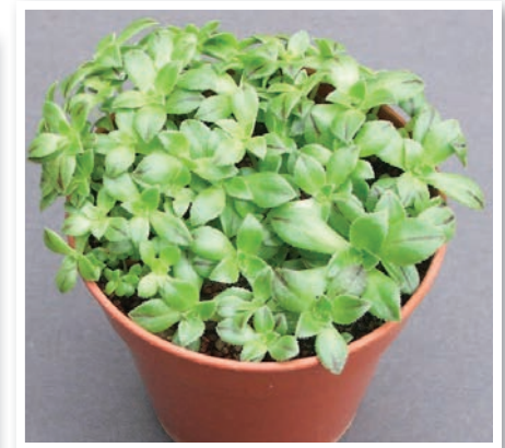
Fig. 19 Seedlings of Aeonium davidbramwellii .

of seedlings (Fig. 19) which are now reaching maturity with the first two specimens flowering in February–April 2021 (Fig. 18). The rest of this second batch of seedlings will most likely flower in 2022.