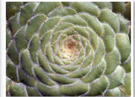
Fig. 12 Aeonium tabuliforme featuring the overlapping leaves and prominent marginal hairs.

Aeonium . The hairs, technically known as multicellular trichomes, are up to 8 mm long, making them particularly obvious even to the naked eye. The undulate leaves are also hairy bearing a mixture of very small unicellular trichomes c. 0.3 mm long, and larger multicellular trichomes up to 0.5 mm long, which require a microscope to examine and appreciate in all their glory. This is not a unique species in having two different types of hairs and as yet, the function of these is unknown. The inflorescence is only about 15 cm tall bearing yellow flowers. This species occurs on rocks and cliffs most commonly in the forest zone at 150–2,150 m. It was named for Christen Smith (1785–1816), professor of botany at the University of Christiania (Oslo, Norway) (Liu, 1989).