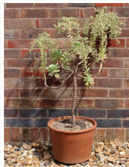
Fig. 14 Aeonium valverdense .

This island is almost semicircular in outline and hence maybe merely the remnant of an extinct volcano. It consists of a high plateau reaching about 1,500 m at its highest point with steep cliffs on all sides. It is the smallest of the inhabited islands (Bramwell & Bramwell, 2001). It is home to six aeoniums, only two of which are endemic, including A. valverdense discussed here, named for the town of Valverde in the northeast corner of the island where the species is abundant (Liu, 1989). The only other endemic species is A. hierrense , named for the island, a species I've yet to encounter either in the wild or in cultivation. Aeonium valverdense is common on rocks and cliffs up to 800 m. The plant forms a small, modestly branched subshrub up to 1 m tall. The pale brown to grey surface of the stems is rough, bearing smooth reticulate lines and prominent leaf scars. The leaves are obovate (inverted egg-shaped) up to 12 cm long, green to yellowish-green with a pink tinge and the margins are moderately hairy with prominent unicellular trichomes about 1 mm long.