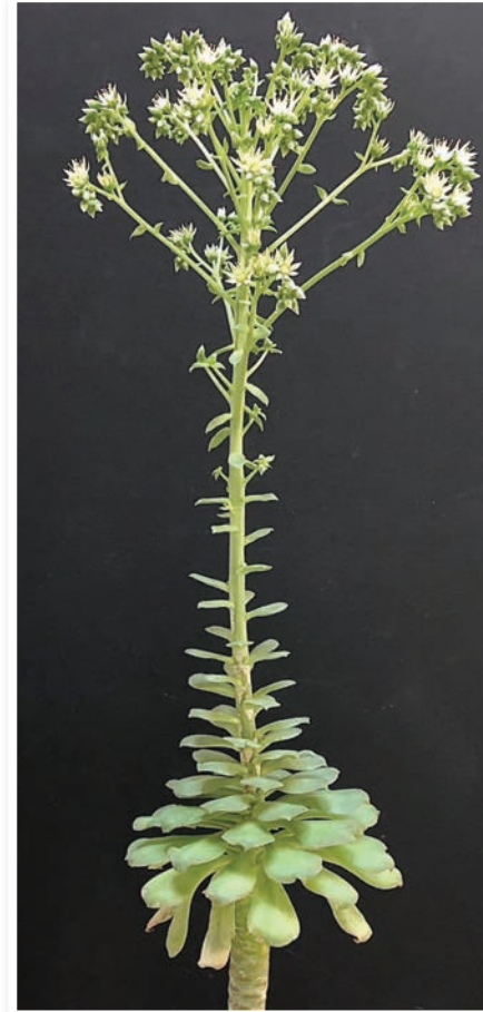
Fig. 18 Aeonium davidbramwellii in flower.

plants are kept dry in the winter when the whole rosette can turn an attractive pale chocolately-brown. Leaf margins are hairy with unicellular trichomes only 0.5 mm long. The inflorescence is dome-shaped and up to 35 cm tall bearing white flowers with green variegation (Fig. 18).