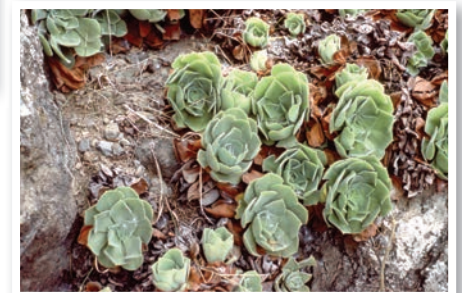
Fig. 20 Aeonium canariense var. christii in cultivation.

Aeonium canariense subsp. christii (formerly A. palmense or A. canariense var. palmense ), despite its older names, is not endemic to La Palma because it also occurs on El Hierro. Not surprisingly, the plant is similar to A. canariense subsp. virgineum from Gran Canaria, but differs in having shorter, denser hairs. The rosettes again are cup-shaped, velvety and sticky to the touch (Fig. 20). Flowers are also similarly pale to light greenish-yellow (Liu, 1989).