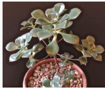
Fig. 10 Aeonium mascaense in a 10 cm pot.

There are a number of cultivars of A. haworthii , one of which has attractive variegation with yellow and red-edged leaves. It has received a number of names including 'Variegata', 'Tricolor' and 'Kiwi', but the oldest and currently correct name appears to be 'Dream Color'. This was featured as one of my Presidential Potted Plants for the BCSS (Walker, 2021).