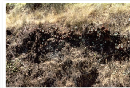
Fig. 6 Aeonium aureum in its summer resting state on Gran Canaria.

Aeonium aureum has a wide distribution across all five western islands: La Palma, El Hierro, La Gomera, Tenerife and Gran Canaria. This species, along with three others, was formerly separated in the genus Greenovia , based on the principal feature of having a larger number of flower parts (up to 32 or more petals, etc). However, molecular studies showed that the four greenovias are not really distinct and so were merged into Aeonium . This species grows on banks in soft soils (Figs. 6 & 7) or on vertical cliffs. In the summer the stemless rosettes contract to form tight cups or even hollow balls surrounded by the dried leaf remains. In contrast when growing in the winter the rosettes open out to form rosettes of relatively thin succulent glaucous grey-green hairless leaves somewhat resembling a Mexican species of Echeveria (Fig. 8). Single unbranched rosettes die after producing the well-branched heads of yellow flowers, hence the name aureum . On Gran Canaria A. aureum occurs in the moist or forest zone in the centre of the island. Similar former species of Greenovia are A. aizoon (Tenerife), A. diplocyclum (El Hierro, La Palma and La Gomera) and A. dodrantale (Tenerife).