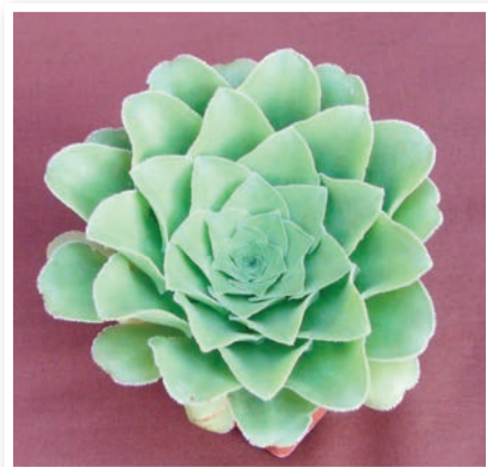
Fig. 27 Aeonium glandulosum in cultivation, about 12 cm diameter.

Aeonium glandulosum is a coastal cliff-dwelling (cremnohytic) species which forms large populations along the steep north-facing cliffs of a narrow belt running along the north of the island. It