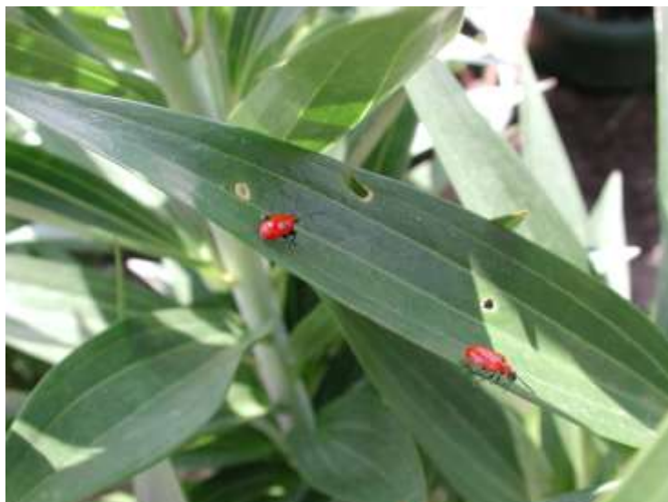
Lily Beetle on leaf

The Lily beetle ( Lilioceris lili ) often devours a leaf right down to the stem. Flower buds can be damaged as well. The Lily beetle feeds on the leaves starting at the leaf margins. Adult beetles are 8 mm in length and conspicuous due to their bright red colour. The damaged leaves look ugly because they are covered with a thick, dark brown layer of slimy deposits.