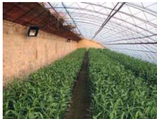
Different Greenhouse facilities