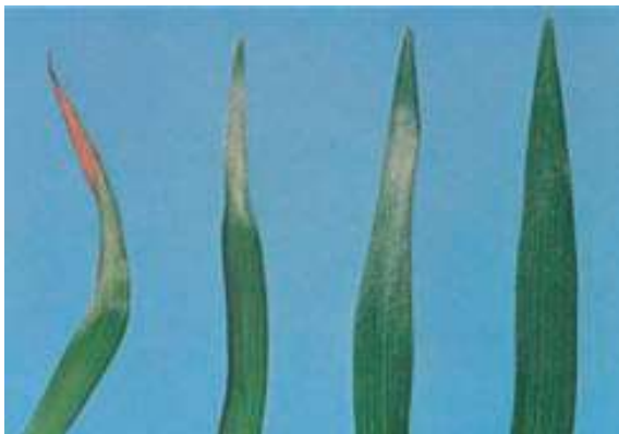
Leaf scorch in Asiatic hybrids

In a light case of leaf scorch, the plant will continue to grow normally and the damage will appear only on leaves located at a certain height on the stem. If the leaf scorch is more severe, the white spots can turn brown in places, and the leaf will curl at the damaged location. Young flower buds will be destroyed so that the plants will not continue to develop. In very severe cases all leaves plus the tender young buds will be lost. Plants will then fail to develop further. This is known as 'top scorching'. In addition to the leaves, the stipules of the inflorescence can be scorched. (Sometimes, this happens only to the stipules). When this occurs, the top of the plant grows very crookedly or turns blackish brown. This can also happen to the mesophyll on the top of the petals so that the flower bud grows irregularly and displays openings on the top.