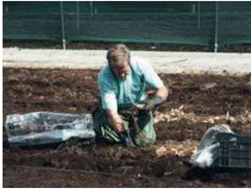
Planting by hand