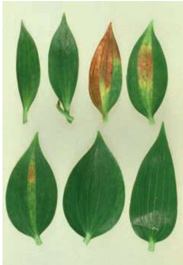
Infected top leaves