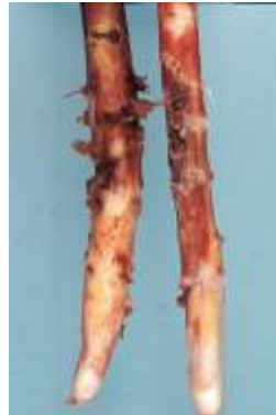
Fusarium stem disease