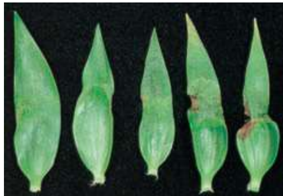
Leaf scorch in Oriental hybrids