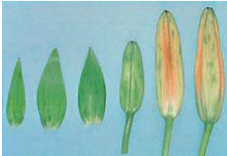
Leaves and flower buds infected by aphids