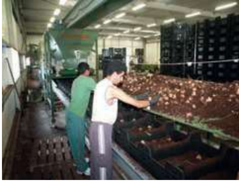
Planting in boxes