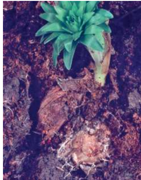
Leave infection caused by Rhizoctania solani