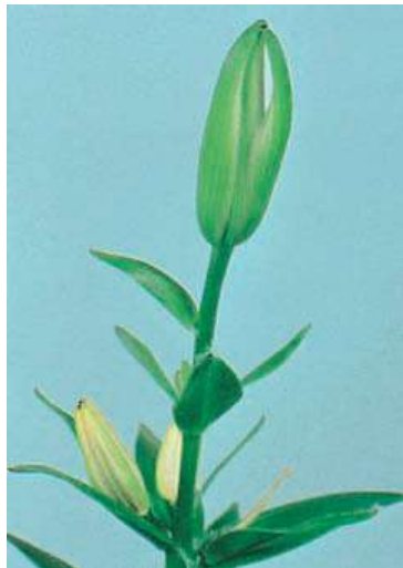
Bud abortion in an Asiatic hybrid

Flower bud desiccation can occur during any stage of development. If it occurs early, the plants will remain short and the leaves will be dull green, short and narrow and arranged closely next to the stem but will display no symptoms of leaf scorch. Some or all the flower buds will desiccate during an early stage of growth and will later appear in the axils of the top leaves as small white specks. If flower bud abortion occurs later in the plant's development, the plants usually develop normally with a normal root system and with flower buds that are already clearly visible. Later, however, the buds will turn light green and shrivel. Flower buds that have already begun to display their flower colour will turn paler and dry up completely but will usually not fall off. The upper buds in the inflorescence will be the first to desiccate.