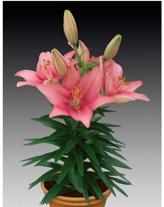
Asiatic hybrid, pot type