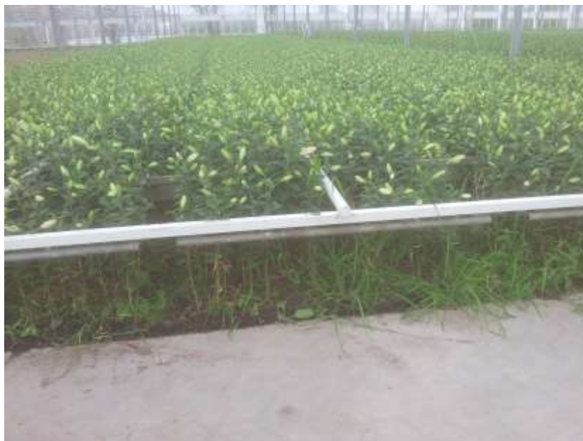
weed control important!

The best way to control weeds after planting is by weeding. A lily crop is extremely vulnerable and, depending on other conditions, can be quickly damaged by a post-emergence application of a chemical control agent. Be extremely careful in applying chemical weed control agents. If in doubt, conduct a test by spraying on a small surface to see how the lily plants react. Use chemical weed control only when really necessary.