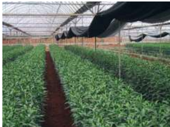
Simple screening system

During the summer months, it is also possible to spray a shading compound onto the exterior of glass greenhouses that will filter around 50% of the natural sunlight. Because a shading compound is not easy to remove, it should not be applied too early in the spring nor removed too late in the autumn. Applying the shading compound to the north side of the greenhouse later and then removing it earlier as well makes it possible to be somewhat more prepared for fluctuating kinds of weather. The shading compound can be removed by a high-pressure spray gun using a solution containing chemical agents especially designed for this purpose. Do not use any cleaning agents that contain fluoride because fluoride can discolour leaf tips.