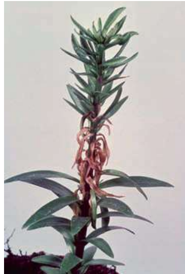
Symptoms in the middle of the stem