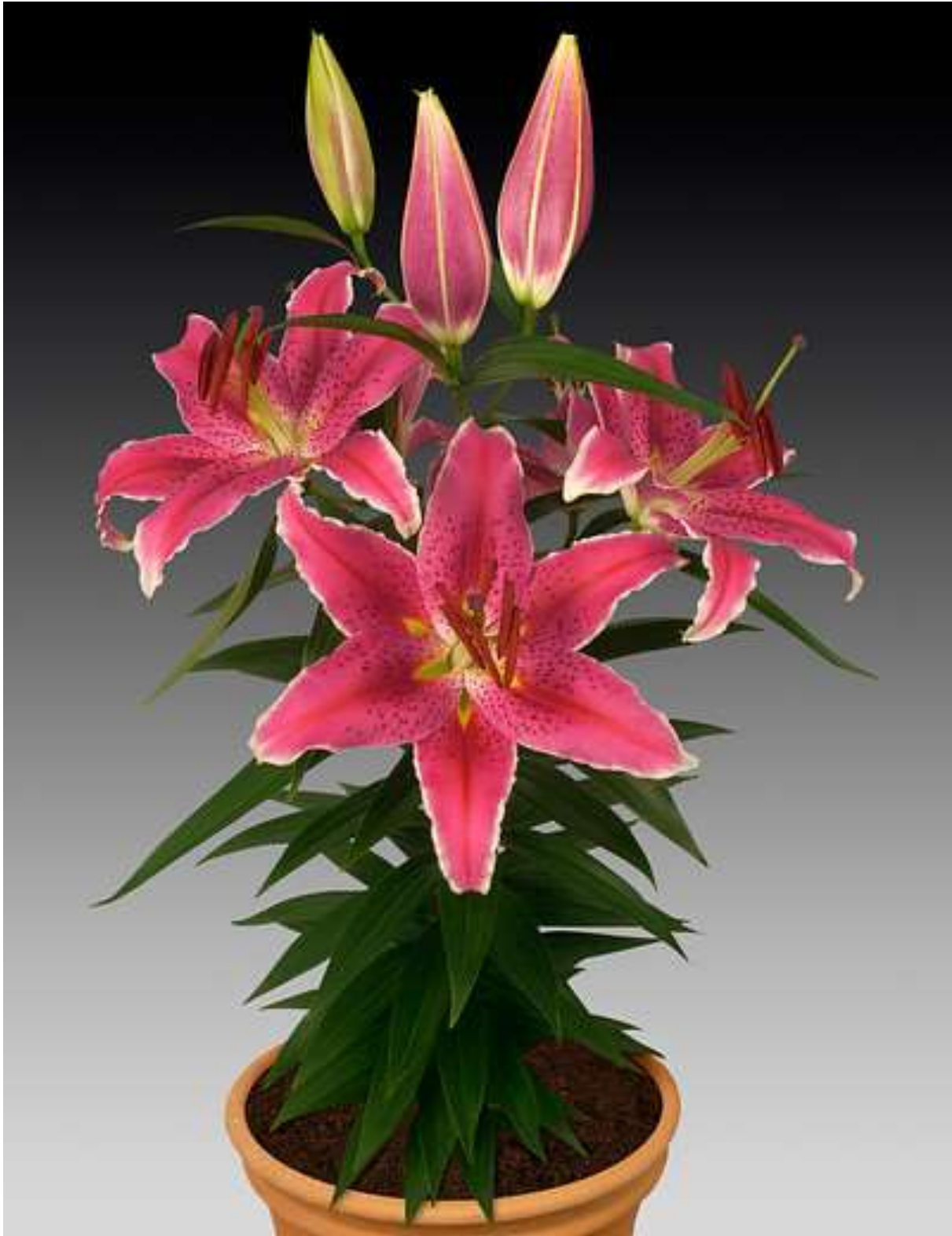
Oriental hybrid, pot type