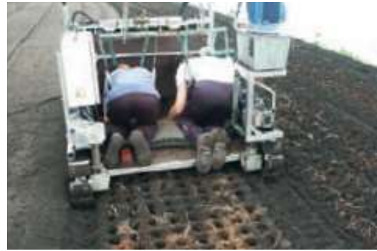
Planting by machine