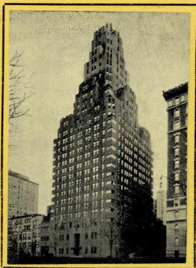
The Roerich Museum, New York.