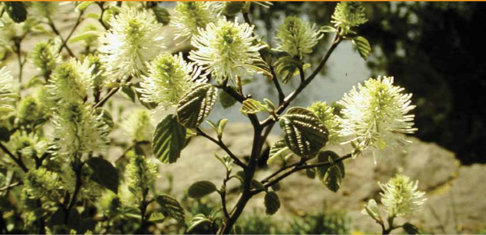
Fothergilla gardenii – Great Plant Picks

branch zig zagging individually. A member of the Hamamelidaceae family, the various species and cultivars range in ultimate size from a diminutive 3 feet in height and spread to a more substantial 8 feet in height and spread.