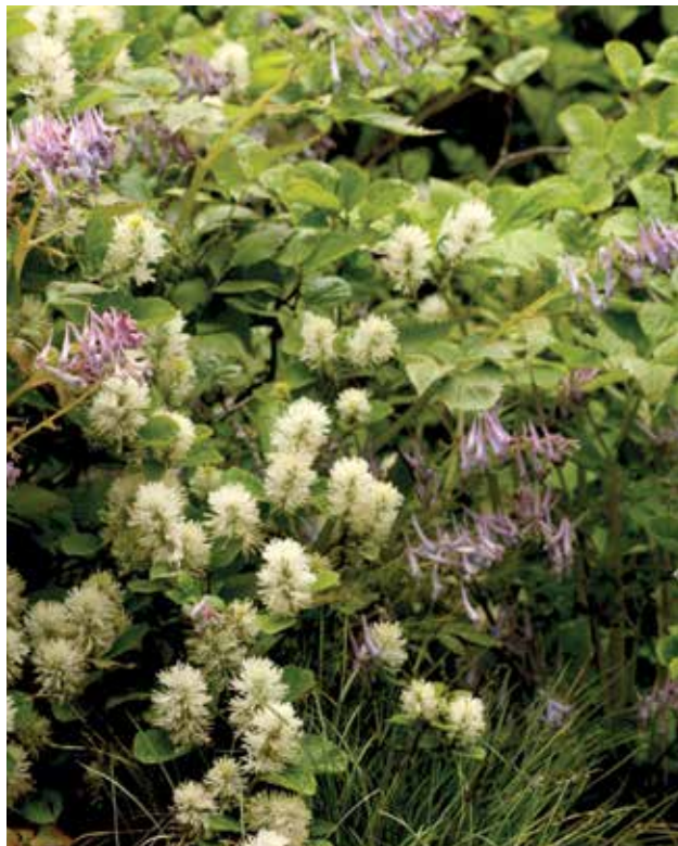
Fothergilla gardenii , Corydalis quantmeyeriana ‘Chocolate Stars’

This may sound like a dramatic overstatement for what is generally an unheralded shrub, but Fothergilla is a calendar of visual delights. Every season has its “ Fothergilla moment.” Before the leaves push out in spring, the plant is profusely covered with charming and lightly scented, white bottle-brush flowers that announce the growing season. In summer, with its companionable shade of green and appealing mounded form, it’s a beautiful foil for other plants. In texture, it is a great companion to contrast with conifers, and its medium size makes it a good com-