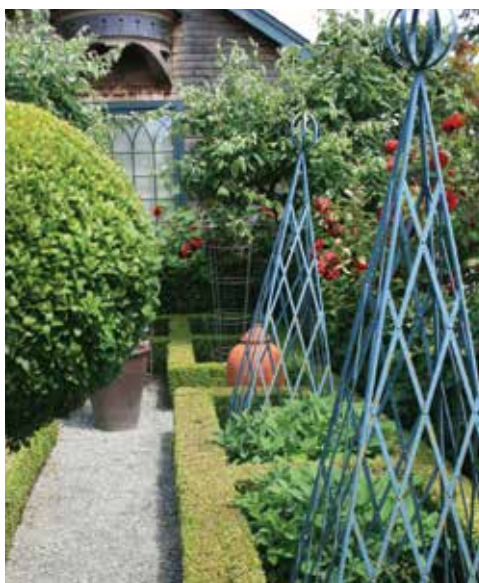
Box hedge around vegetable garden, Tacoma, Wash

Plant choices for hedging are endless. Start by choosing varieties based on the finished look to be achieved (focal point, flowering, backdrop), growing conditions (shade, hot sun, windy, seaside), specific functional needs (privacy, hide electrical boxes, property line demarcation) and how much maintenance and watering is needed.