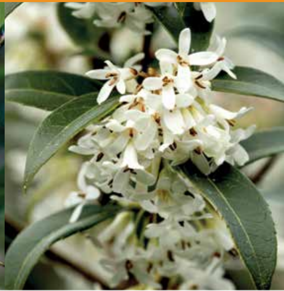
Osmanthus x burkwoodii

tough and useful in the landscape. The late winter blooming Osmanthus delavayi and Osmanthus x burkwoodii are common in gardens and have some of the showiest flowers of the genus. Both produce dense clusters of small tubular white flowers that line the stems in early to mid-March. In full bloom they cast a sweet floral fragrance that carries in the cool air. Tolerant of sun or dappled shade their adaptable qualities have earned them a recommendation on the Great Plant Picks website.