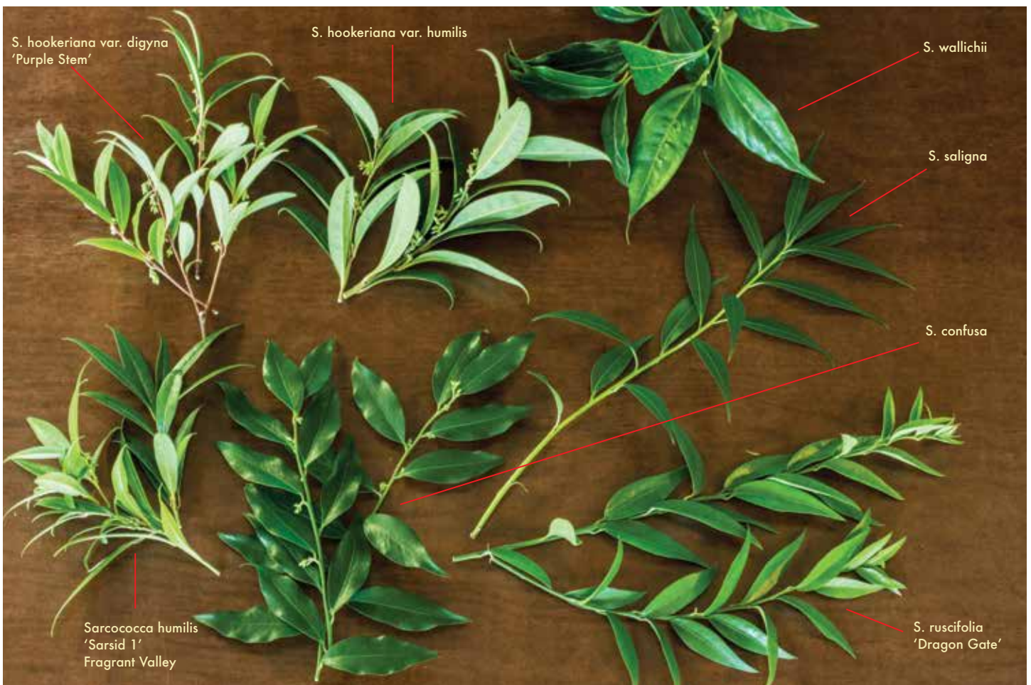
Sarcococca collection at the Miller Garden

1') and FRAGRANT MOUNTAIN™ ('Sarsid 2'). Both are a little different from the typical form, but are clonally propagated so a planting will have a even and uniform growth pattern.