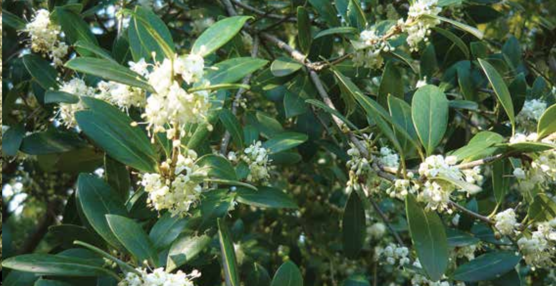
Osmanthus heterophyllus

FRAGRANT VALLEY™ is 12 to 15 inches tall and FRAGRANT MOUNTAIN™ is about 18 inches tall with similarly fragrant flowers to the species. A graceful and charming taller form is Sarcococca hookeriana var. digyma ‘Purple Stem’. Growing to about 3 feet tall it will slowly spread to 5 or 6 feet wide in ten years. The longer, larger foliage and willowy habit make it a choice garden addition. Decades old plants of this thrive in the Washington Park Arboretum.