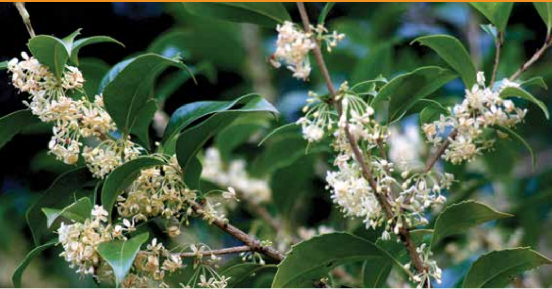
Osmanthus x fortunei