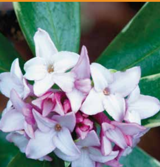
Daphne odora 'Aureomarginata'