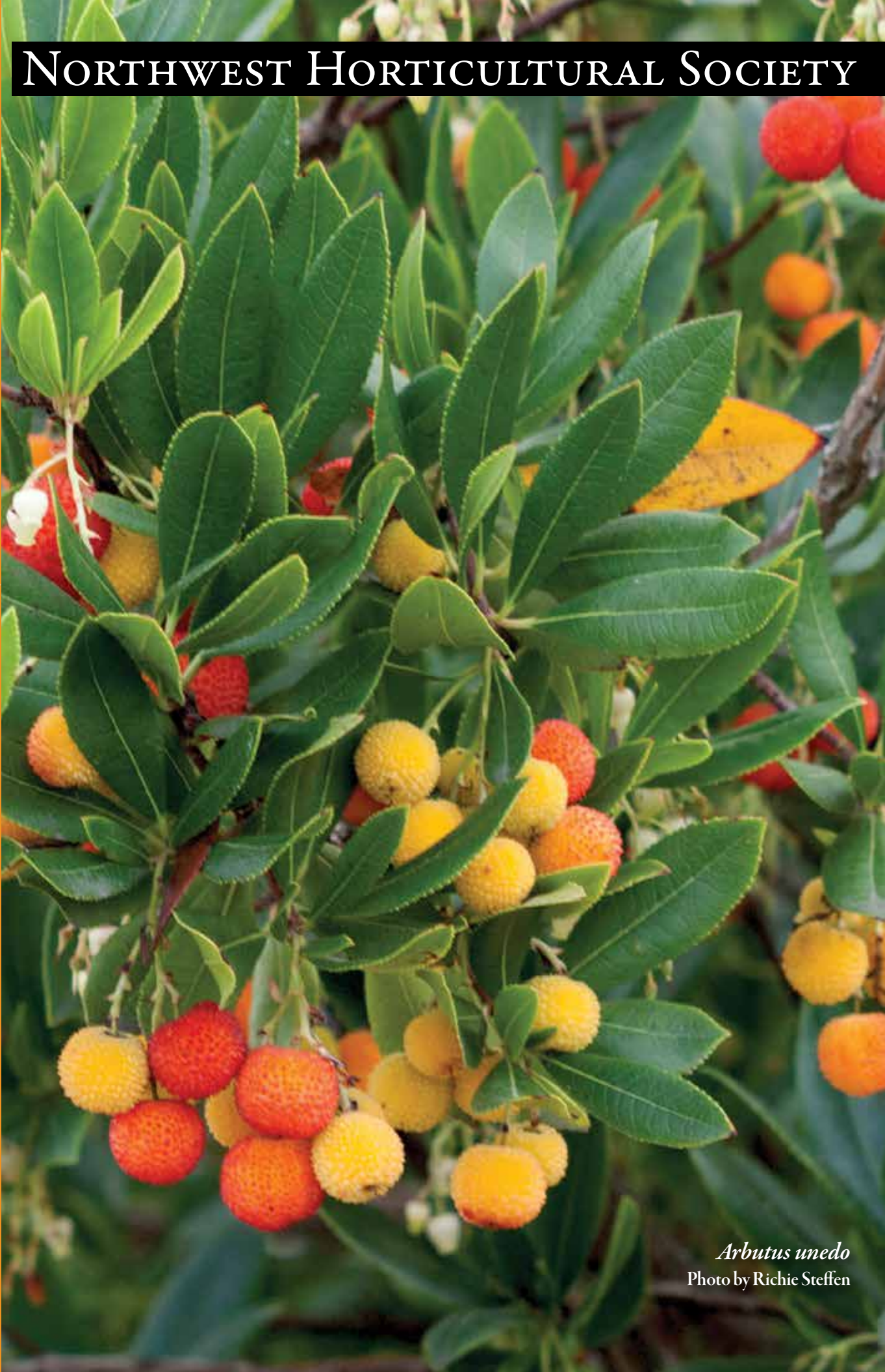
Arbutus unedo