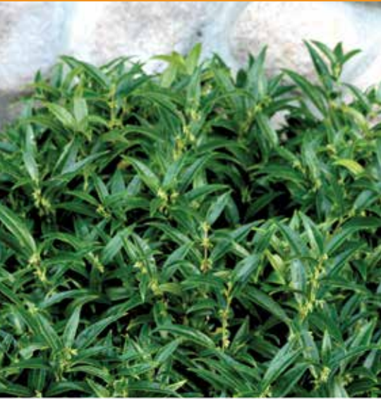
Sarcococca hookeriana var. humilis