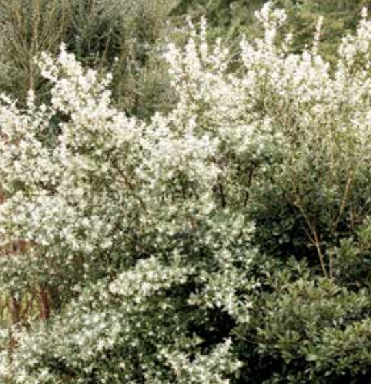
Osmanthus x burkwoodii