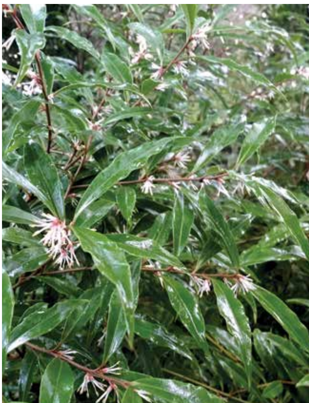
Sarcococca hookeriana var. digyna 'Purple Stem'

One of the easiest daphnes to grow is Daphne mezereum .