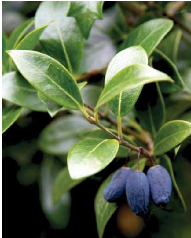
Osmanthus heterophyllus – Attractive fruit in addition to fragrant flowers

Sarcococca confusa is often confused with Sarcococca ruscifolia in the nursery trade. Most plants sold are Sarcococca confusa . Fortunately, it is the hardier of the two species. Reaching around 4 feet tall and a similar spread it makes a nice informal hedge shrub for shady areas. Far Reaches Farm in Port Townsend recently introduced a beautiful form of true Sarcococca ruscifolia collected in China by the famous plant explorer Roy Lancaster. This selection is called Sarcococca ruscifolia var. chinensis ‘Dragon Gate’ and has recently been planted at the Miller Garden. Selected for its more compact habit, I have been impressed with our young plants.