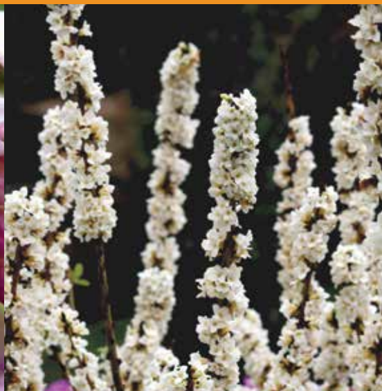
Daphne mezereum 'Bowl's White'

available now with varying degrees of variegation and flower colors. This evergreen shrub demands light to dapple shade and well-draining soils. The roots on young plants are often weak and plants will typically lean, resting their main branches on the ground with age. The heavily fragrant flowers begin opening in February and continue into late March or early April.