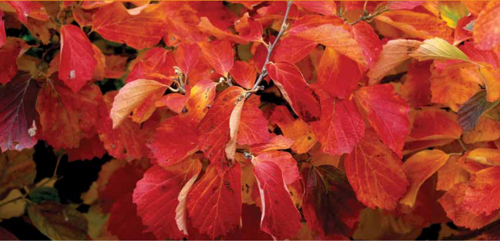
Fothergilla 'Mt. Airy'

adaptability and long life. Some specimens in the Garden have been growing for many years in a hot and dry setting, subjected to the reflected heat of asphalt, while others are growing happily tucked into shady rockeries.