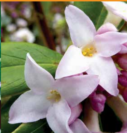
Daphne bholua