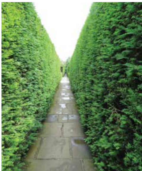
Yew hedge at Sissinghurst Castle Garden, Kent, England