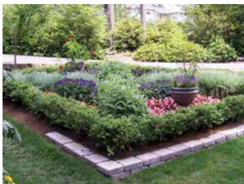
Ilex crenata 'Convexa' hedge around knot garden, Gig Harbor, Wash.