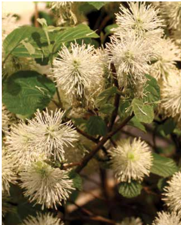
Fothergilla 'Mt. Airy'

Besides its adaptability to a range of sites, Fothergilla is a satisfying plant to garden with. Due to its multi-stemmed habit and amenability to pruning, it's a plant that can be shaped within a landscape over time. For example, it can be treated as a cut back shrub periodically. At the Garden, we have several specimens that are quite large and beautifully shaped. They consist of fewer, but substantial stems, each branching repeatedly to form an intricate mound. The creation of this shape begins with cutting the shrub to the ground. Over time, the shape described above is created