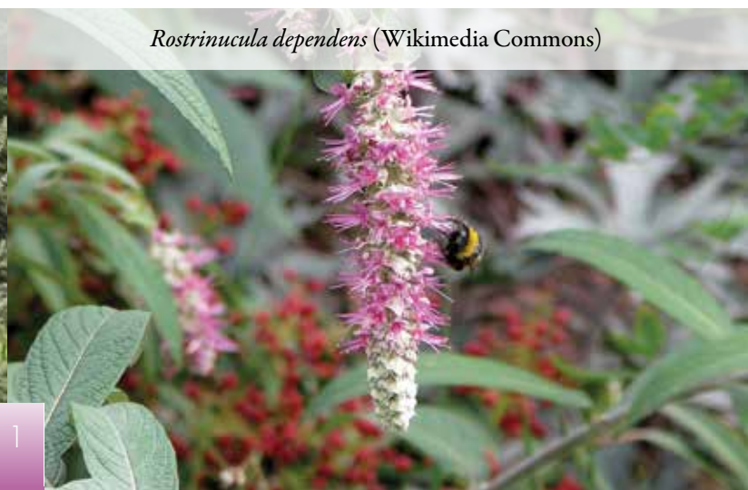
Rostrinucula dependens (Wikimedia Commons)