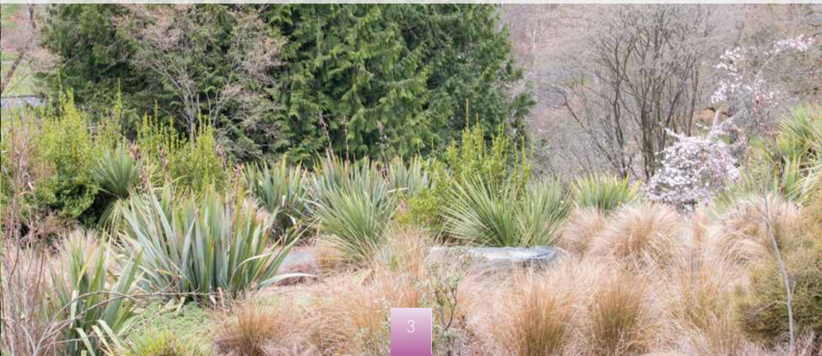
University of Washington Botanic Gardens