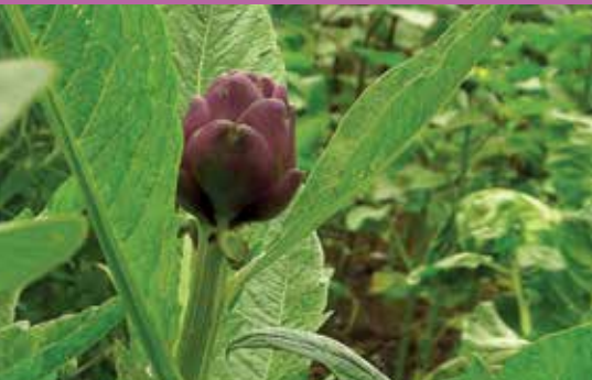
Violetto artichoke brings drama with bold foliage