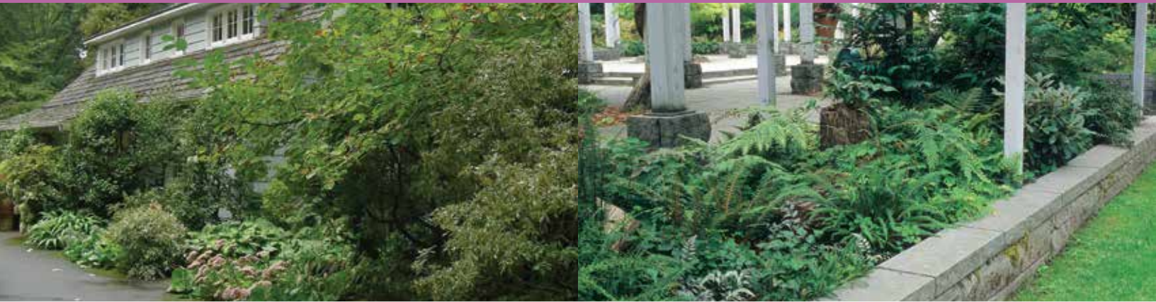
Dunn Gardens