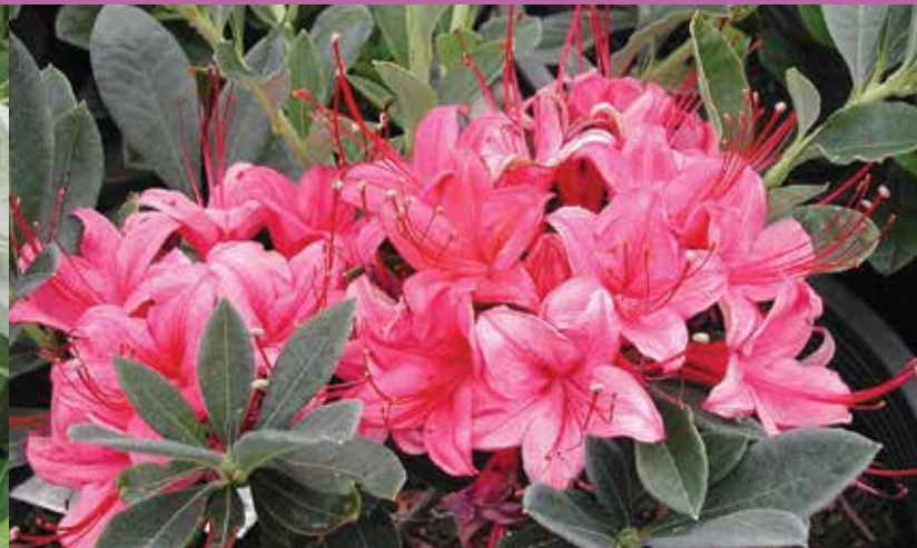
Rhododendron 'Millennium' (Briggs Nursery)