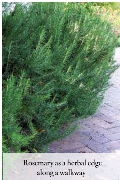
Rosemary as a herbal edge along a walkway

Lavender: Lavandula angustifolia ‘Hidcote’ is 2’ tall × 2’ spread or large cultivars like ‘Grosso’ at 3’ tall × 4’ spread or ‘Phenomenal’ at 3’ tall × 3’ spread.