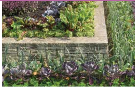
Parsley for low edging