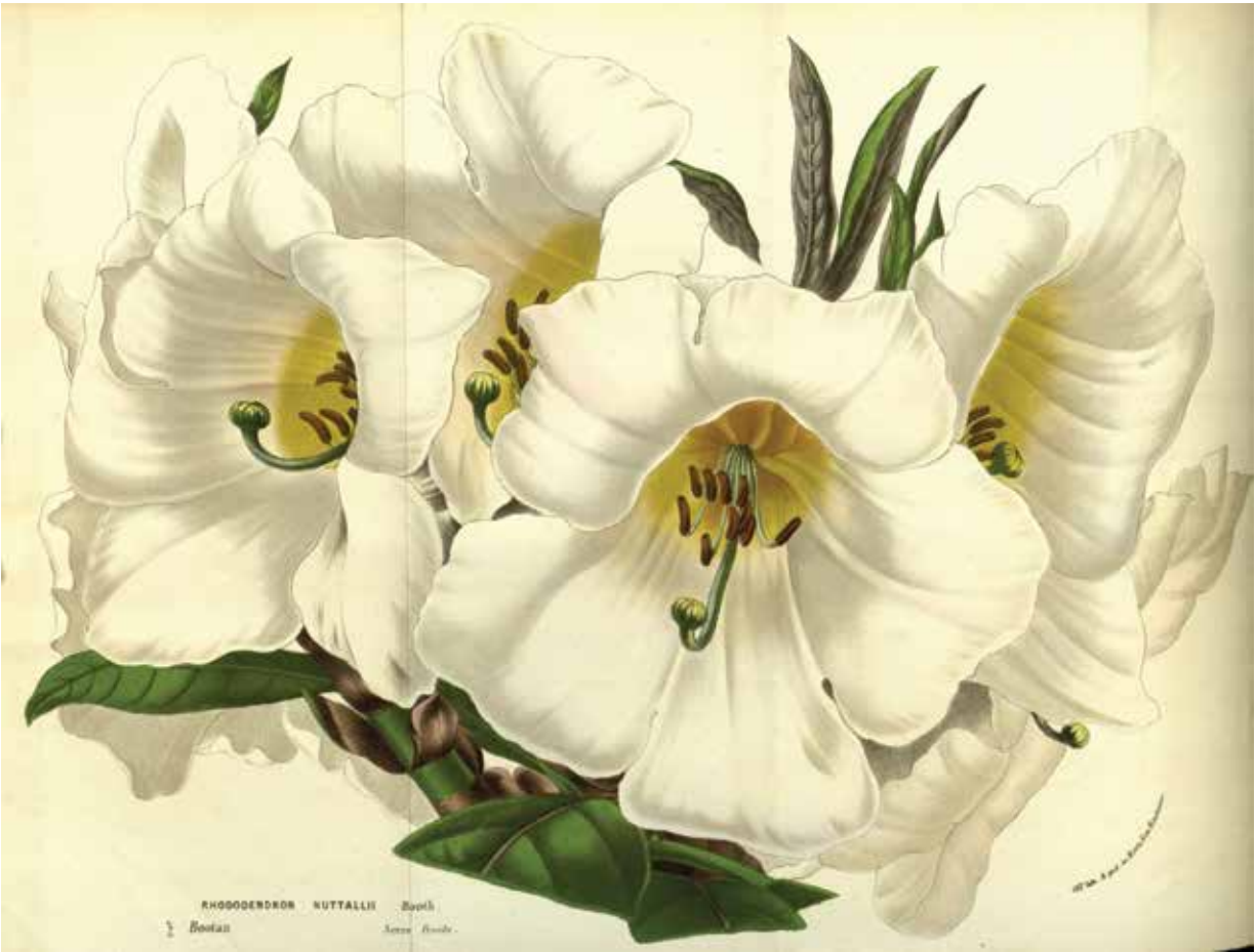
Rhododendron nuttallii – from Flora of Greenhouses and Gardens of Europe, 1845 (Wikimedia Commons)