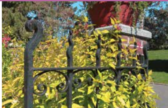
Golden pineapple sage