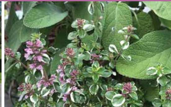
Foxley thyme and sage in a window box

orful leaf varieties like ‘Madonna’, ‘Black Beauty’, or ‘Black Lace’.