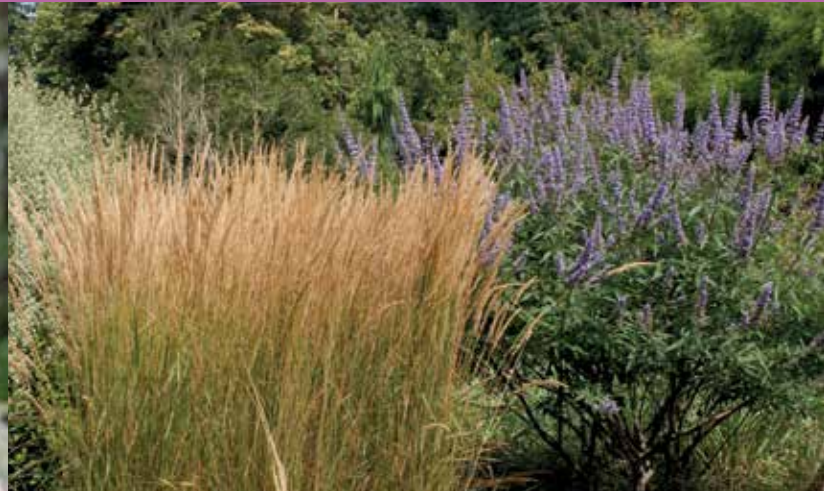
Vitex agnus-castus with Calamagrostis × acutiflora 'Karl Foerster'

Each of these species is exceptional in its own right with the hybrid combining the best of both parents. Tubular, white flowers open with a touch of yellow in the throat of the flower. The mid-July flowers are sweetly fragrant. The glossy green leaves have a nice bronze flush to the new growth. R. 'Weston's Lemon Drop' has light yellow blooms with a delightful citrus fragrance and are peachy pink in bud. The flowers open in July and are nestled in the blue-green foliage. R. 'Weston's Lollipop' and R. 'Millennium' both have pink flowers; although, R. 'Weston's Lollipop' is paler in color with light pink blossoms striped in white with a prominent yellow flare. R. 'Millennium' opens after R. 'Weston's Lollipop' and has deep reddish pink buds that give way to soft cherry pink flowers tucked into beautiful blue-green foliage. R. 'Weston's Lollipop' also tends to be shorter only