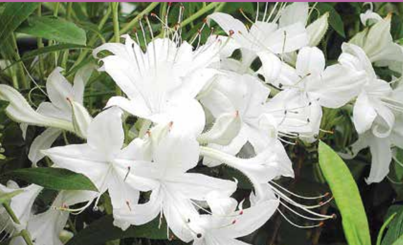
Rhododendron 'Weston's Innocence' (Briggs Nursery)