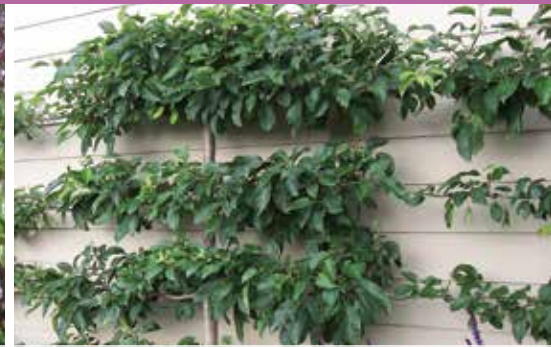
Espaliered pear for vertical wall planting

Edible landscape plants produce a part of the plant that can be used for food or flavoring. The next step in design is how they add permeance, color, texture, or something aesthetic to a landscape. Think blueberry hedges for a hedgerow along a property border or lingonberries and highbush cranberries in damp areas. Play up design texture with artichokes, rhubarb, and vining golden hops and give container gardens a theme with colorful leaves like purple basil and a tidy growing patio tomato.