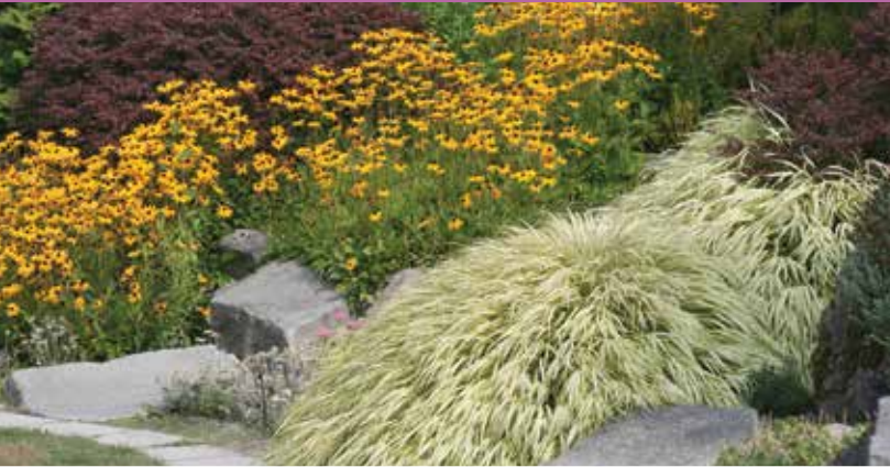
Bellevue Botanical Garden