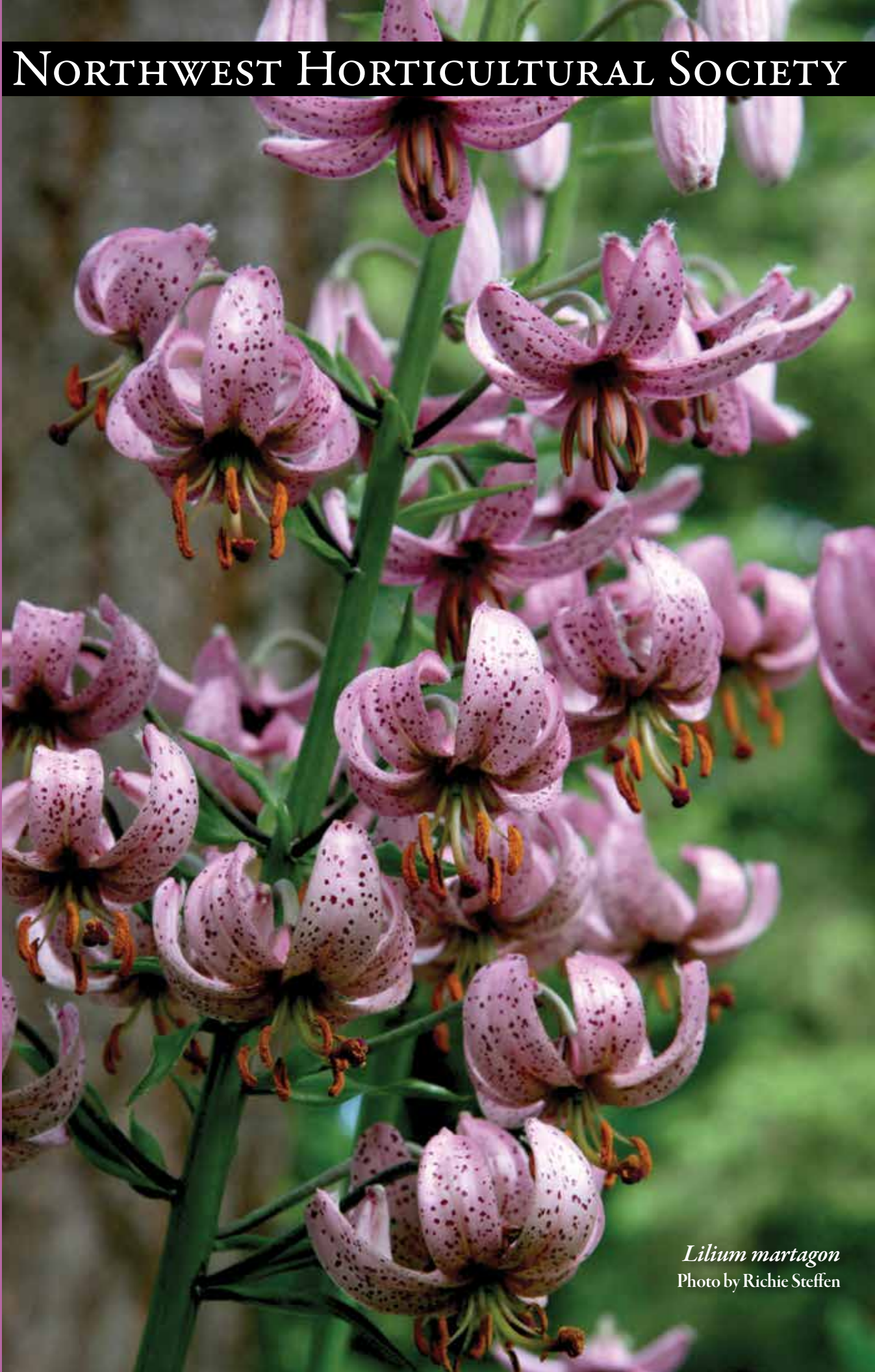
Lilium martagon