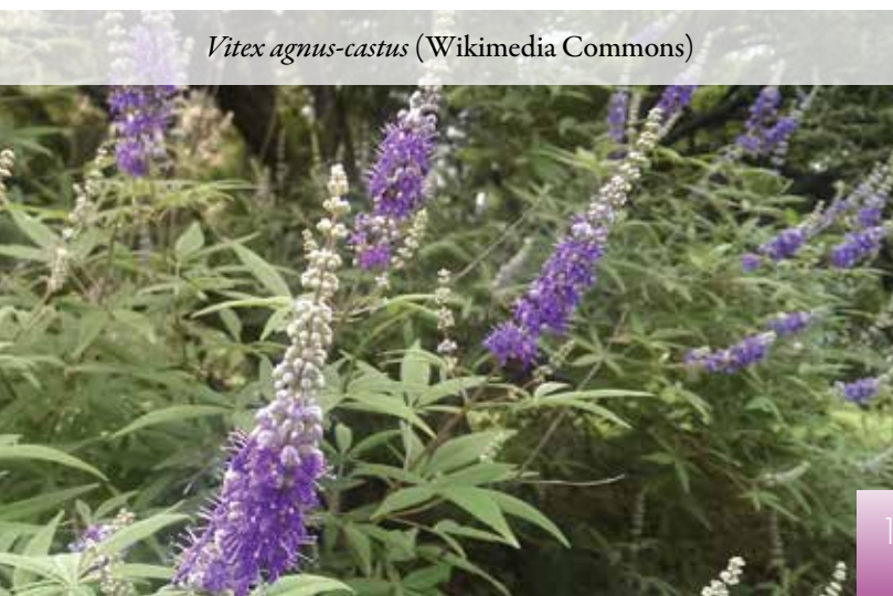
Vitex agnus-castus

Another fragrant, large shrub that can be treated as a small tree is Clerodendrum trichotomum , harlequin glorybower. Bold heart-shaped leaves have a distinctive peanut butter smell. In August, clusters of red buds open to reveal white flowers that have a perfume fragrance. After the flowers fade, the calyx turns scarlet red and a bright blue fruit develops extending the show into the autumn. To prevent this shrub from suckering, plant it in an area that is not cultivated to prevent disturbance of the roots. A smaller relative, but very different, is Clerodendron bungei , rose glorybower. This suckering shrub typically reaches 4 to 7 feet high as single or sparsely branched stems. Bold, deep green leaves, flushed with purple, are topped by bright purple pink, dense clusters of flowers from mid-summer to early autumn. Stems can be cut to the ground every year to keep a tidy planting.