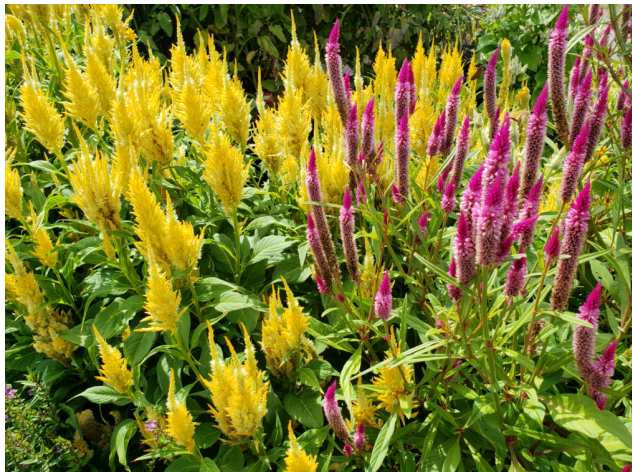
Plume and Wheat type Celosia , warm season annuals, provide bright color all summer long.

particularly appealing as young plants in cell packs or do not transplant well. Understandably, garden centers invest in the more marketable and faster moving plants. The easily seed grown plants in this list are exquisite performers certainly worthy of attention as colorful and inexpensive additions to the landscape.