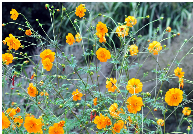
Cosmos sulphureus , Sulfur cosmos add height and movement to the landscape.

Finally, do not underestimate fellow gardeners' willingness to share!