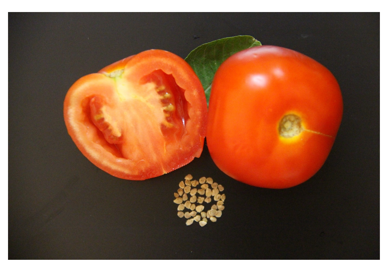
Figure 1. Tomato and its seeds.

To the best of our knowledge, this is the first review considering the valorization potential of tomato seeds and their scope of utilization as major food ingredients in the functional food industry, along with recent updates on research conducted worldwide. Various components discussed in the manuscript are shown in Figure 2.