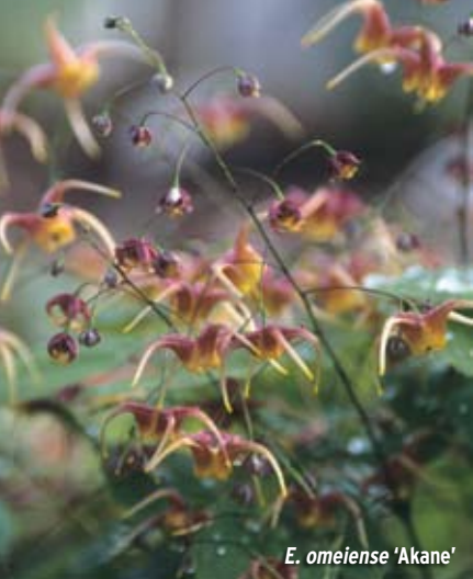
E. omeiense 'Akane'