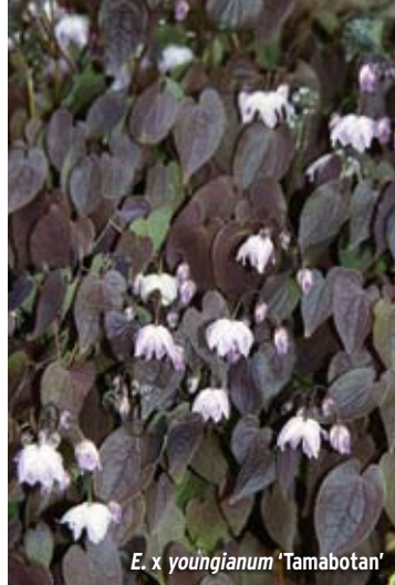
E. x youngianum 'Tamabotan'