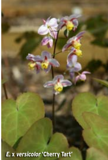
E. x versicolor 'Cherry Tart'