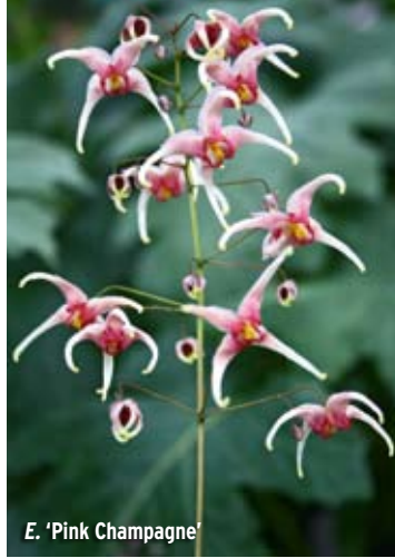
E. 'Pink Champagne'