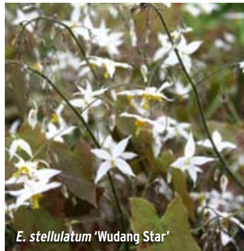
E. stellulatum 'Wudang Star'

Epimedium stellulatum (Zone 5–8) is similar to the above three, but with even larger flowers on a 50cm stem that gives it considerably garden value. The commonest cultivar of E. stellulatum is Roy Lancaster's dwarf 30cm high 1983 Chinese collection 'Wudang Star'. There is