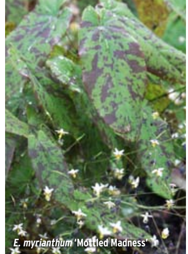
E. myrianthum 'Mottled Madness'

species with spreading rhizomes and small yellow spurless bell-shaped flowers on 30cm stems. Two other similar Chinese species with compact rhizomes are E. ecalcaratum (Zone 5–7) and the clump-forming evergreen E. campanulatum (Zone 4–7a), topped in spring with 60cm stems with small yellow bells.