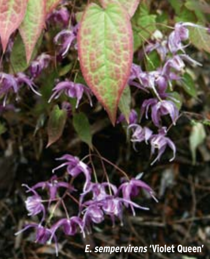
E. sempervirens 'Violet Queen'