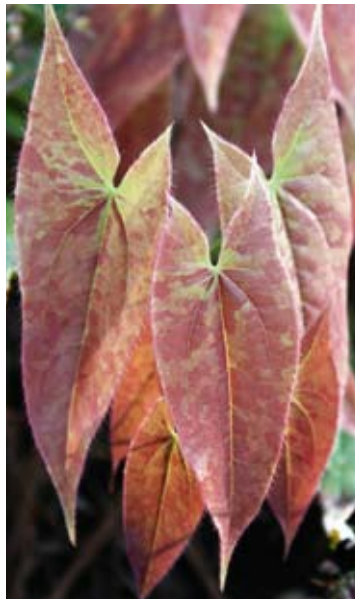
Epimedium sagittatum 'Warlord' (above) and Epimedium 'Yokichi' (below) are two new selections

In gardening circles, epimediums are known as great plants for dry shade. However, in the wild most grow in very moist soils, with many being found near woodland waterfalls. While epimediums will indeed grow in dry shade, they fare much better in part sun to light shade with a rich, organic, moisture-retentive soil. As with all plants, avoid using salt-based fertilisers which can burn epimediums when used in excess. Hybrids such as E. x perralchicum , E. pinnatum subsp.