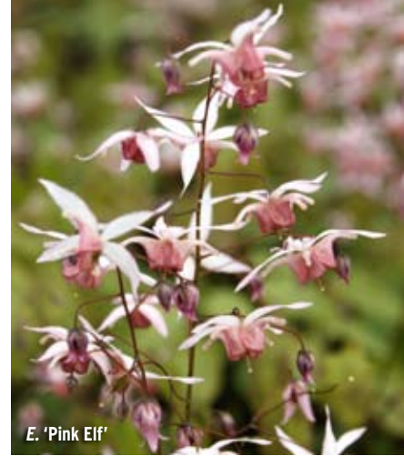
E. 'Pink Elf'