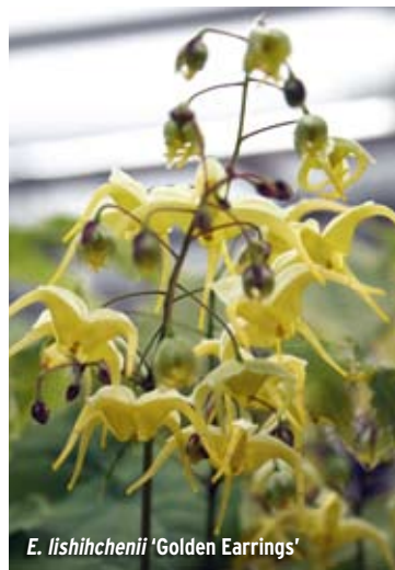
E. lishihchenii 'Golden Earrings'

flower spikes can be heavy enough for the tips to nearly touch the ground. For this reason I plant E. acuminatum and E. x omeiense on a bank so the flowers can be better enjoyed. Both are prized for their long-pointed and wonderfully mahogany-coloured, mottled leaves. Both are reasonably good spreaders.