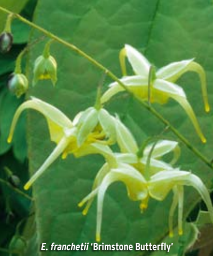
E. franchetii 'Brimstone Butterfly'