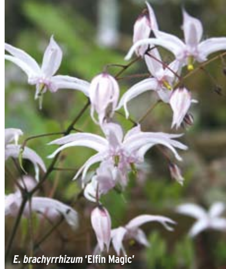
E. brachyrrhizum 'Elfin Magic'

'Pierre's Purple' (dark purple flowers), 'Princess Susan' (purple outer sepals, white cup and spurs), 'Purple Prince' (dark purple cup, pale lavender spurs), 'Red Queen' (carmine red flowers), 'Saxton's Purple' (pale lavender flowers), 'Silver Queen' (white flowers), 'Spring Wedding' (red-edged leaves, pale lavender flowers), 'Swallowtail' (red-edged leaves, pale lavender flowers), 'Tamano-gempei' (purple outer sepals, white cup and spurs), 'Waterfall' (rose-purple flower, white spurs), 'Yellow Princess' (pale yellow flowers) and 'Yubae' (purple foliage, cranberry flowers). With the exception of E. grandiflorum 'Swallowtail', the other cultivars do not pick up their nice leaf colouration until after flowering. Many of the older selections of E. grandiflorum , such as 'Album' and 'Nigrum', have large flowers produced among or just slightly atop the foliage, usually obscured by the second spring flush.