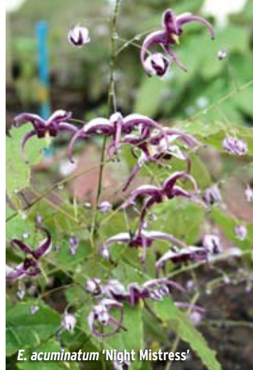
E. acuminatum 'Night Mistress'

forthcoming white-flowered 'Little Angels' from my nursery. The foliage of E. brachyrrhizum turns an attractive shade of lavender in winter.