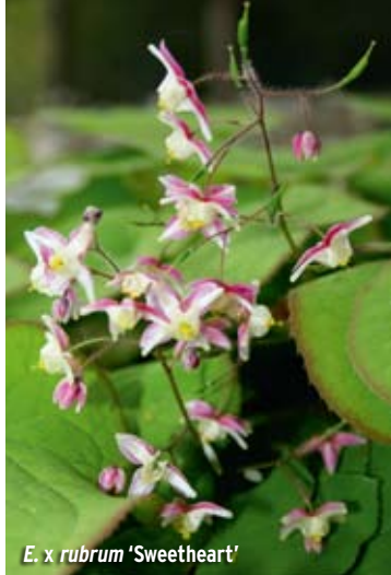
E. x rubrum 'Sweetheart'