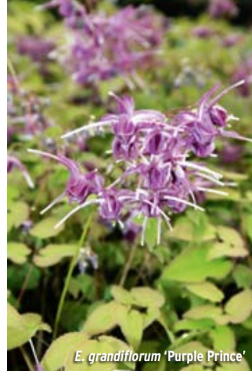
E. grandiflorum 'Purple Prince'

is represented in cultivation primarily by three cultivars, 'Nanum' (white flowers), 'Roseum' (pink flowers) and 'Vanilla Ripple' (syn. 'Variegatum') (speckled leaves). The 20cm tall flower spikes bear two to six flowers each, certainly nothing to match the showier species, and the fading flowers are topped by a second flush of spring foliage. I regard E. diphyllum as a clumping species, but one which can make a 60cm wide, easily dividable clump in seven years.