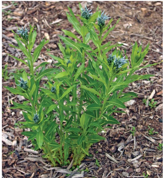
Young seedlings are easy to transplant and will flower in 2-3 years.

Willowleaf bluestar has few pest problems and is not favored by deer because of the latex in the foliage. It is easily propagated by seed, requiring 4 to 6 weeks of moist stratification for good germination. Volunteer seedlings are easy to transplant when very small (but the taproot makes this difficult later on). Seedlings will flower in 2-3 years. It can also be propagated by division of the crowns of established clumps in early spring or fall, but clumps do not require division frequently and the tough, crowded roots are hard to dig up.