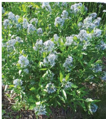
Willowleaf bluestar blooms in mid-spring to early summer.

a golden color in the fall. After the leaves fall off the fibrous stems bleach to a silver color. Both the leaves and stems exude a toxic white latex when cut or damaged.