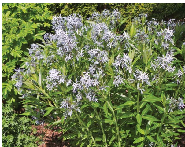
Amsonia tabernaemontana in bloom.

There are several species of Amsonia , all herbaceous perennials in the dogbane family (Apocynaceae), grown as garden ornamentals with the common name of called bluestar (including A. hubrectii ). A. tabernaemontana – with various common names including willowleaf bluestar, willow amsonia, blue dogbane, blue star-willow, eastern bluestar, and woodland bluestar – is native to the southeastern US, from Texas to Florida and up to southern Missouri and Illinois to southern New York. Found naturally in open woods, borders of streams, limestone glades, and moist sandy meadows, this long-lived plant is hardy in zones 3 to 9. It was chosen by the American Horticultural Society as one of the 75 Great Plants for American Gardens.