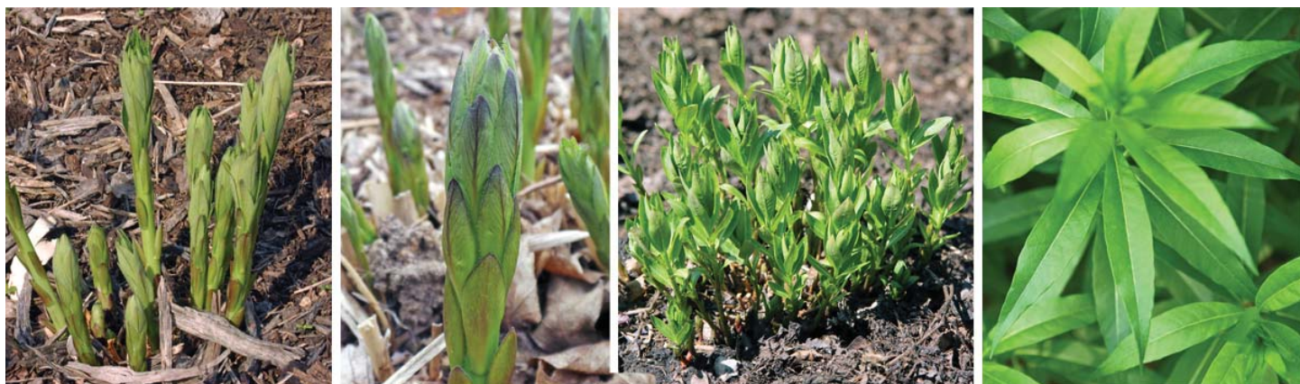
Willowleaf bluestar emerges in spring (L), with stems crowded with leaves (LC) to form a clump (RC). The lance-shaped leaves are long and narrow like a willow leaf (R).

Willowleaf bluestar emerges in early spring from a taproot. The multi-stemmed clumps that grow 2 to 3 feet tall and wide have a bushy appearance. The smooth, erect stems usually branch and are crowded from the base to the tips with alternate leaves. The hairless lance-shaped leaves are long and narrow (up to 6 inches long) like a willow leaf, with a slender petiole up to an inch long, smooth margins and pointed tips. The lower leaf surface is paler than the bright green upper surface. The foliage may develop