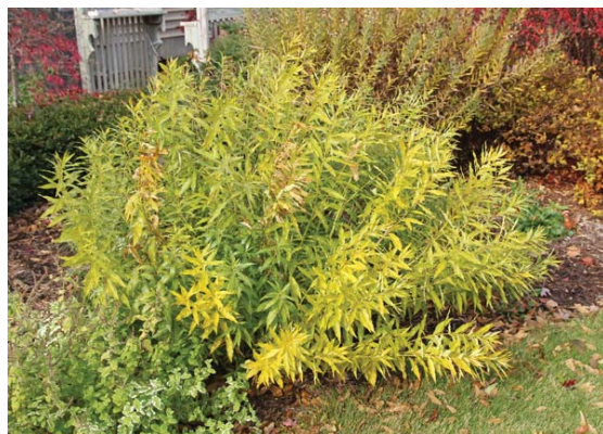
Willowleaf bluestar may turn yellow in fall.

Plants bloom for 3-4 weeks in mid-spring to early summer, with many small, pale blue, star-shaped blossoms in loose terminal clusters (branched, flat to pyramidal cymes). Each \frac{3}{4} inch wide flower has a tubular corolla with 5 spreading lobes that narrow to