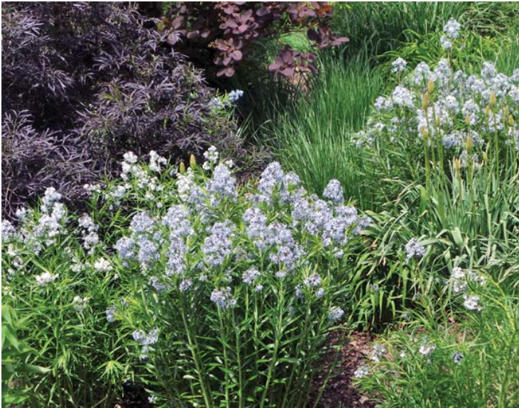
Willowleaf bluestar combines well with other perennials or with shrubs in a mixed border.

may require staking or pruning to keep them from flopping; this is rarely necessary when grown in full sun. Pruning will promote bushier growth and a more rounded form. Wear gloves when pruning because the white latex in the foliage can irritate sensitive skin. Over-fertilization will result in an open, floppy habit. The stems can be cut down in fall, or left over the winter (they will fall down under snow).