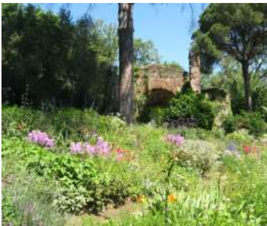
Ninfa Garden, Italy

This style has been adopted worldwide, for who can resist the blowsy fullness of texture and color? Go for multi-level, yearlong structure under layered with seasonal sweeps of color. The pallet is only as limited as your creativity and taste.