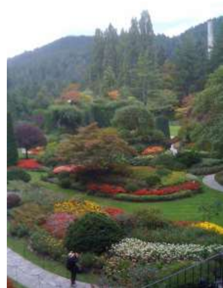
The Butchart Gardens, Victoria, BC

Adapt, adopt, copy, create. Enjoy your garden, stamping it with your own personality! Who am I to disagree?