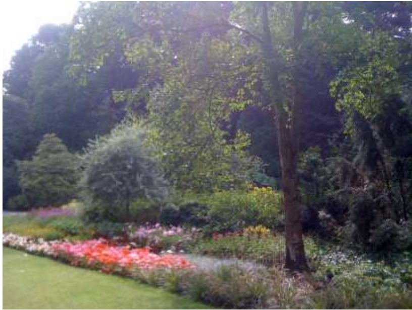
Valley Gardens, Harrogate, England

The cottage garden. This is the English heritage garden most copied in our part of the New World, and with our heritage, who can be surprised? Marked by informality, dense planting, and mixed ornamentals and edibles, it is known for its romantic, layered “naturalness”.