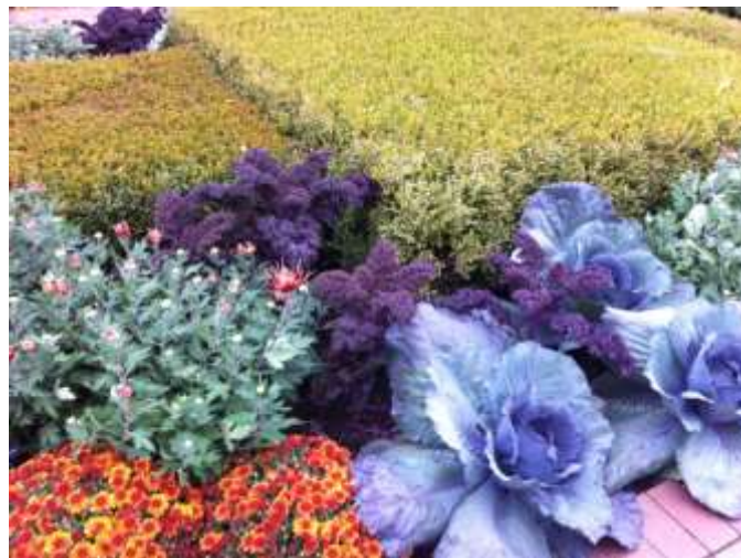
Chicago Botanical Garden

You can skip the formality of the French potager (while emphasizing your Sun King roots and potential for knighthood), and simply mix vegetables and herbs in your flowerbeds. Strongly scented flowers and herbs will discourage many of our foraging animal friends while providing food sources for our beneficial insects. And who can argue with the impact of Swiss chard, bloody rue, or purple cabbage in a colorful floral combination?