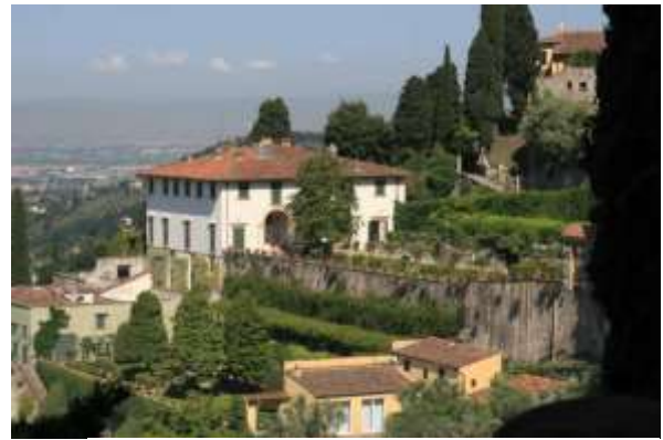
Villa Medici Fiesole, Italy

How have we imported this style? One need look no further than our very own Oatlands. Boxwood-outlined beds populated with select herbs and interspersed with citrus pots are but one adaptation. If your gardening space is diminutive, try a miniature blood orange tree in a medium size pot. This tree is easy to grow in our humid summer heat, the flowers smell heavenly, and the few fruit that it will bear are delicious...worth the work of moving the tree indoors for the winter.