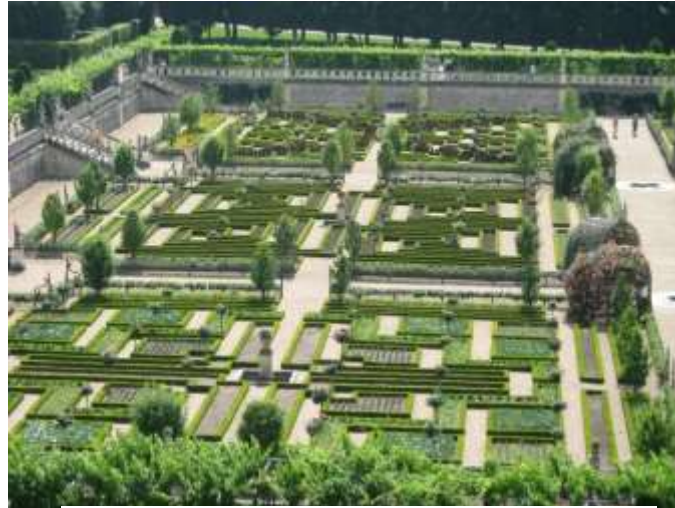
Chateau de Villandry, France

Potager, the kitchen garden. Trust the French to demand both beauty and utility from their supply gardens. Louis XIV imported a lawyer, La Quintinie, known for his horticultural skills, to produce out-of-season crops at Versailles to please the king and to increase the Sun King's mystique. For La Quintinie's labors, he was knighted. Squared beds outlined with tightly espaliered apples and pears and housing herbs, ornamentals, and successively planted vegetables mark the style.