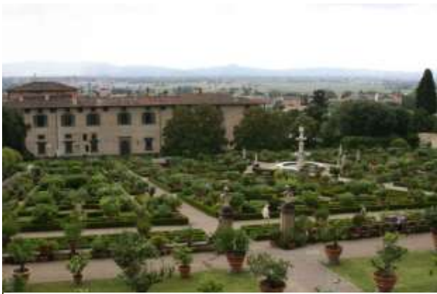
Villa Medici a Castello, Italy

The topiary garden. Renaissance Tuscan Medici gardens focused on an integrated and thematic outer landscape, with fruited terraces, water features, and squarely ordered composition. Strongly sculpted lines of topiary, interspersed with potted citrus, and occasional flashes of color, often roses or geraniums, are trademarks of the style.