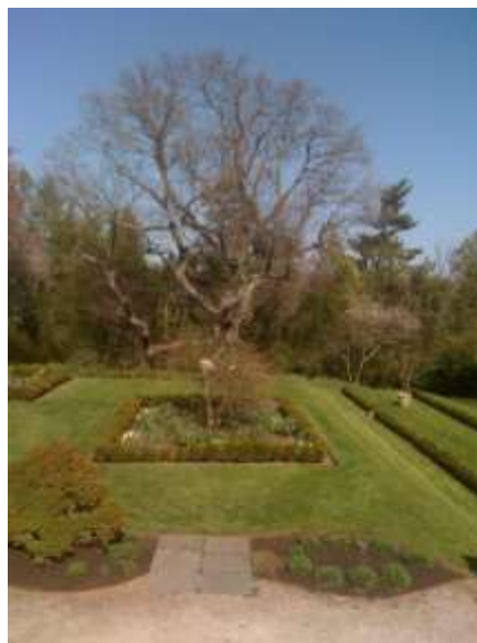
Oatlands, Loudoun County, VA

How have we imported this style? One need look no further than our very own Oatlands. Boxwood-outlined beds populated with select herbs and interspersed with citrus pots are but one adaptation. If your gardening space is diminutive, try a miniature blood orange tree in a medium size pot. This tree is easy to grow in our humid summer heat, the flowers smell heavenly, and the few fruit that it will bear are delicious...worth the work of moving the tree indoors for the winter.