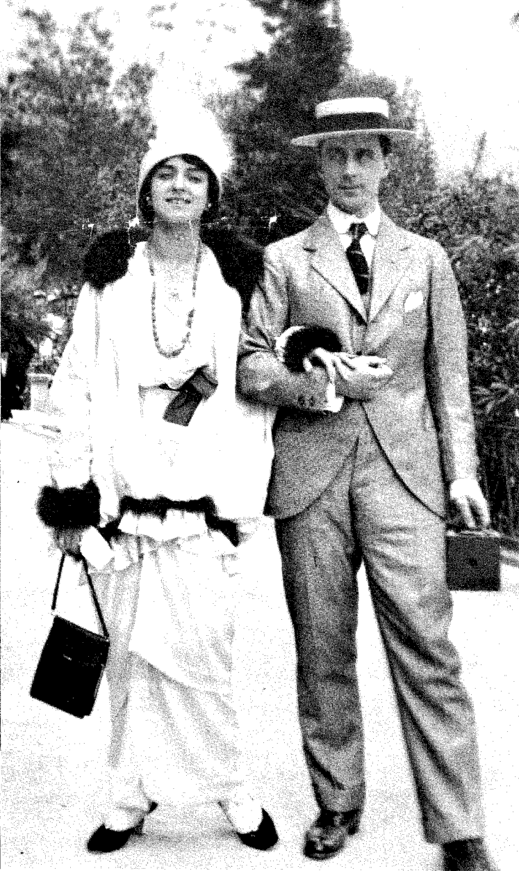
Michel and Vera Fokine Monte Carlo, 1913.

graphed the Ballets Russes from 1909 to 1912; at the end of that time the company had nineteen ballets in its repertory, fourteen of which were created by Fokine, including "Cleopatre," "Le Carnaval," "Firebird," "Le Spectre de la Rose," and "Petrouchka." In creating these ballets for his unique assemblage of performers, artists, writers and composers, Fokine was able at last to realize his reforms fully.