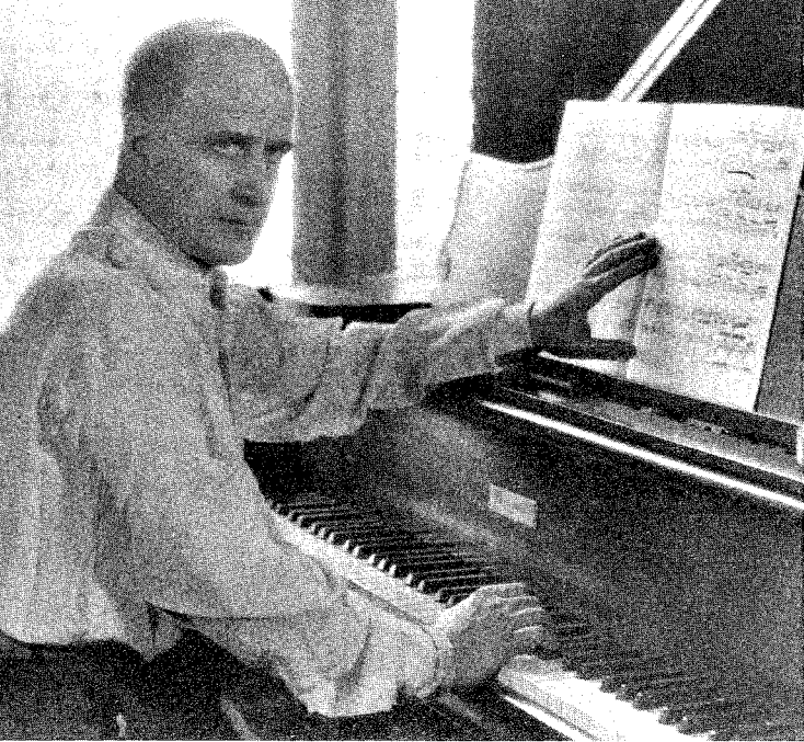
Michel Fokine at the piano in his studio. Circa 1930.