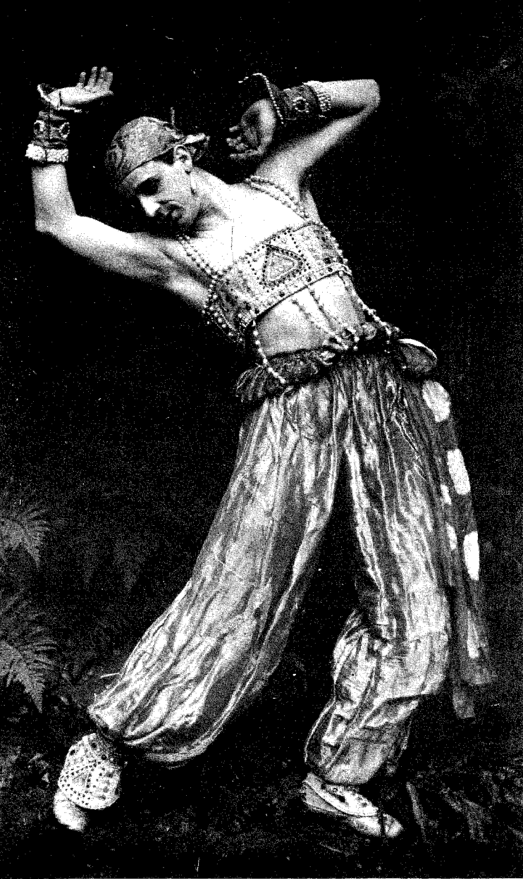
Michel Fokine as Golden Slave in Scheherazade. Circa 1912.