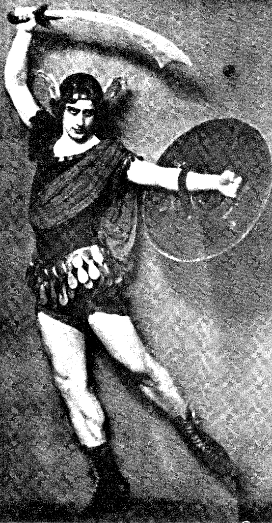
Fokine strikes a dramatic pose as Perseus in Medusa, a new work presented at the debut of the Fokine American Ballet Company in New York on February 26, 1924.

yet graceful and expressive—and his talent for mime outstanding.