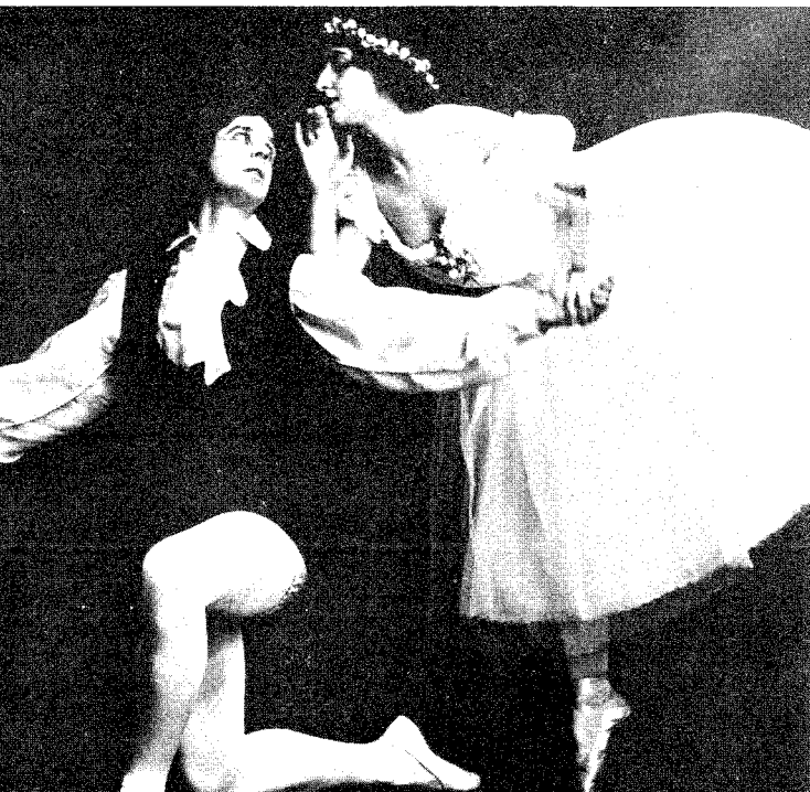
Partners in life and in art, Vera and Michel Fokine dance a graceful pas de deux from Les Sylphides.

years old when the Revolution came, by which time his parents had separated, and he was left with his paternal grandmother, who raised him.