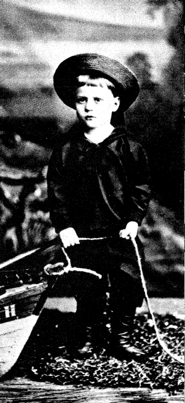
Portrait of Michel Fokine, St. Petersburg, circa 1884.

M ichel Fokine, known to many as “the father of modern ballet,” set his course early against the winds and tides of convention and in his lifetime molded classical ballet into the expressive art form we know today. So great was his influence on twentieth century ballet that it was said when Fokine presented his works in Paris in 1909, “The old ballet suddenly passed out of existence and a new epoch opened.”