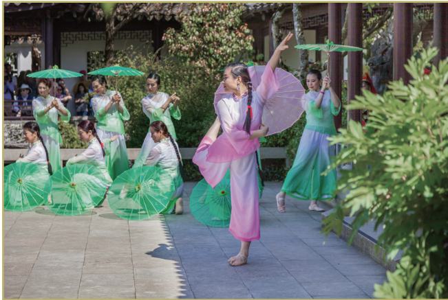
Vancouver Jasmine Dance Troupe performs in Lan Su

A celebration of the Autumn Moon Festival with extended garden hours (10 a.m.-9 p.m.) and a free Community Festival (3-9 p.m.) on the parking lot next to Lan Su!