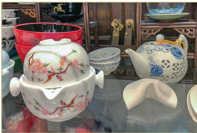
Teapot and gaiwan cup available in the Garden Shop and on sale in October

SEPTEMBER — In celebration of the Autumn Moon Festival all lanterns, themed books, and related items 15% off.