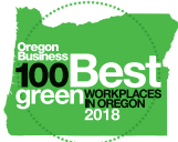
Two Year Award Winner