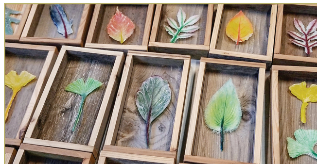
A series of glass leaves by Jen Fuller