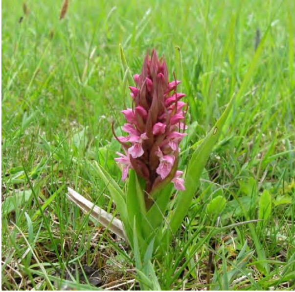
Dactylorhiza incarnata ssp. incarnata