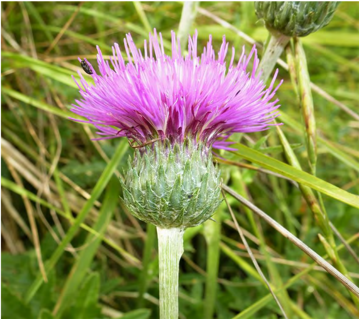
Cirsium tuberosum Tuberous Thistle at Oliver's Castle