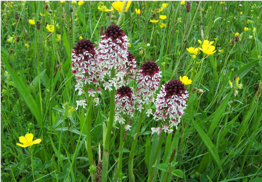
Neotinea ustulata Burnt Orchid at Clattinger Farm