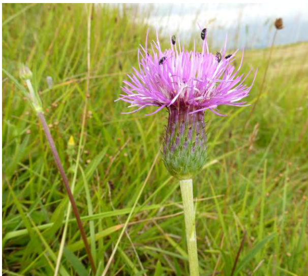
Cirsium x medium