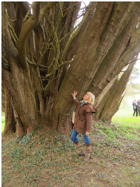
Tracy Hamilton & the Irish champion Cupressus macrocarpa

On the front lawn we first looked at some remarkable trees: two beeches, one with apparently no trunk at all and the second with many of its branches fused together, a cut leaf beech with a very graceful habit, a deodar cedar, and a golden ash resplendent in its spring growth with branches sweeping to the ground.