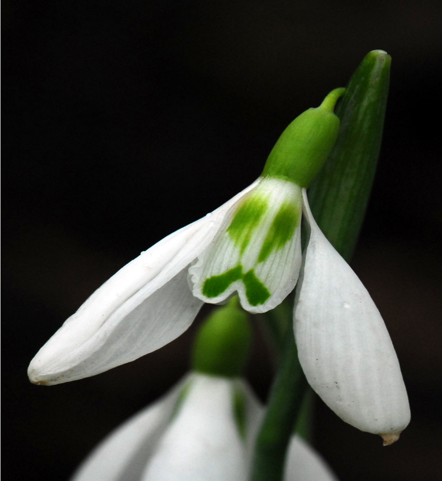
Front cover and above: Galanthus ex Longraigue