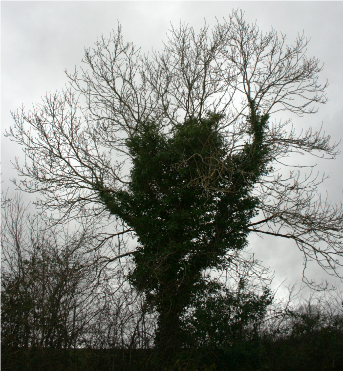
Ivy growing on an Ash tree

Ivy is taking over Ireland! Look around the country side. Every hedgerow appears to have succumbed and any emerging tree is wrapped in its stifling green embrace. In our gardens it creeps up, over and under walls, clings tenaciously to any foothold and secrets itself in any cranny. How many of our choice plants are being quietly strangled by its clutching tentacles. Beware too of the decorative ivy so innocently promoted by the garden centres. It is well camouflaged by its attractive appearance and fancy Latin name but once established will revert to its true thuggish nature. Ecologists are fifth columnists extolling the virtues of ivy as winter food for birds and cosy nesting sites. Naturally this is its master plan, for the same birds are its willing agents carrying out an aerial invasion by bombarding the land with seeds. Be alert – check your garden for infiltrators and be very wary of standing around, it could be creeping up on you.