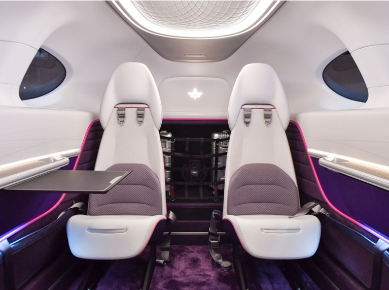
Our Pioneer Edition cabin, shortlisted for the industry's Crystal Cabin award, was unveiled at EBACE on 23 May and attracted large crowds of aviation enthusiasts, potential customers, and journalists.

Firm agreements signed for Lilium Pioneer Edition Jets, including deposit payments to Lilium