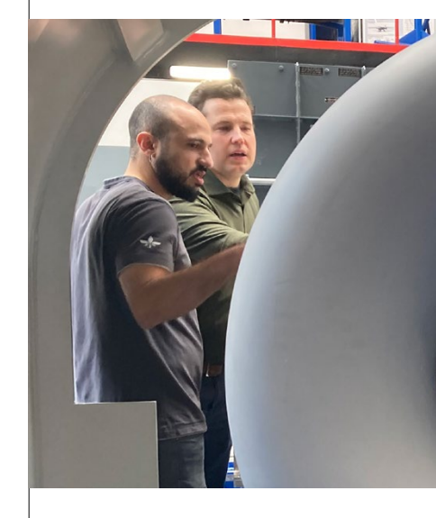
Equipment at Jetpel facilities in RWTH Aachen University, Germany testing Lilium's prototype engine.

The Lilium Jet e-motor is designed to deliver industry-leading power density, extracting 100kW of power from a system weighing just over 4kg