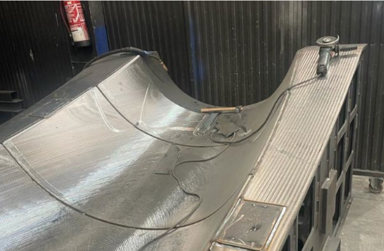
Layup mold for the bottom skin of the Lilium Jet fuselage. In order to manufacture the lightweight skin of the aircraft, composite material is laid up over the mold before being cured.