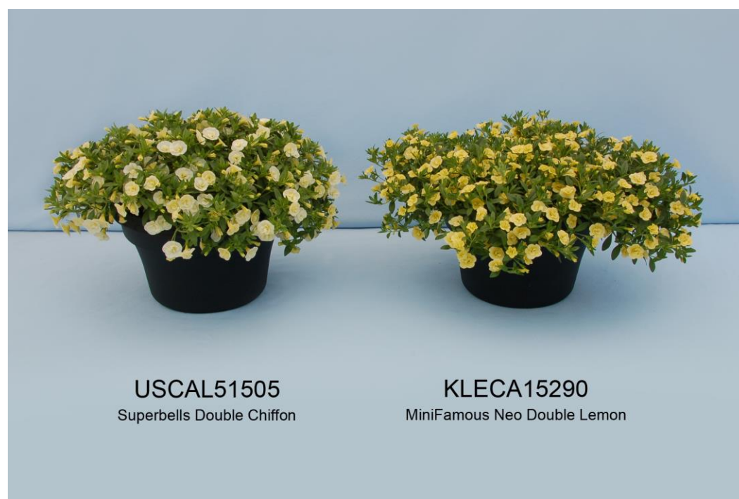
Calibrachoa: 'USCAL51505' (left) with reference variety 'KLECA15290' (right)