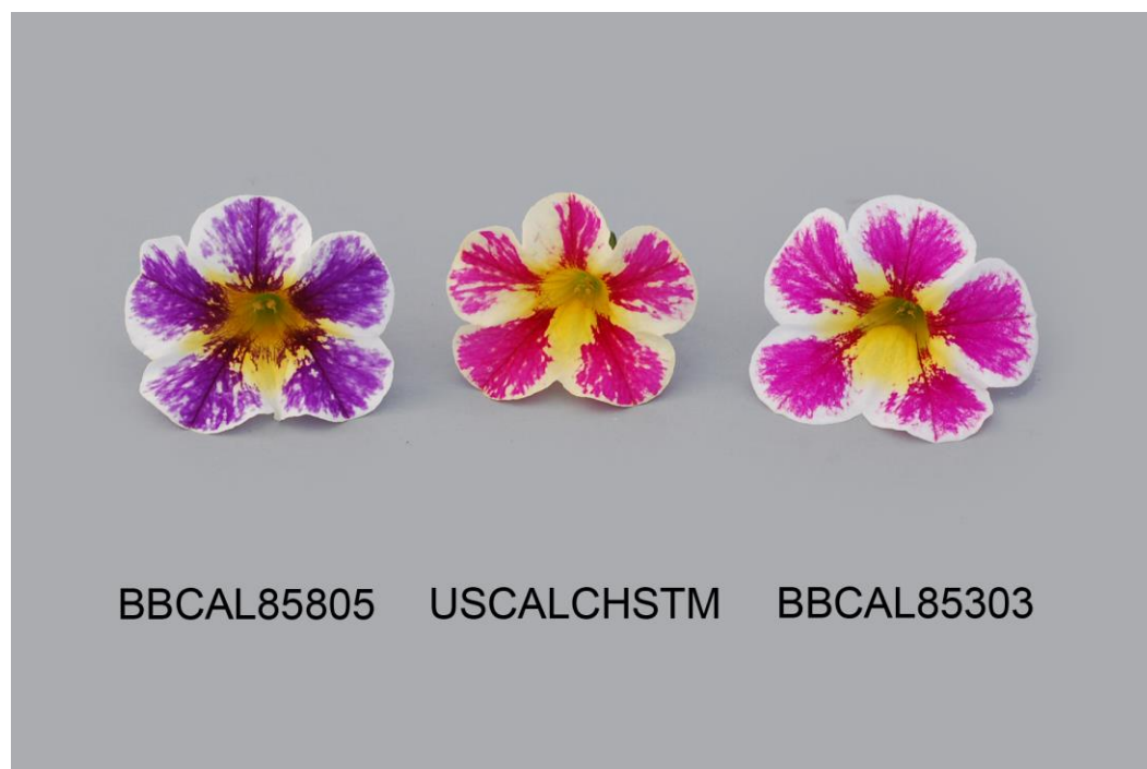
Calibrachoa: 'BBCAL85805' (left) with reference varieties 'USCALCHSTM' (centre) and 'BBCAL85303' (right)