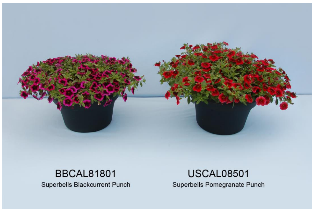
Calibrachoa: 'BBCAL81801' (left) with reference variety 'USCAL08501'