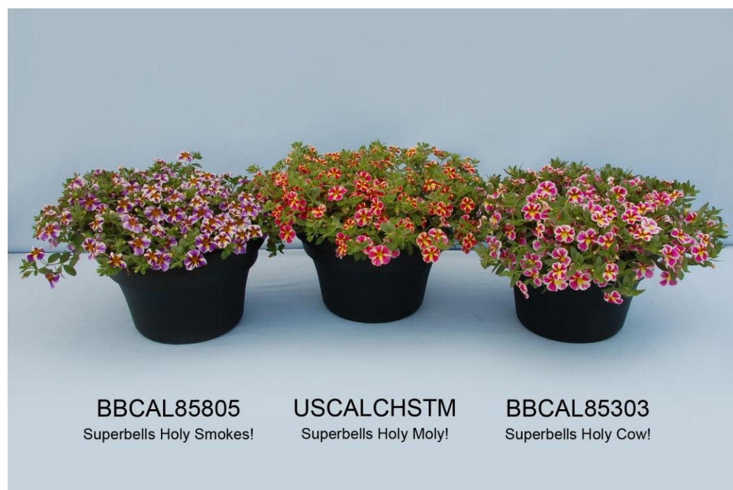
Calibrachoa: ‘BBCAL85805’ (left) with reference varieties ‘USCALCHSTM’ (centre) and ‘BBCAL85303’ (right)