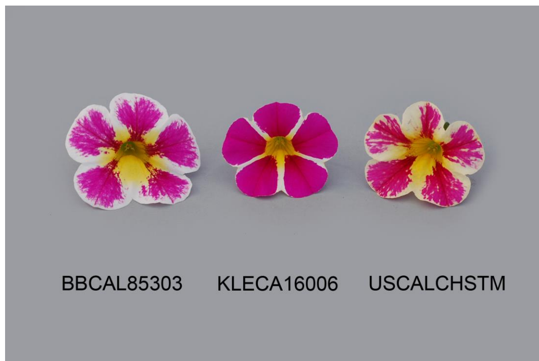
Calibrachoa: 'BBCAL85303' (left) with reference varieties 'KLECA16006' (centre) and 'USCALCHSTM' (right)