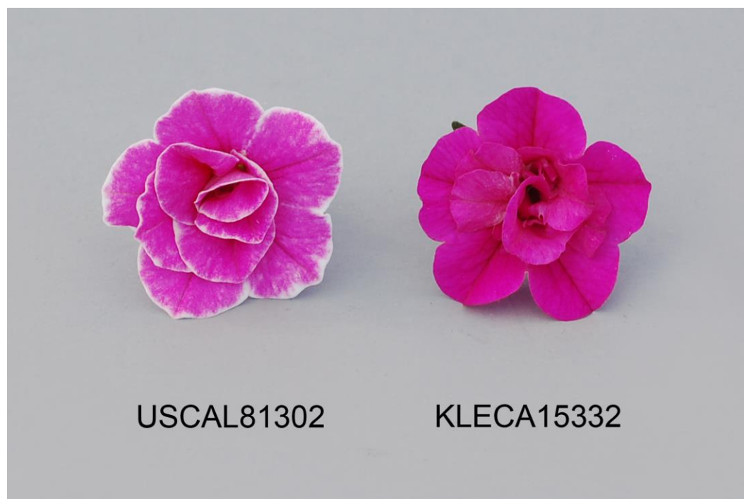
Calibrachoa: 'USCAL81302' (left) with reference variety 'KLECA15332' (right)