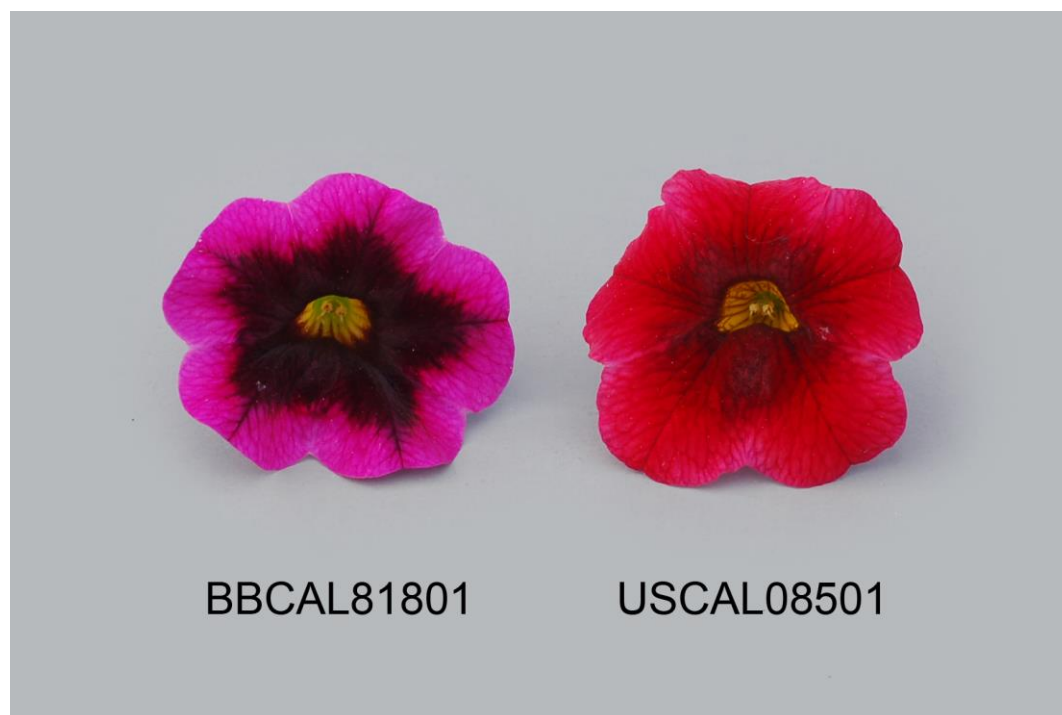
Calibrachoa: 'BBCAL81801' (left) with reference variety 'USCAL08501'