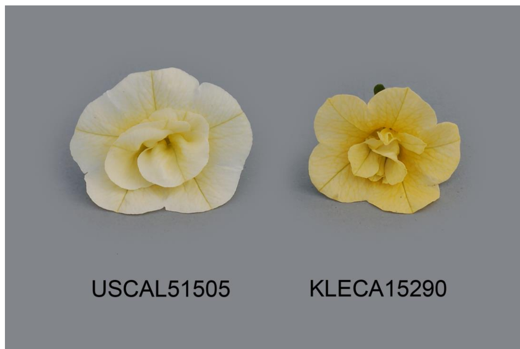
Calibrachoa: 'USCAL51505' (left) with reference variety 'KLECA15290' (right)