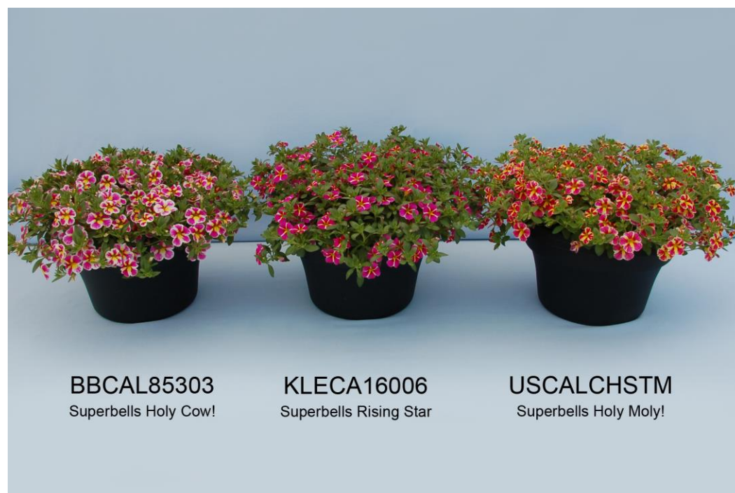
Calibrachoa: 'BBCAL85303' (left) with reference varieties 'KLECA16006' (centre) and 'USCALCHSTM' (right)