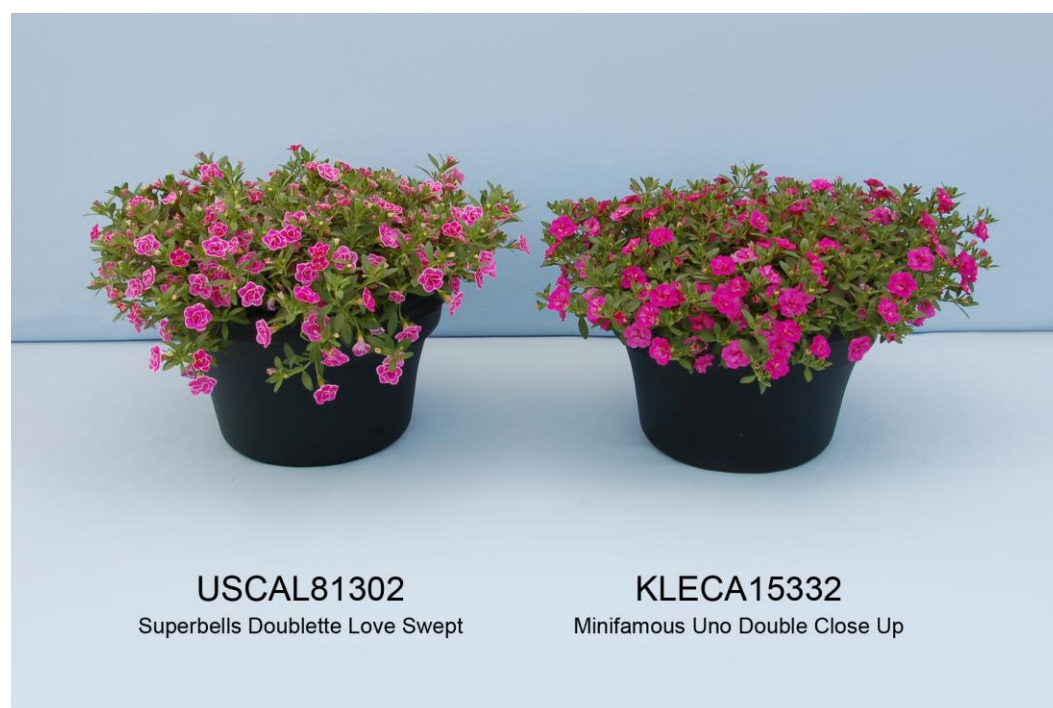
Calibrachoa: ‘USCAL81302’ (left) with reference variety ‘KLECA15332’ (right)