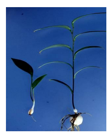
Fig. 4. Lily bulblet growth in soil (left: small bulblet growth without stem, right: bigger bulblet growth with a stem).

The size of the bulblets produced in vitro has a strong effect on performance after planting. Studies with direct field planting of bulblets produced in vitro have shown that small bulblets emerge slower, less uniform and to a smaller percentage (Lian et al., 2003). Furthermore, the growth after planting is determined by the initial bulb weight. The initial weight influences growth after planting in two ways. The weight of bulblets after a growing season is linearly related with the initial weight (Langens-Gerrits et al., 1996). In addition, when bulblets are sufficiently large (> 300 mg), they increasingly sprout with a stem instead of a rosette (Langens-Gerrits et al., 2003a). When sprouting with a stem, growth of the bulblets in soil is much better (Fig. 4). The change from sprouting with a rosette to sprouting with a stem is related to a switch in ontogenetic development from juvenile to adult vegetative.