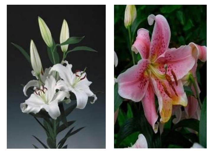
Fig. 1. Lilium cvs Santander (left) and Stargazer (right).

are that small scale-explants can be used, that scales excised from the new bulblets can be used as new starting material so that per year a few propagation cycles can be performed, and that infection by microorganisms is avoided (Fig. 3).