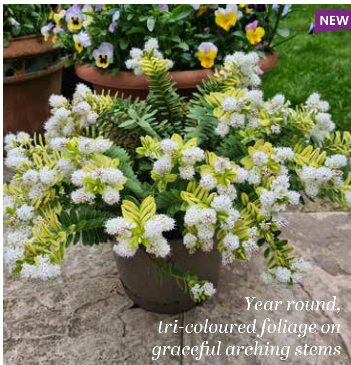
Year round, tri-coloured foliage on graceful arching stems