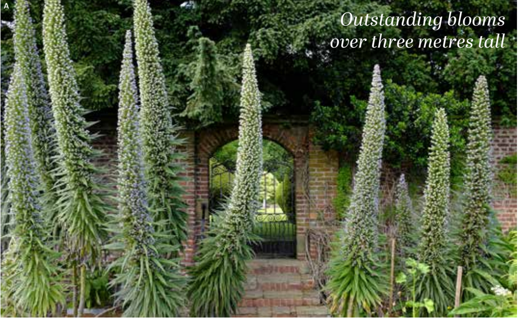
Outstanding blooms over three metres tall

POLLINATOR-ENTICING fabulous ways to encourage bees, butterflies and other pollinators into your planted spaces