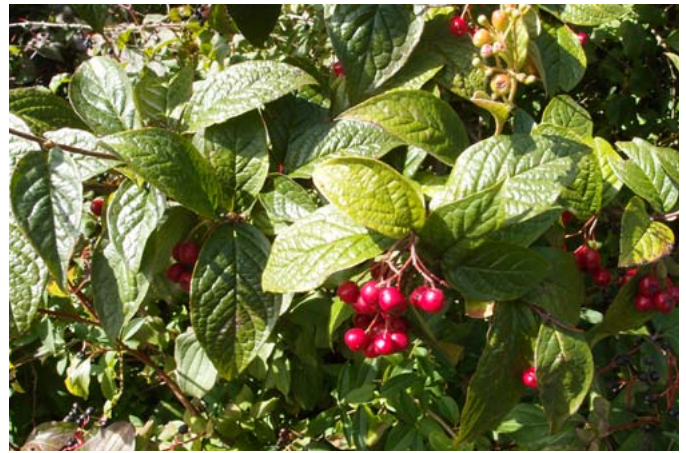
Cotoneaster bullatus , Portsdown Hill, 11 September 2011