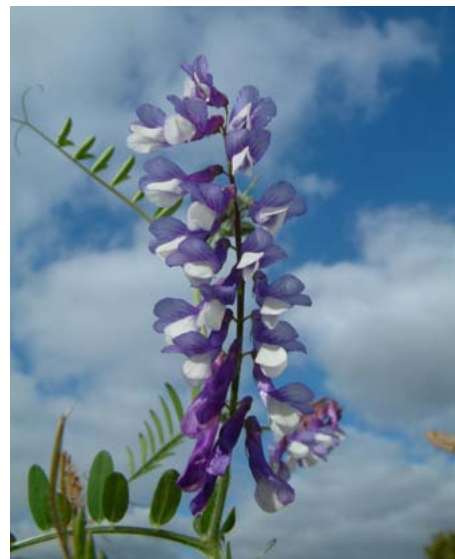
Fodder Vetch Vicia villosa , near Exbury – David Caals

Vicia villosa (Fodder Vetch): SE of Exbury, SZ432 997; 14 Oct 2011; DC. Locally abundant. Hundreds in an arable field now abandoned and fallow, clearly a relict of earlier cultivation. Series of photos provided. 1st for SZ49