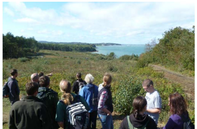
Restored heath on Bouldnor cliff top (taken in September 2011) – Natalie Rogers

The new shallow pools were visited but were bare. The historic and recently re-discovered site for Pillwort Pilularia