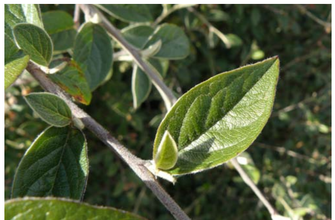
Cotoneaster franchetii , Browndown, Gosport, 12 September 2010 – John Norton

7. C. divaricatus - large patch of coppice shoots within 7 x 3m area (SU 64464 06463). Easily told by the dark, almost blackish red, large, cylindrical berries, which usually occur only in twos.