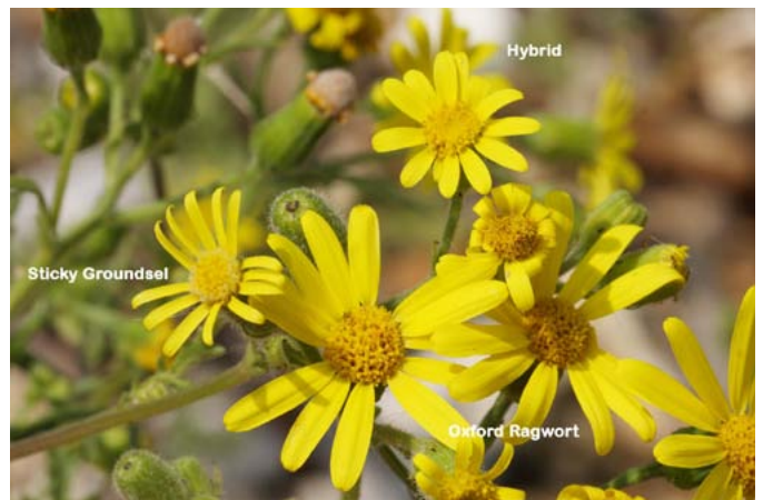
Oxford Ragwort Senecio squalidus (bottom), with Sticky Groundsel S. viscosus (left) and S x subnebrodensis (above), Hamble, 31 July 2011