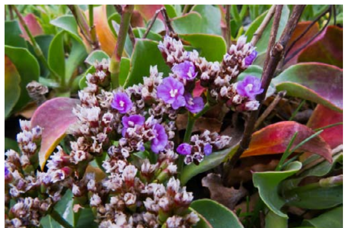
Yarrow Broomrape Orobancha purpurea (left) and Alderney Sea Lavender Limonium normannicum (above), Alderney, June 2011