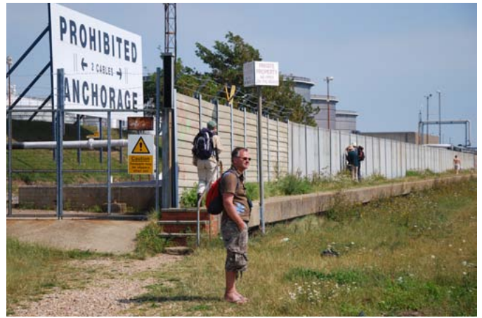
Part of the the Hamble foreshore with adjacent industry, 31 July 2011

On the Common itself the small amount of ericaceous vegetation was examined briefly before lunch with a small area of heathers and Dwarf Gorse Ulex minor surviving on the Common and coming into full flower. A large sprawling mass of Dodder Cuscuta epithymum proved the main attraction around lunch-time, not far from the Hamble edge foreshore car park, and rather bizarrely about 1.5-2