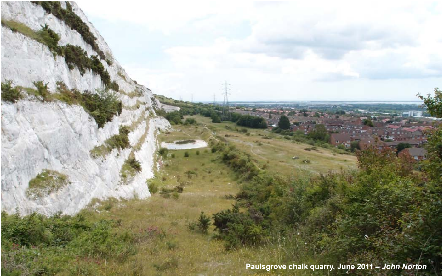
Paulsgrove chalk quarry, June 2011