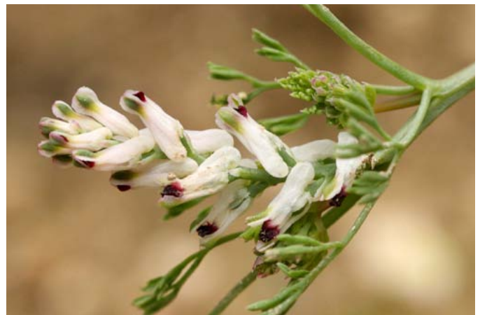
Catmint Nepeta cataria and Fine-leaved Fumitory Fumaria parviflora