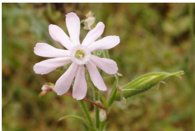
Weed-rich arable headland and Night-flowering Catchfly Silene noctiflora , 17 July 2011

but rather on a regular field edge on the way back to Flint Farm, where we found half a dozen Fine-leaved Fumitory plants Fumaria parviflora . Finally, in the hedge bottom almost opposite one of the fumitories was another cluster of Nepeta cataria .