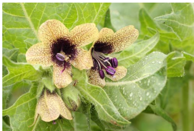
Rough Poppy Papaver hybridum and Henbane Hyoscyamus niger , Westover Farm, 17 July 2011