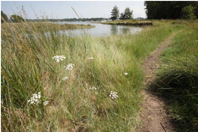
Parsley Water-dropwort Oenanthe lachenalii on the River Hamble, 31 July 2011 – Gareth Knass

This trip was billed by leader Martin Rand as a good chance to (re)familiarise yourself with a wide range of plants and a search for some coastal ecotypes, but not to expect any rarities. A good number of participants turned out on a sunny day in late July at Hamble Common for a morning wander through the Common and adjacent saltmarsh, recording plants of the Lower Hamble Estuary; and then, following lunch, a walk along the beach along Southampton Water from the Hamble northwards towards Hound and Netley, looking more closely at some coastal ecotypes of common plants.