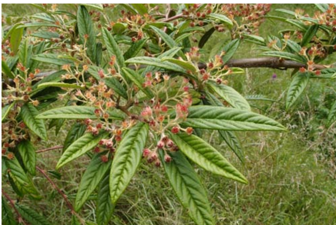
Tree-sized Cotoneaster salicifolius at eastern end of Paulsgrove chalk quarry, 24 June 2011 – John Norton

horizontalis , C. salicifolius , C. sternianus and at least one other indeterminate).