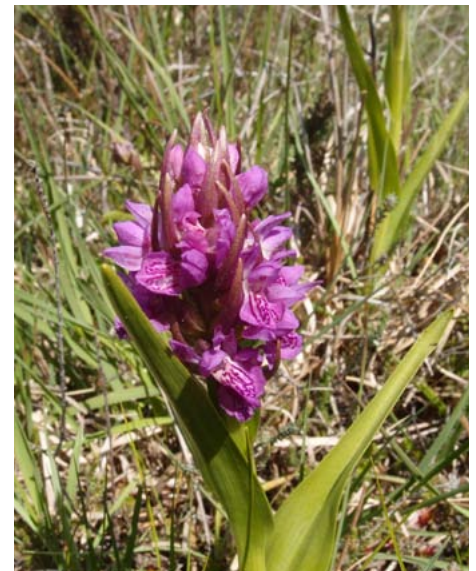
Bog Early Marsh-orchid Dactylorhiza incarnata subsp. pulchella, Bisterne Common, 21 May 2011