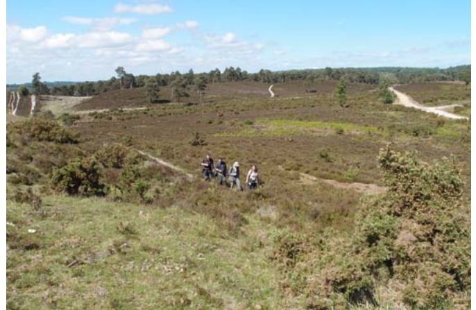
Flora Group members trekking back from Bisterne Common, 21 May 2011 – John Norton

These two trips, arranged jointly with the BSBI nationally, were to survey a single 2km x 2km square (tetrad) SU10V, in the south-west of the open Forest. It has a varied geology ranging from acid sands and peat to calcareous Headon Beds, and vegetation including conifer plantation, mire, ponds, heathland, grassland and enclosed farmland. Although not one of the honeypot sites of the Forest, it has a very good selection of the notable plants, and was last recorded thoroughly in the 1990s for Atlas 2000.