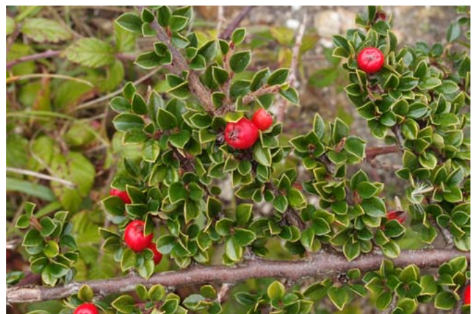
Cotoneaster horizontalis , Portsdown Hill, 18 September 2011 – John Norton

I would point out that in the list below, some grid references have been given to 10 figures, implying 1-metre accuracy, but actual accuracy is likely to be 10-30 metres. My GPS seems to miscalculate the northing (second part of the