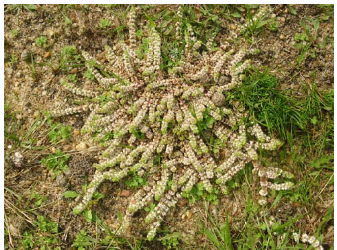
Coral-necklace Illecebrum verticillatum at Broxhead Common in 2011 – Chris Slack

Malva alcea (Greater Musk-mallow) Two plants on disturbed soil at Thrupton 2769 4497, HFG meeting 14 Aug 2011.