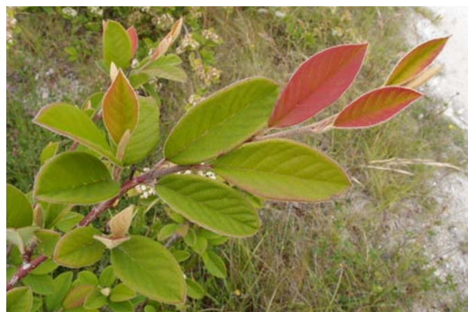
Cotoneaster lacteus, Paulsgrove chalk quarry, 24 June 2011