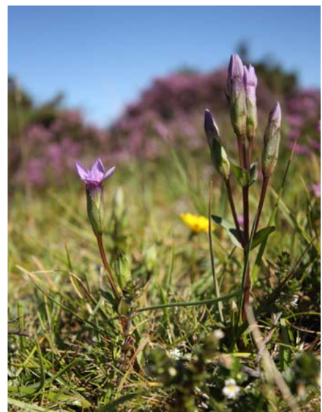
Field Gentian Gentianella campestris, S. of Burley, 20 August 2011