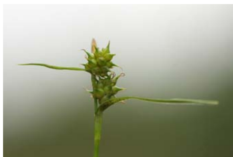
Small-fruited Yellow-sedge Carex oederi , Dur Hill, 20 August 2011 – Gareth Knass