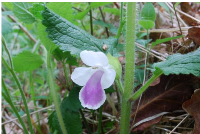
Bastard Balm Melittis melissophyllum (taken in 2010), seen at Roydon Woods on 7 June – Clive Chatters

For those satisfied with vegetative material we were also able to separate out the leaves of Narrow-leaved Lungwort Pulmonaria longifolia from larger specimens of Devil's-bit Scabious Succisa pratensis . The pleasant stroll concluded with refreshments at the Filly Inn.