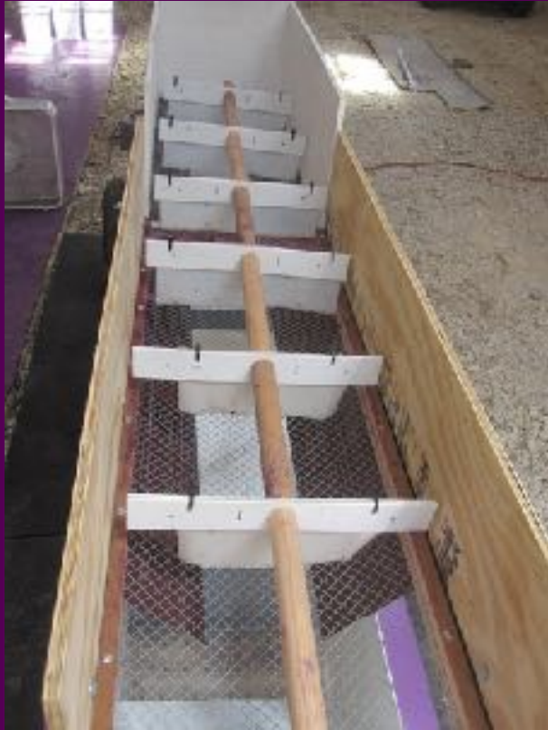
2011 Prototype De-stemming Machine