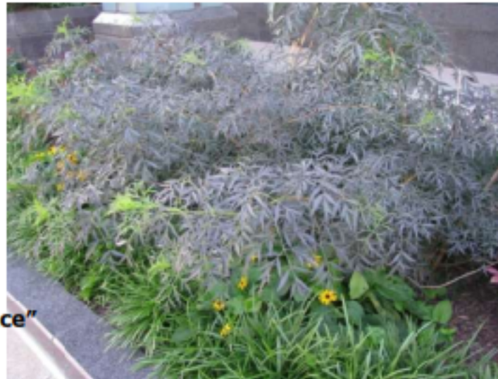
Sambucus nigra "Black Lace"

Landscape architects have begun to specify 'edible' elderberry (canadensis) to create wildlife habitat and feed people.