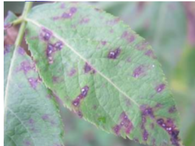
Bacterial leaf spot