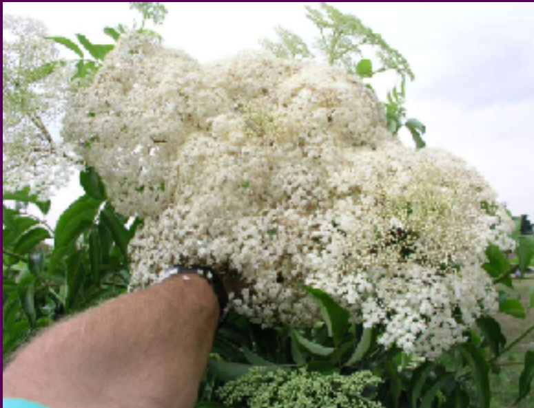
Dense flower cluster of 'Wyldeewood'