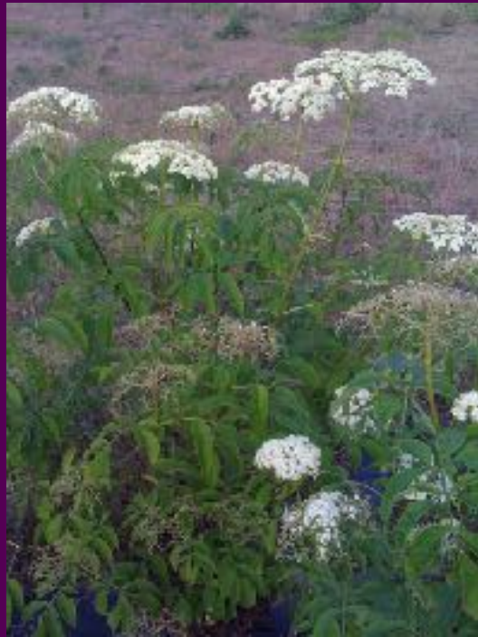
A specimen in full flower beginning to set berries