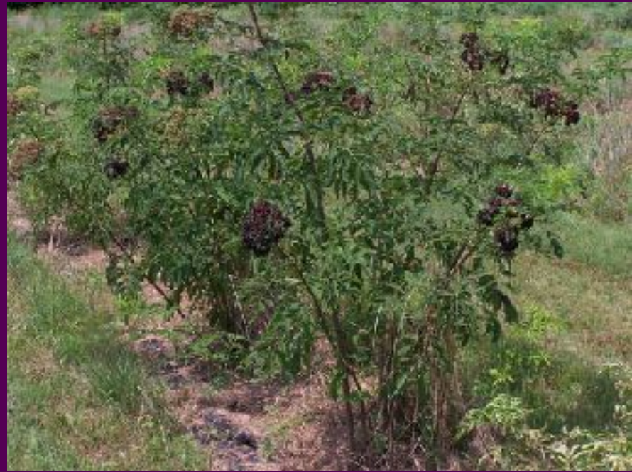
A specimen with ripe berries almost ready for harvest.