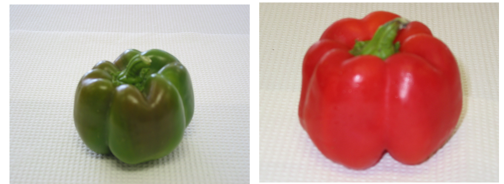
Harvest 6-7-2002, cultivar Lexington

Figure 2.1: Examples of before and after degreening of individual peppers from each Summer 2002 harvest (20°C/90% RH).