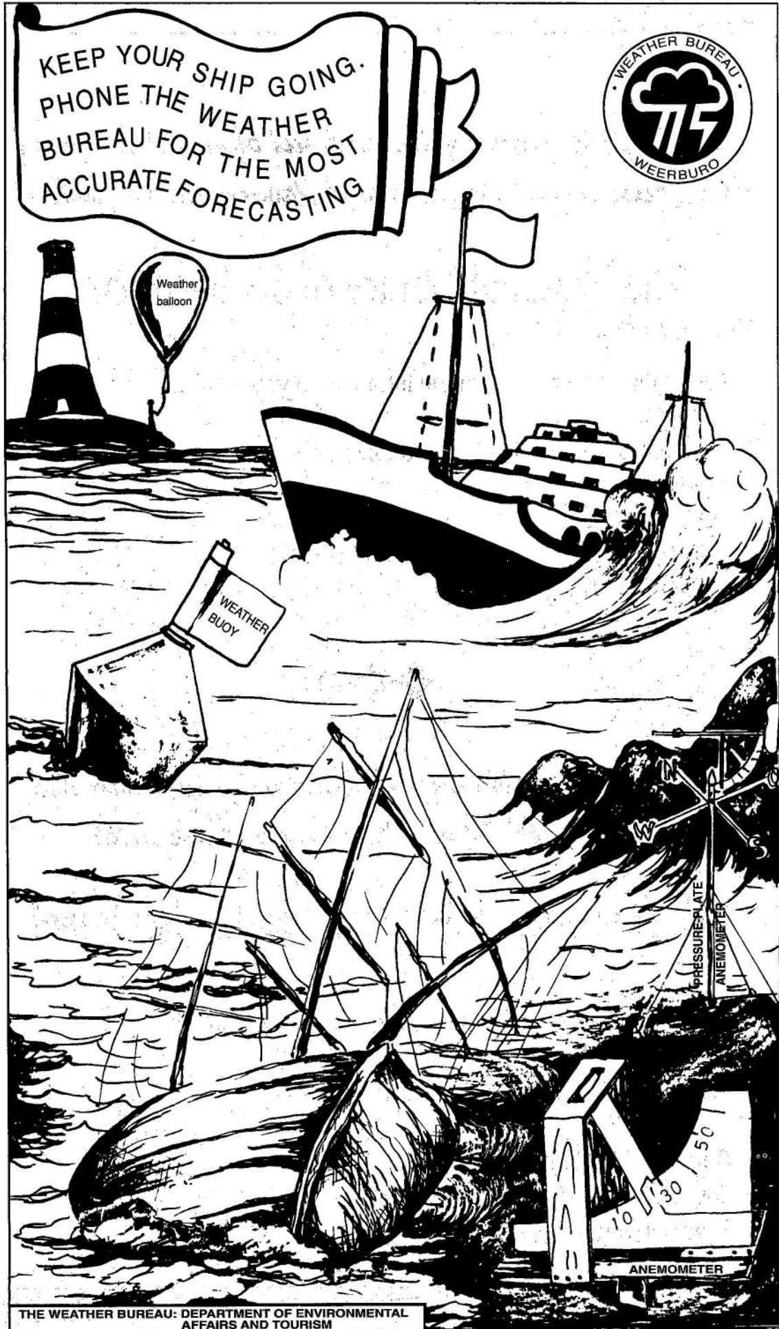
THE WEATHER BUREAU: DEPARTMENT OF ENVIRONMENTAL AFFAIRS AND TOURISM