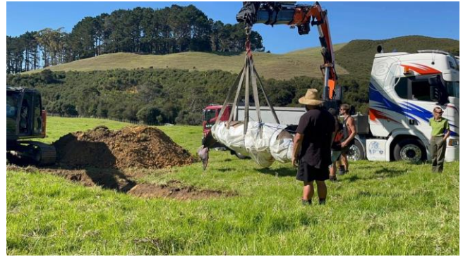
Whale being transported along the beach to Tāpapakanga for burial.