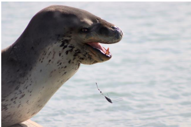
Owha with fishing tackle, including a sinker, attached to her mouth.