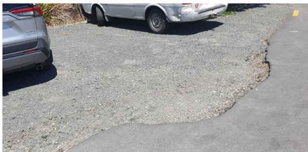
Before car park refurbishment