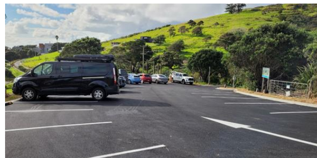
The finished result