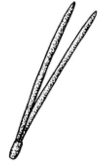
Needle Length (inches)