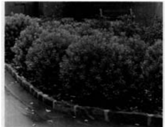
Ilex glabra 'Densa,' photographed at Longwood Gardens by M. Dirr.

'Densa' — This clone develops an oval-rounded uniform outline with upright branches. The