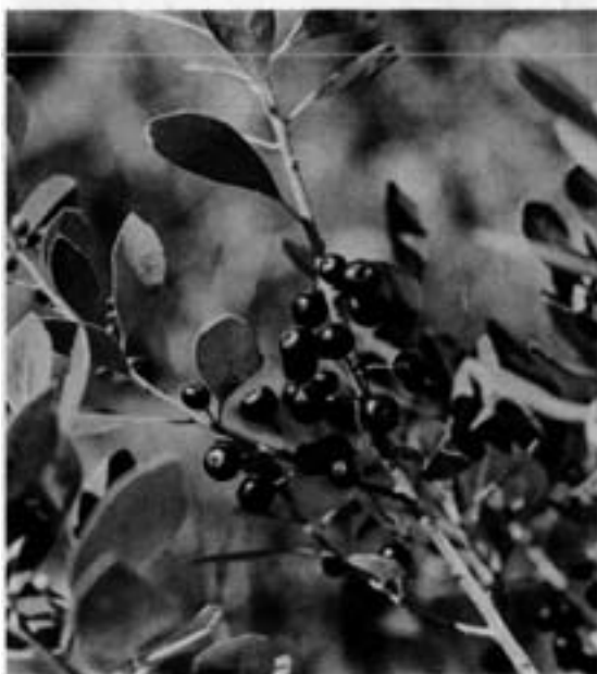
The glossy black fruit of inkberry.

Compelling reasons for the rebirth of interest in I. glabra are its landscape toughness and environmental adaptability. The species displays a penchant for survival under conditions ranging from full sun to moderate shade and from wet to dry, clayey to sandy soils of acid to neutral pH. Inkberry is easily transplanted, literally by pulling it out of the ground and relocating it. Jim Cross of Environmentals Nursery of Cutchogue, New York, relates that it is one of the few broadleaf evergreens that survive in heavy clay soils where irrigation systems continue to operate whether needed or not. Most cultivars, as well as the species, are both field- and container-grown, and are easily transplanted on a year-round basis. Dr. Donald Wyman (1970) mentioned the rejuvenation of weak and spindly plants at the Arnold Arboretum: plants 2.5 meters tall (8 feet) were cut to about 15 centimeters (6 inches) from the ground in April,