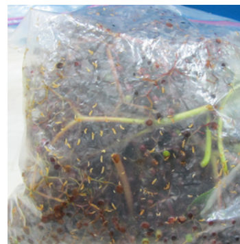
Spotted wing drosophila on blackberry fruit (left); SWD larvae in elderberry fruit (right)

For additional information, check out the Elderberry Financial Decisions Support Tool: https://centerforagroforestry.org/landowners/resources/marketing-economics/