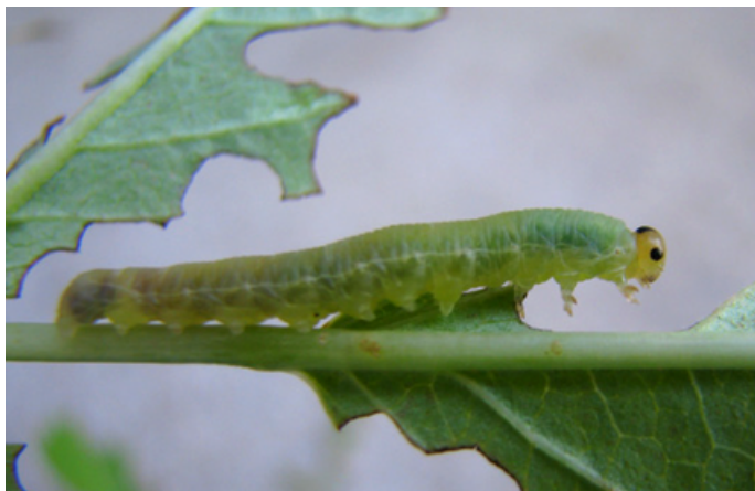
The larva of the elderberry sawfly

Producers must understand that this pest is not a true caterpillar; therefore, certain common control measures for moth and butterfly caterpillars are ineffective against it.