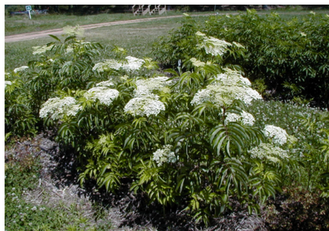
The blossoms of the American Elderberry