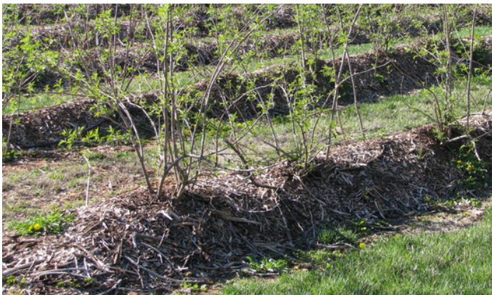
A bermed elderberry planting

Pre-plant soil testing is recommended to evaluate the soil pH and nutrient levels. Adjust pH level to 5.5-6.5, phosphorus level to 50 lbs/acre, and potassium level to 200-300 lbs/acre. Although elderberry tolerates cold temperatures following bud break, it is best to select sites that are elevated relative to surrounding land to reduce the risk of damage from spring frost. Elderberry requires full sun for optimum protection. Control problem perennial weeds such as bermuda grass, johnson grass, blackberry and poison ivy before planting elderberry. Establish a non-competitive ground cover in the alleys between rows to facilitate operations in the planting.