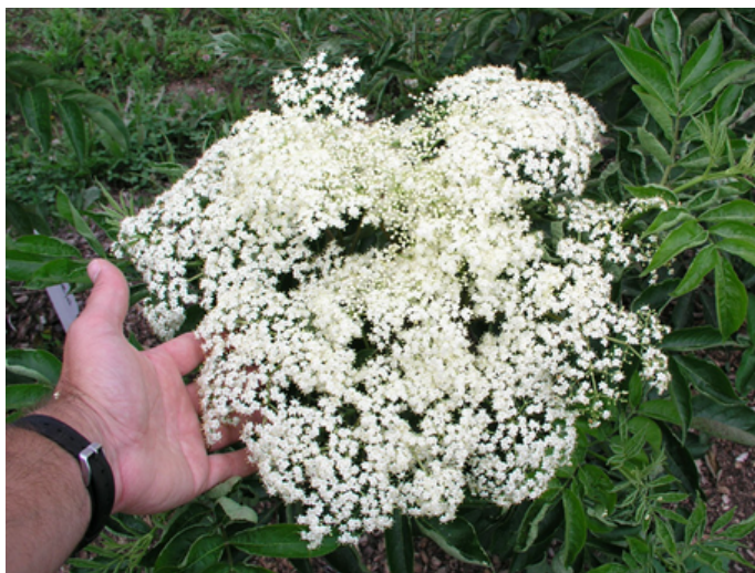
Harvest elderberry blossoms when all flowers are open.

Elderberry fruit harvest takes place in late-July, August, and early-September. At present the Missouri elderberry crop is harvested by hand. Entire cymes are clipped and harvested when all berries are fully colored. The cymes on the current season's shoots ripen several days later than cymes on older wood. Plants that were pruned to the ground the previous winter will usually ripen fruit over 2 to 3 weeks, whereas plants with shoots of mixed age will ripen over a 3 to 4 week period.