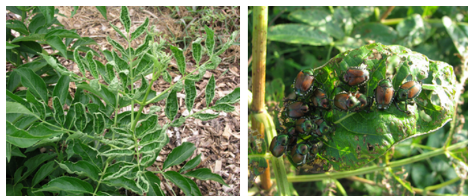
Foliar injury from eriophyid mite (left); Japanese beetle adults and feeding injury (right)

Eriophyid mites ( Phyllocoptes spp.) are microscopic pests that cause cupping and crinkling of the foliage (see first image), and can destroy florets and young fruit in severe infestations. Little is currently known about this important pest, including how best to control or manage it. Eriophyid mites overwinter under buds and bud scales on above-ground portions of the plant; therefore gathering and burning pruned branches in winter may help reduce populations of this pest. These mites may be easily and unknowingly spread by transporting dormant cuttings for propagation.