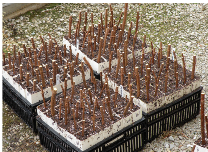
Hardwood cuttings in individual containers

Collect vigorous 2-4 node cuttings from the previous season's growth before budbreak, which typically occurs by early-February. Be sure that the cuttings are not cold-damaged and are free of defects. Cuttings may be rooted immediately or stored under refrigeration for 4-6 weeks for later rooting. A dip of the basal end of the cutting in a commercial rooting powder (0.1% IBA) may increase rooting. Place the basal node(s) below the surface of a well-drained soil or sterilized commercial potting medium. Keep cuttings warm and moist but not wet. The cuttings will usually break bud and begin growing several weeks before rooting, but should be well-rooted within six weeks.