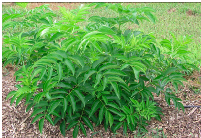
The American Elderberry plant

European elderberry ( Sambucus nigra ) is grown as a commercial fruit crop in Europe and elsewhere. The American elderberry, however, appears to be a better candidate for commercial production in Missouri. This guide outlines production practices and market information for American elderberry, based on research and growers' experiences in Missouri. It is important to note that elderberry remains significantly underdeveloped as a commercial crop. Not very much is known about several aspects of elderberry production, including