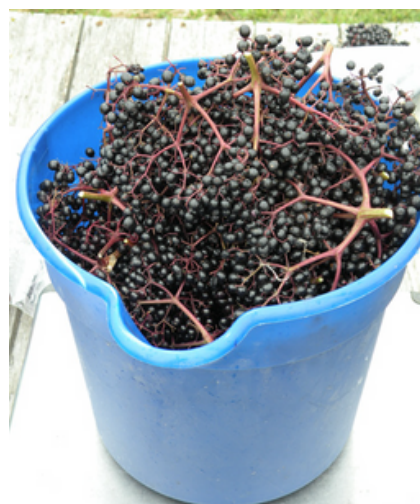
Elderberry fruit are harvested when all berries in the cyme are fully colored.

Harvest plants at weekly intervals. Harvest early in the day for best fruit quality. CAUTION: Be careful when picking elderberries from the wild, as the railroad and road crews often spray just before they are ready to harvest. Yields may range from 2 to 4 tons per acre for mature bearing plantings, though higher yields have been recorded. Harvested fruit is highly perishable; refrigerate at 32-40°F as soon as possible after harvest.