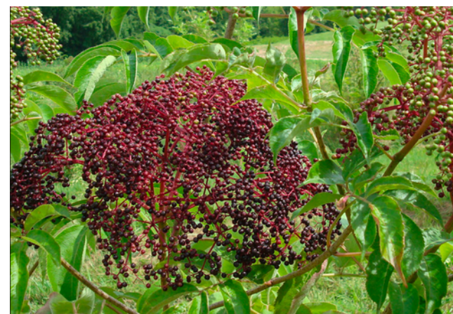
The fruit of the American elderberry