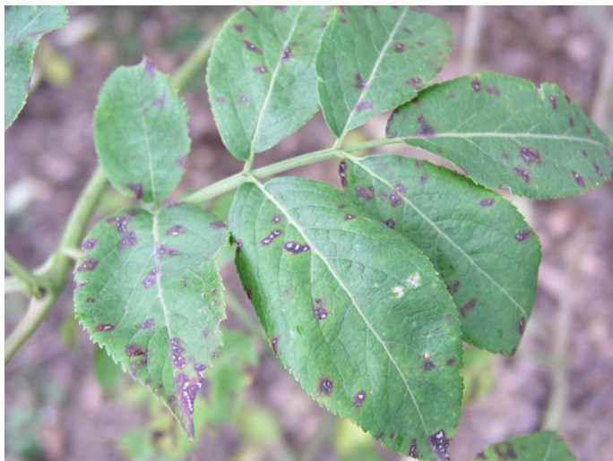
Bacterial spot on elderberry foliage

A bacterial leaf spot disease tentatively identified as Pseudomonas viridiflava (see image below) has caused economic damage to elderberry in Missouri. Little is known about this disease or how to manage it.