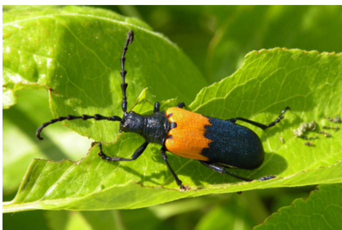
Elderberry longhorn beetle adult

Elderberry longhorn beetles, also known as elder borers ( Desmocerus palliatus ), feed on foliage and flowers as adults (see above image) and bore into the stems and roots as larvae. This boring may cause weakness, breakage, or death of stems. These beetles are often present in elderberry orchards in early-summer, but not usually in economically significant numbers. Hand removal of the adults may be an effective control measure in small plantings. Economic threshold numbers are unknown for elder borer; however, commercial producers should carefully monitor populations and be prepared to control them if damage is significant.