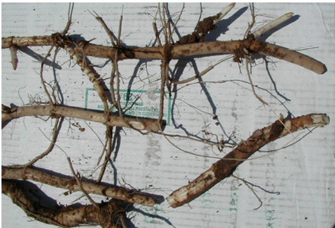
Elderberry root cuttings

Softwood cuttings typically root well until about July 1; rooting percentage drops as the summer progresses. Root cuttings (pencil diameter or slightly smaller, 4-6 inches long) may be dug in late February before growth begins (Fig. 6). The root cuttings are placed horizontally in a flat or pot, covered with \frac{3}{4} to 1 inch of a light soil or soilless medium and kept warm and moist. Often, a single root cutting will produce 2-3 plants.