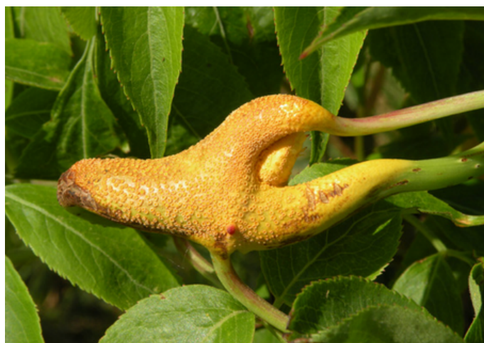
Elderberry rust on leaf blade (top) and petiole (bottom)

Netting or scare tactics can help protect the elderberry crop from bird predation.