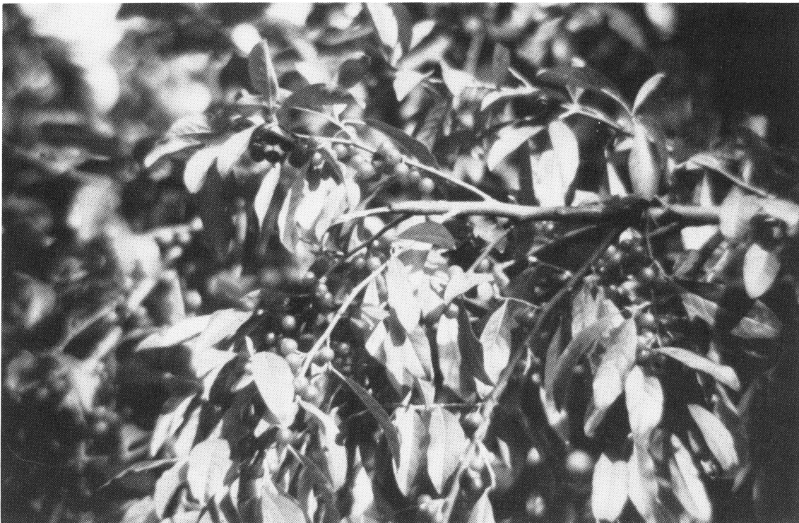
Figure 5. Autumn olive branches laden with fruit in mid-fall at Grenada Lake, Mississippi

Birds have been reported to eat the fruit from ripening in September to late winter. Davison (1967) and DeGraaf and Witman (1979) listed the fruit as a choice food of the eastern bluebird,* cardinal, catbird, mockingbird, robin,