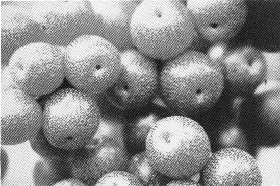
Figure 2. Close-up of mature fruit of Cardinal autumn olive

different climatic regions. The general characteristics described above pertain to all varieties; specific information on time of flowering and fruiting refers to the Cardinal variety. Additional traits specific to other cultivars are discussed below.