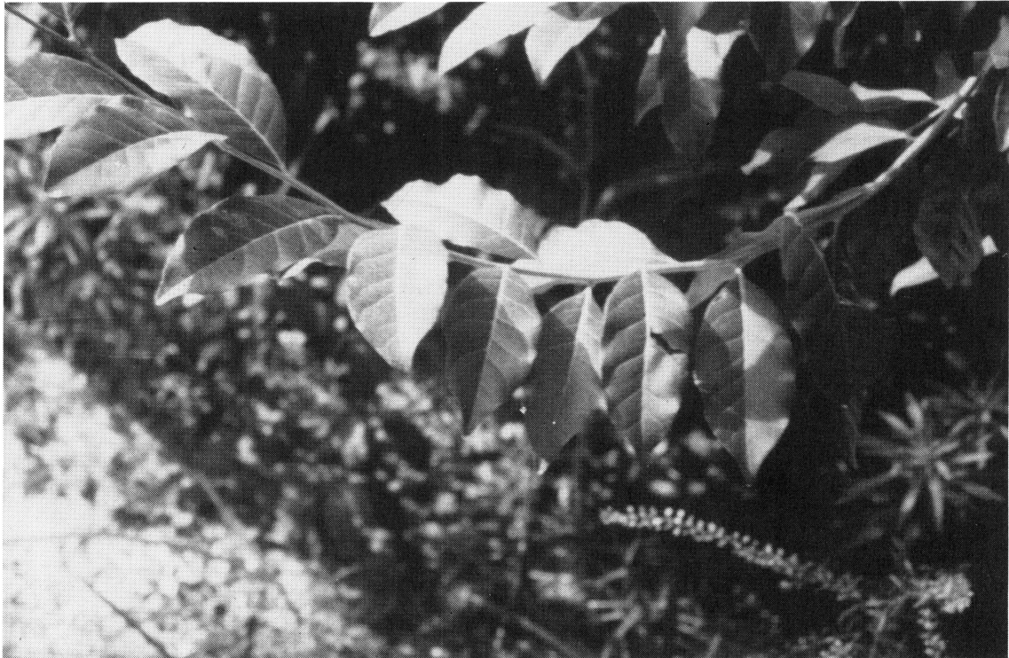
Figure 1. Typical growth form and leaf shape of Cardinal autumn olive ( Elaeagnus umbellata )