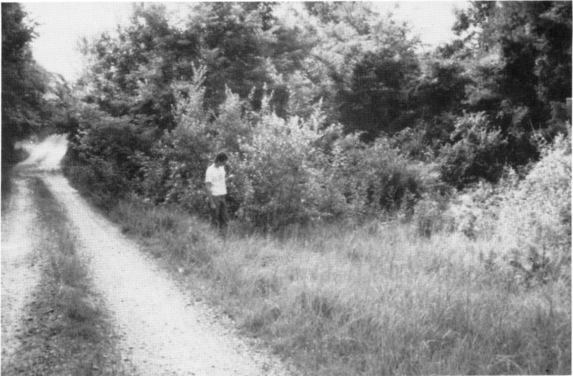
Figure 4. Autumn olive plantings established as a border along a field edge (top), and as a barrier or screen along an interior road (bottom)