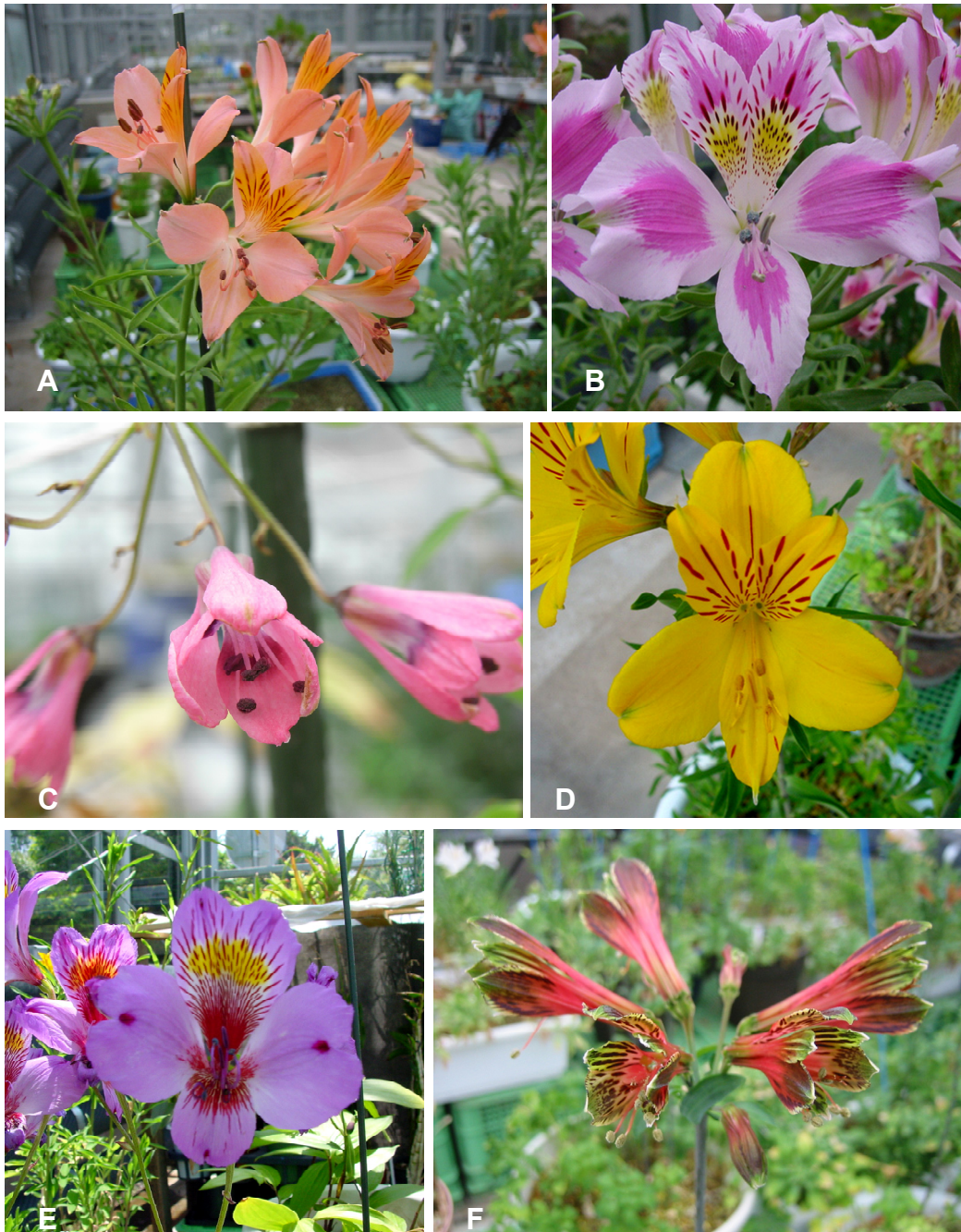
Fig. 1 Representative flowers of the Alstroemeriaceae family. (A) Alstroemeria ligtu ; (B) A. pelegrina var. rosea ; (C) Bomarea salsilla ; (D) A. aurea ; (E) A. magenta ; (F) A. psittacina .