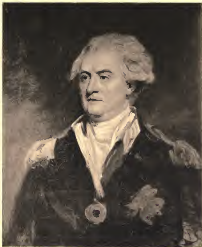
John Hoppner R.A. pinx 1785