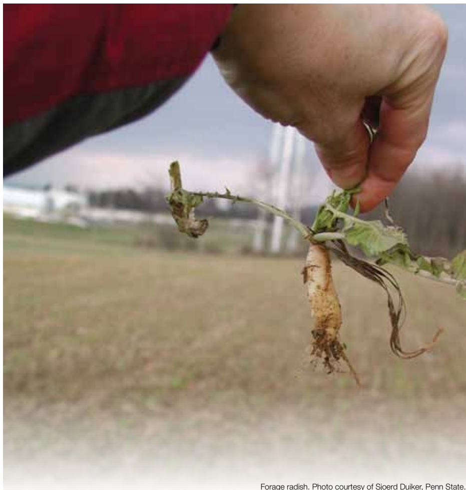
Forage radish.

If you want to reduce soil compaction, good cover crop choices are radish, canola, turnip (and hybrids), sugarbeet, sunflower, and sorghum-