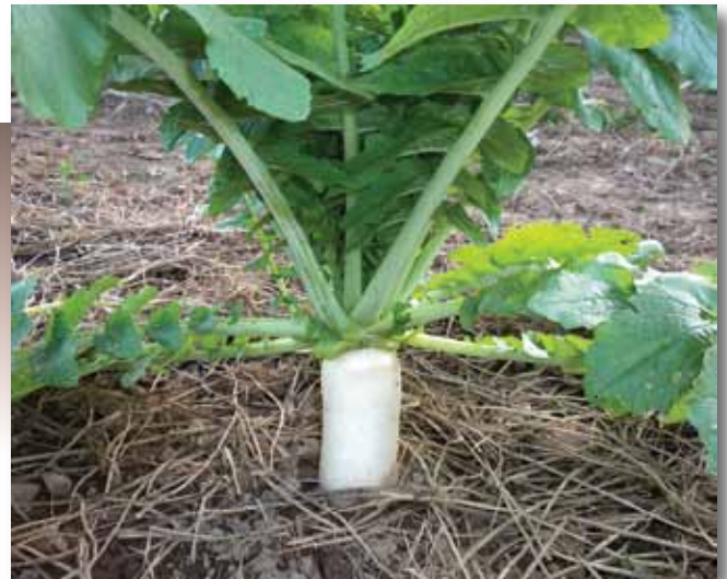
► Left: Oilseed radish taproot compared with 1-ft ruler. Right: “Tillage radishes” can be used as a biological tool to reduce the effects of soil compaction.

Oilseed radish seed is generally more expensive than seed of other cover crops commonly grown in Michigan.