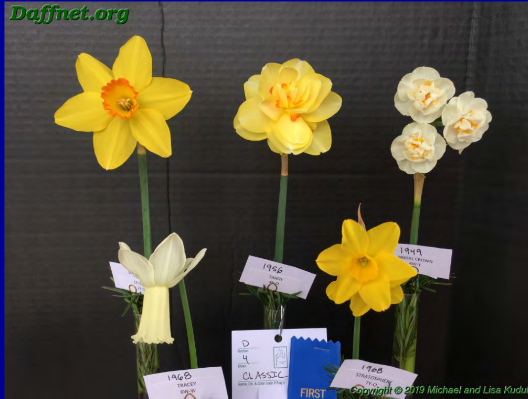
Back: 'Ceylon' 2Y-O (1943), 'Tahiti' 4Y-O (1956), 'Bridal Crown' 4W-Y (1949); Front: 'Tracey' 6W-W (1968), 'Stratosphere' 7Y-Y (1968) exhibited by Bridget Bryant