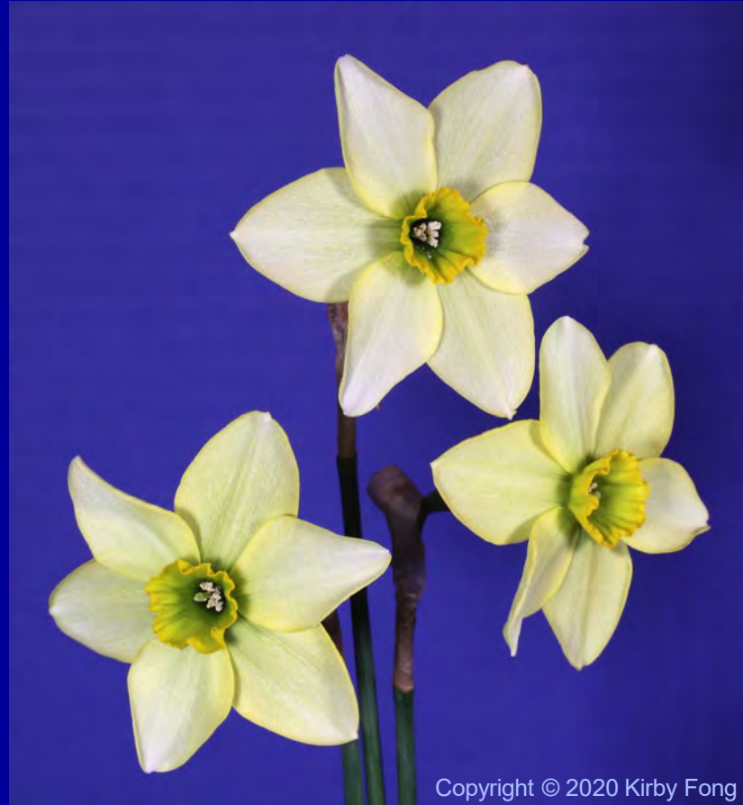
'Mesa Verde' 12G-GGY exhibited by Larry Force