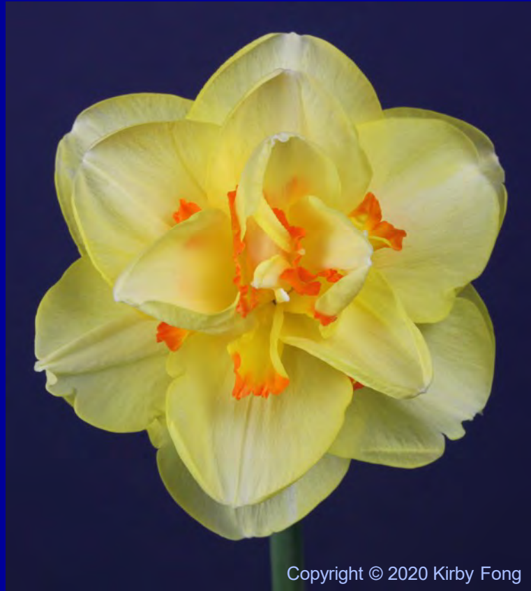
'Tahiti' 4Y-O (1956) exhibited by Kirby Fong