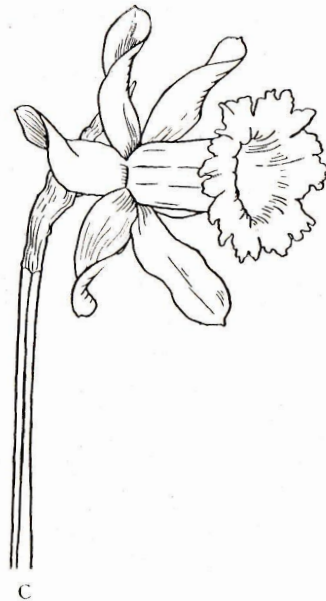
FIG. 30.— NARCISSUS HISPANICUS MAXIMUS .