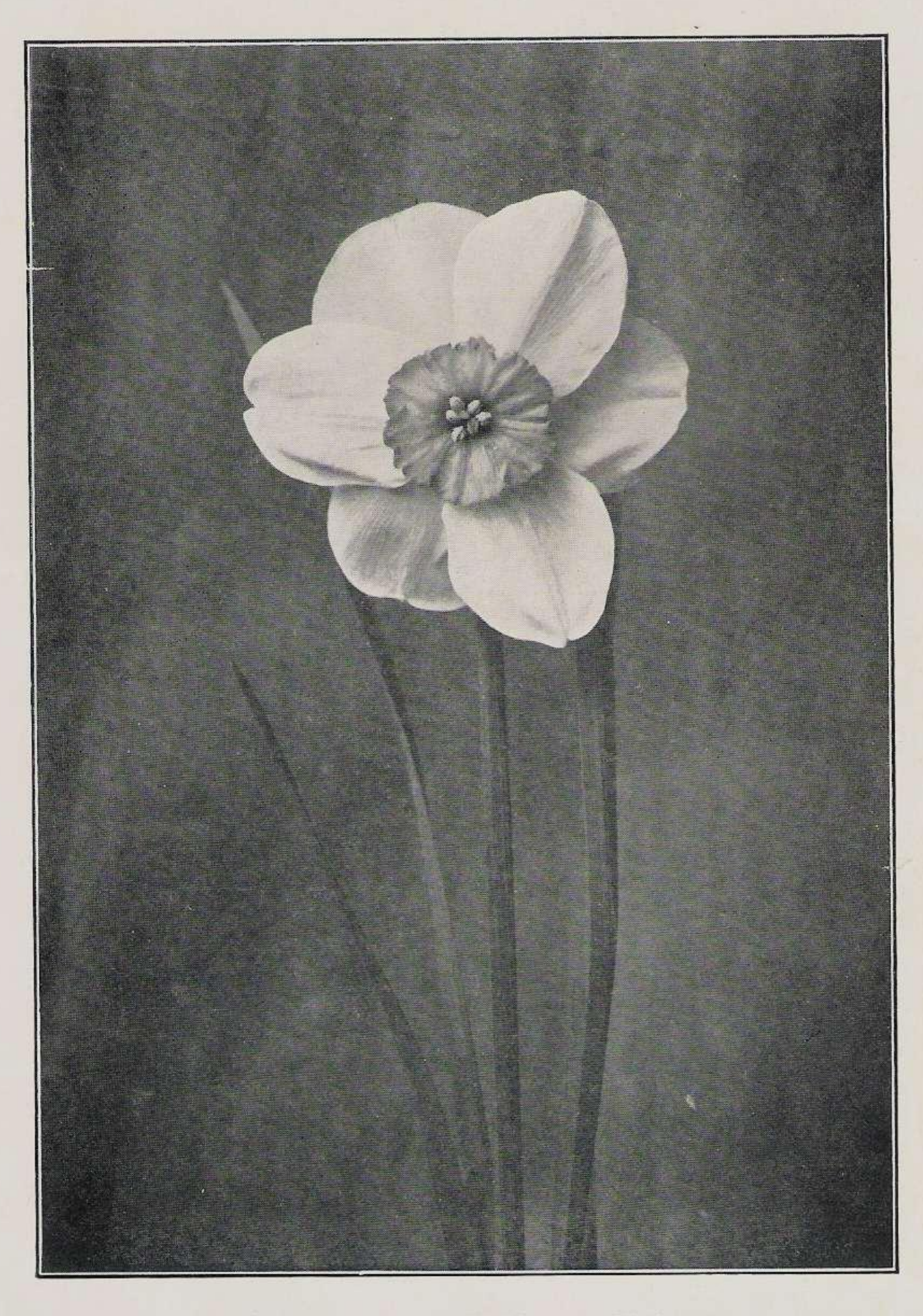
Narcissus "HENRY JAMES." The most striking Novelty of 1911.