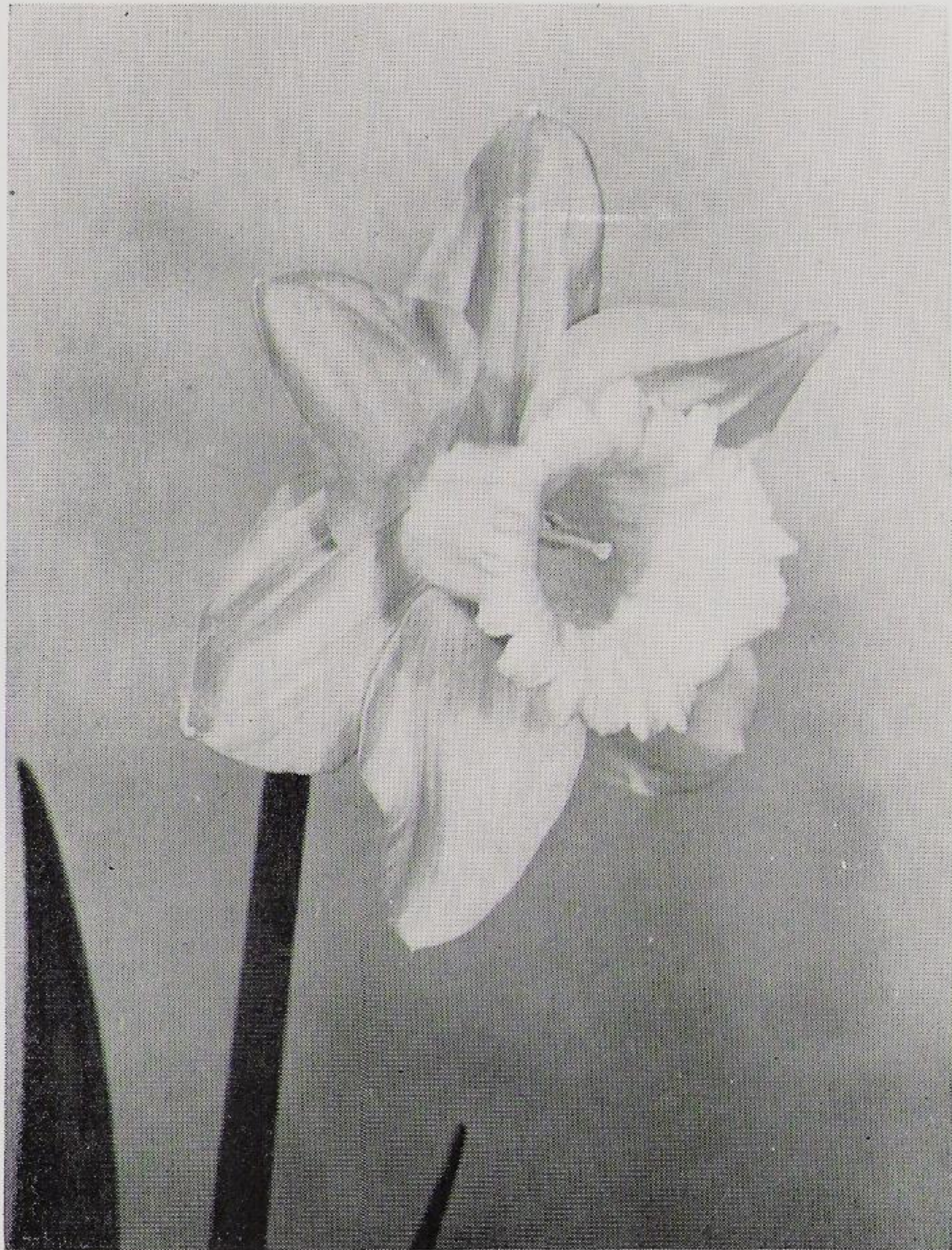
LUNAR SEA (Mitsch) One of the few good reverse bi-color trumpets.