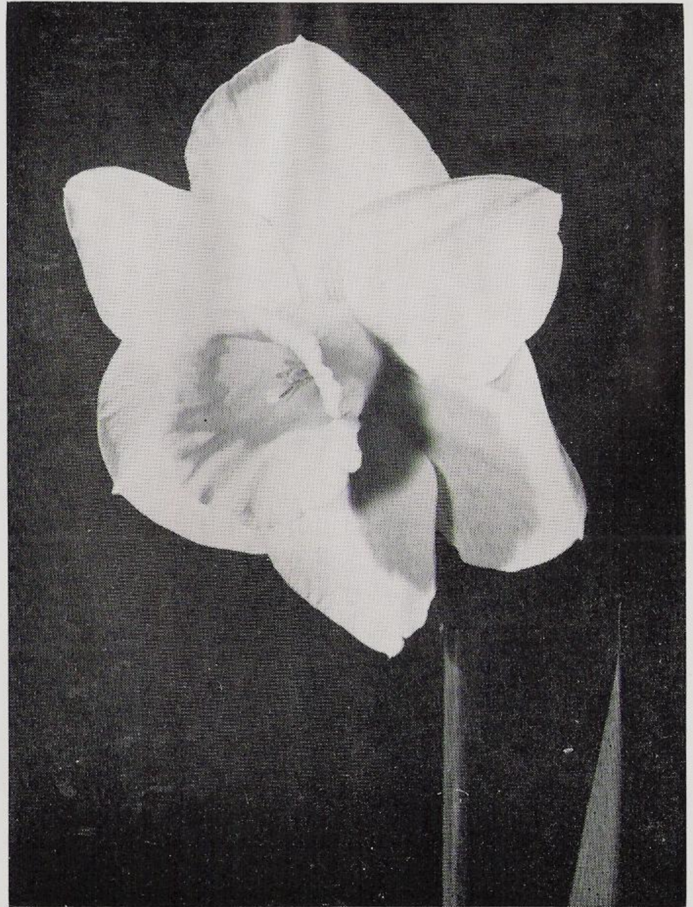
FESTIVITY (Mitsch) A very fine 2B on the order of the famous "Tudor Minstrel"