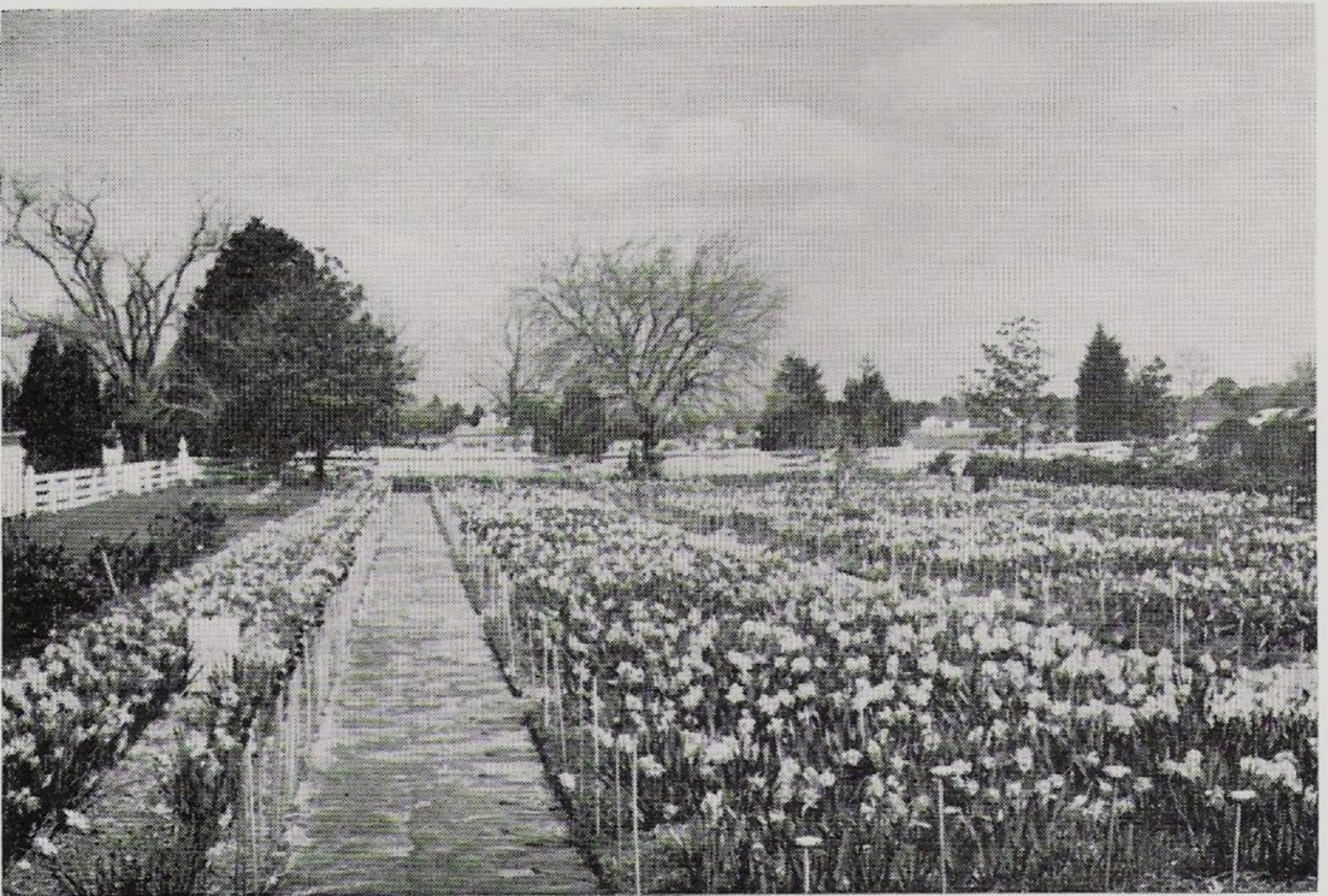
Two views of the famous display Garden of the Little England Daffodil Farm, showing over 500 varieties of the best daffodils.