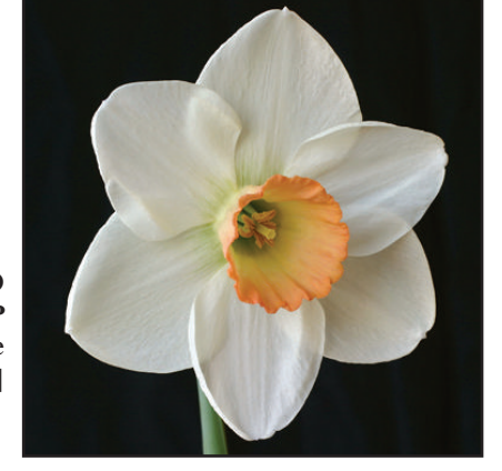
National Show, St. Louis, MO 'Fragrant Rose' 2 W-GPP Exhibitor, Topher Geigle