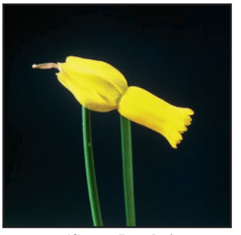
'Super Psyche' 6 Y-Y