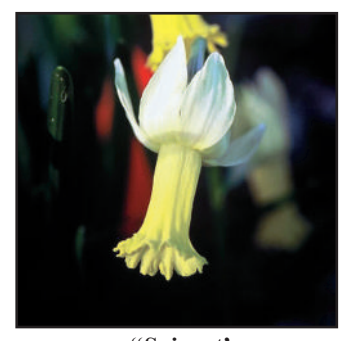
"Snippet' 6 W-Y