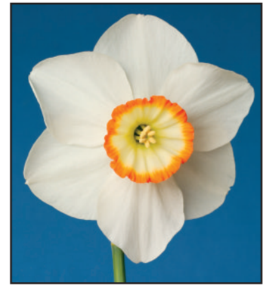
Fortune, CA, seedling #05-3-8 2W-YYO, exhibitor, Bob Spotts