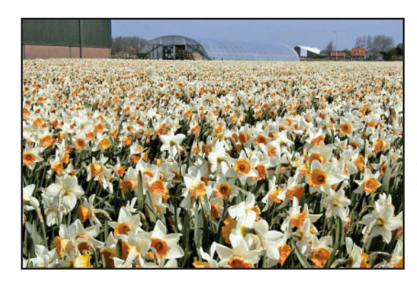
A field of 'Chromacolor' in the Netherlands