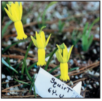
'Squirt' 6 Y-Y