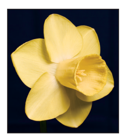
Lake Oswego. OR – 'American Classic' 2 Y-WYY, exhibitor, Elise Havens