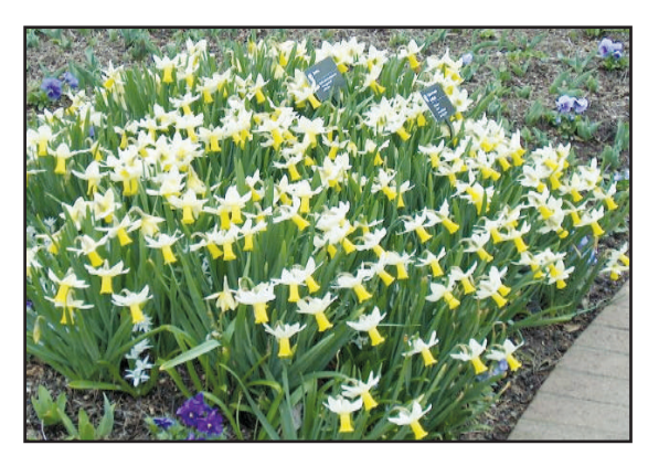
'Trena' at MOBOT