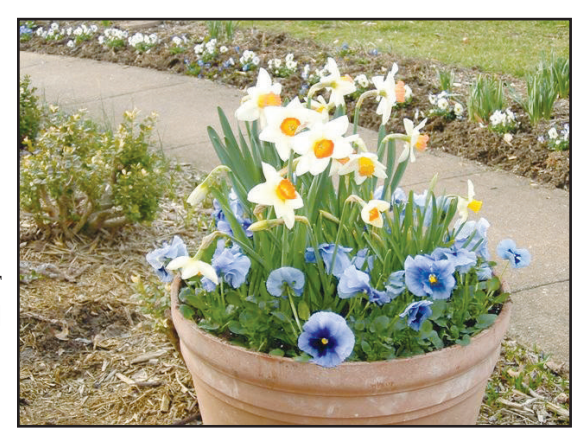
Container Daffodils at MOBOT