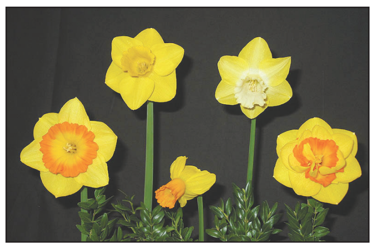
Knoxville, TN exhibitor, Lois Van Wie, 'Miss Primm' 2 Y-Y (Dorwin), 'Swedish Fjord' 2 YYW-W (Mitsch), 'Multnomah' 2 Y-O (Evans), 'Jetfire' 6 Y-O (Mitsch), 'Southern Hospitality' 4 Y-R (Havens)