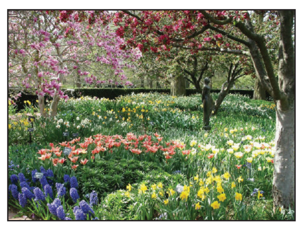
A garden scene at MOBOT