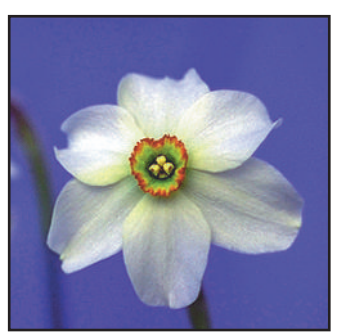
'Haiku' 9 W-GYR