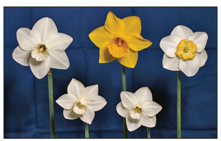
Lake Oswego, OR exhibitor, Theresa Fritchie 'Williamsburg' 2 W-W (Pannill), 'Gold Coin' 2 Y-Y (Havens), 'Nordic Rim' 3 W-WWY (Mitsch), 'Bella Coola' 2 W-W (Evans), 'Estuary' 2 W-GWW (Evans).