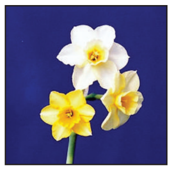
'Gee Willikers' 8 W-W