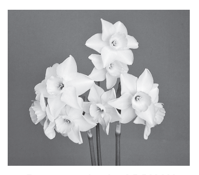
'Perpetuation' 7 YYW-W

Many acclimated award winning cultivars from Jackson's Daffodils of Tasmania, Australia available.