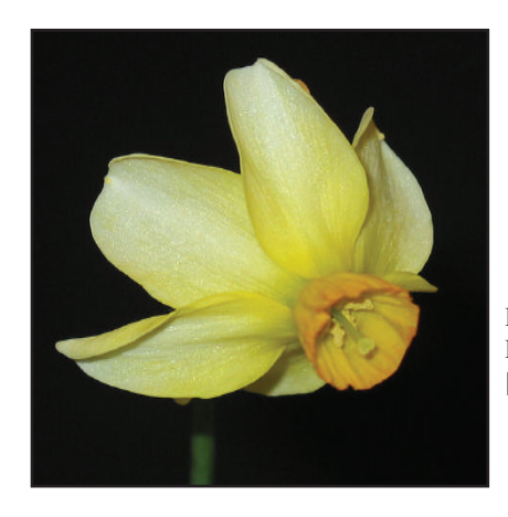
Knoxville, TN 'Beryl' 6 W-YYO Exhibitor, Mikail Moore