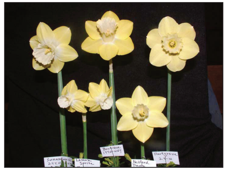
Niles, MI. Nancy Pilipuf, exhibitor. Top Row: 'Xunantunich' 2 YYW-WWY, 'Boutique' 1 YYW-WWY, 'Hartgrove' 2 Y-W Bottom row: 'Lemon Sprite' 7 YYW-W, 'Helford Dawn' 2 Y-W