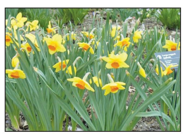
'Monal' at MOBOT