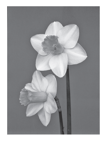
'American Dream' 1 Y-P