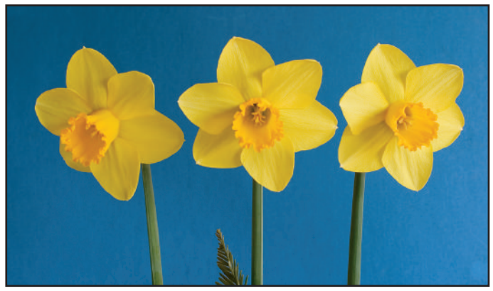
Livermore, CA 'Lackawanna', 2 Y-Y exhibitor, Bob Spotts