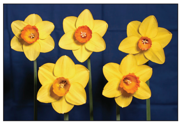
Lake Oswego, CA Exhibitor, David Smith. Top row" 'Falstaff' 2 Y-R, 'Lennymore' 2 Y-O, 'Cauldron' 2 Y-R Bottom row: 'Happy Fellow' 2 Y-O, 'Hot Gossip' 2 Y-R