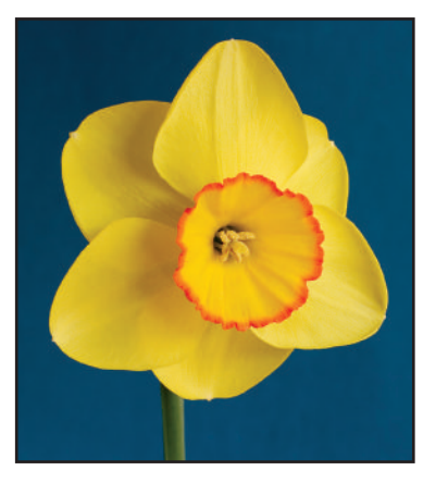
Livermore, CA – 'Pacific Rim' 2 Y-YYR, exhibitor, Bob Spotts