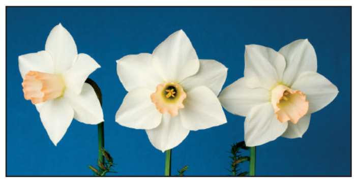
Fortuna, CA DuBose seedling #N7-100, 2 W-P exhibitor, Steve Vinisky