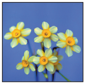
'Edgedin Gold' 7 W/Y-Y