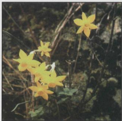
Photo 3. N. cuatrecasii showing more starry form