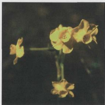
Photo 9. N. jonquilla var. minor

Photos by Steve Hampson except as noted (see story on page 206)