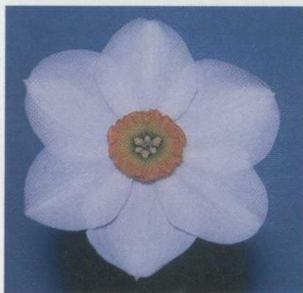
'Molly Malone Cook' photographed indoors with a flash and diffuser