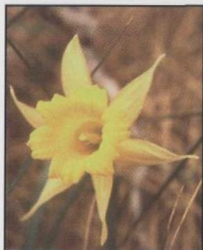
Photo 13. N. pseudonarcissus subsp. eugeniae