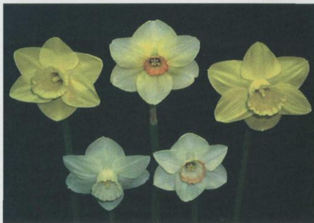
Digital photograph demonstrating auto-white exposure

ther store them in TIFF or a very large JPEG file (.jpg). TIFF stands for Tagged Image File Format and is the best file format for printouts and publishing (.tif). If you want to submit photos to a magazine for printing, TIFF is a really good choice.