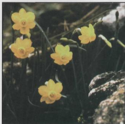
Photo 2. N. cuatrecasii