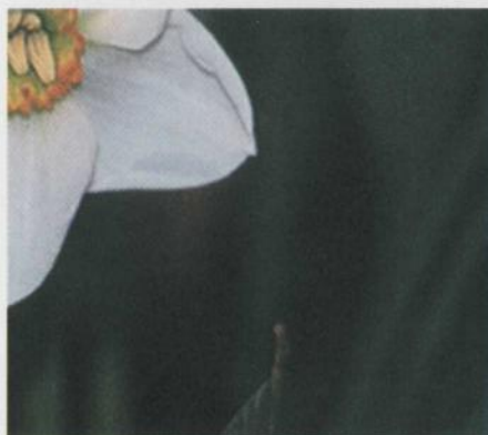
Closeup in an optical view due to parallax effect

Answer: Yes, and that was used to illustrate the differences in light balance or exposure; that could also tie into the effect of lighting. As I said, you have different lighting choices on a camera: you can use a tungsten setting which is going to filter out that yellowish tone you saw on the digital image on the screen. Those images were all taken using my older camera which did not have those options. I had to use a piece of Kleenex or something to cover the flash to make it not so strong. And then it also created that tone of the tungsten lights in the indoor facility where I was taking the picture.