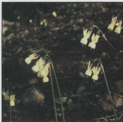
Photo 8. N. triandrus pallidulus