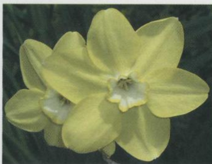
'Lemon Supreme' shot outdoors