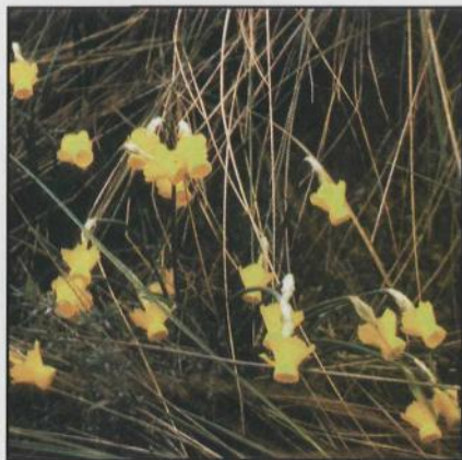
Photo 4. N. cuatrecasii showing extreme reflex