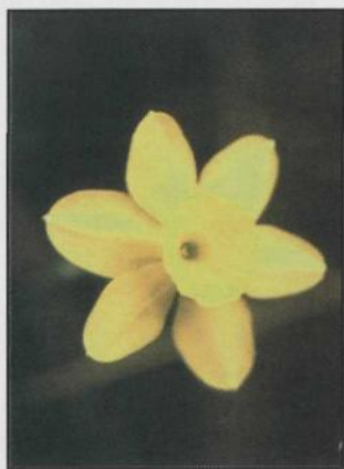
Photo 6. N. rupicola