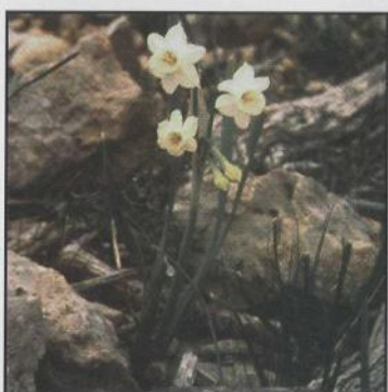
Photo 12. N. dubius