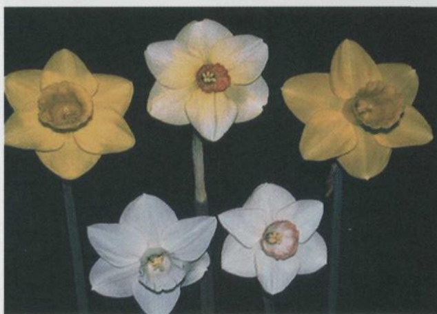
35mm photograph using automatic flash

Question: Tom, could you tell us what kind of camera you're using to take the photos which you've put on Daffnet?