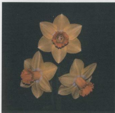
'Iroquois' shot using a flash and diffuser

(see story on page 258)