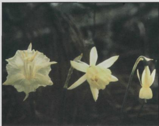
Photo 5. N. hedreanthus (l.), N. x cazorlanus (center), N. triandrus pallidulus (r.)