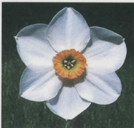
'Molly Malone Cook' photographed outdoors with natural light