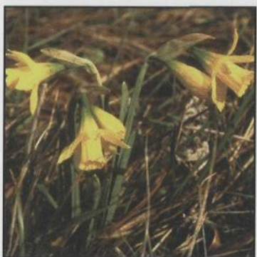
Photo 11. N. alcaracensis