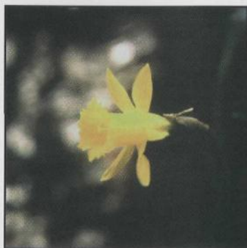
Photo 10. N. perez-chiscanoi