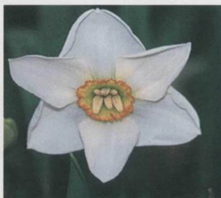
Closeup as seen in the LCD screen