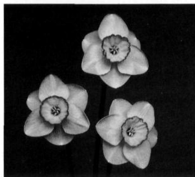
'Pacific Rim' 2Y-YYR