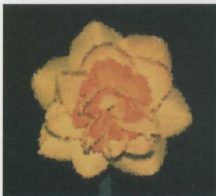
Mechanical digital zoom effect